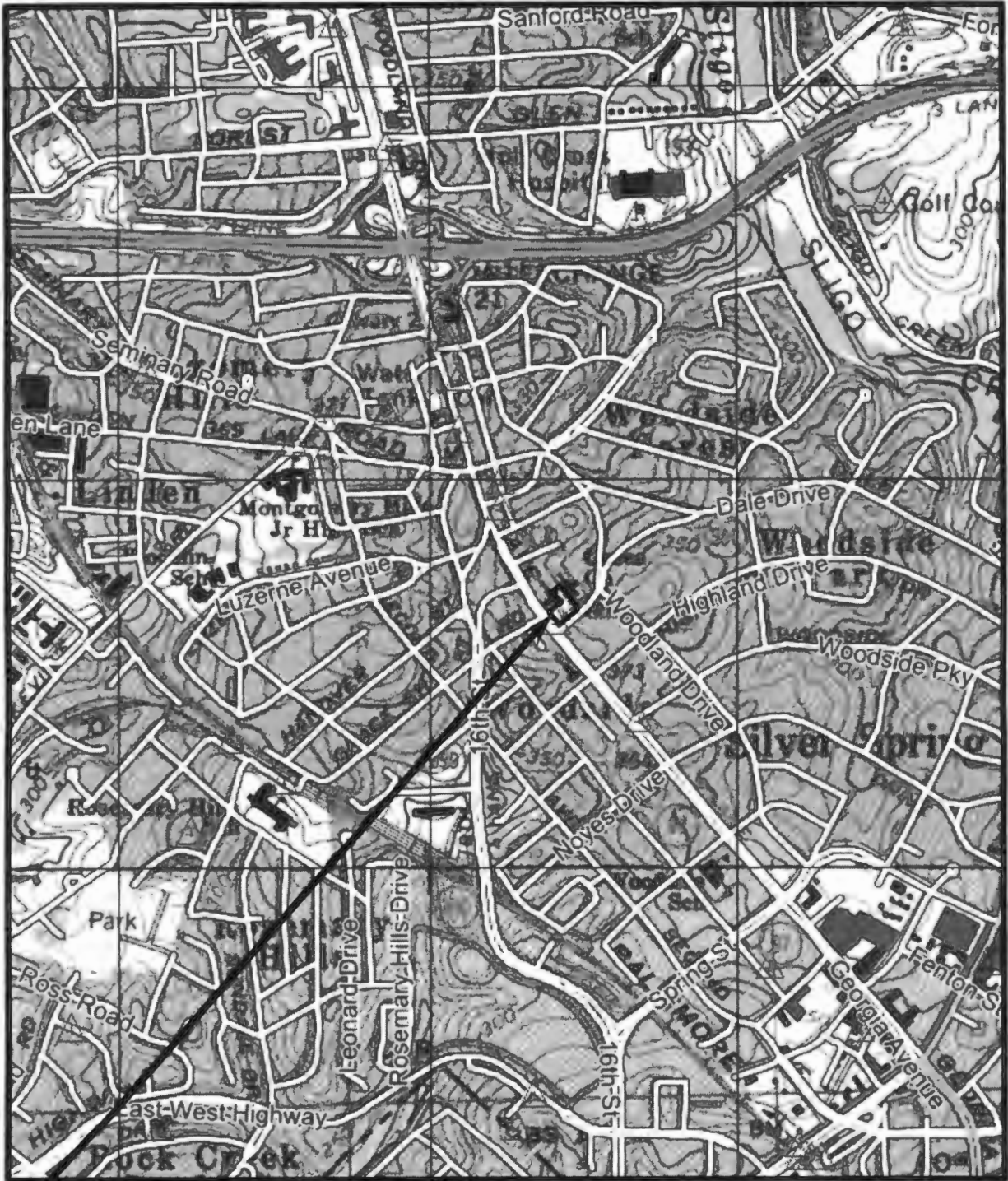
Grace Episcopal Church Cemetery & Confederate Monument (M: 36-4-1) Montgomery County, Maryland Kensington Quadrangle, USGS Topographic Map, 1965, Revised 1979 EHT Traceries, 2013