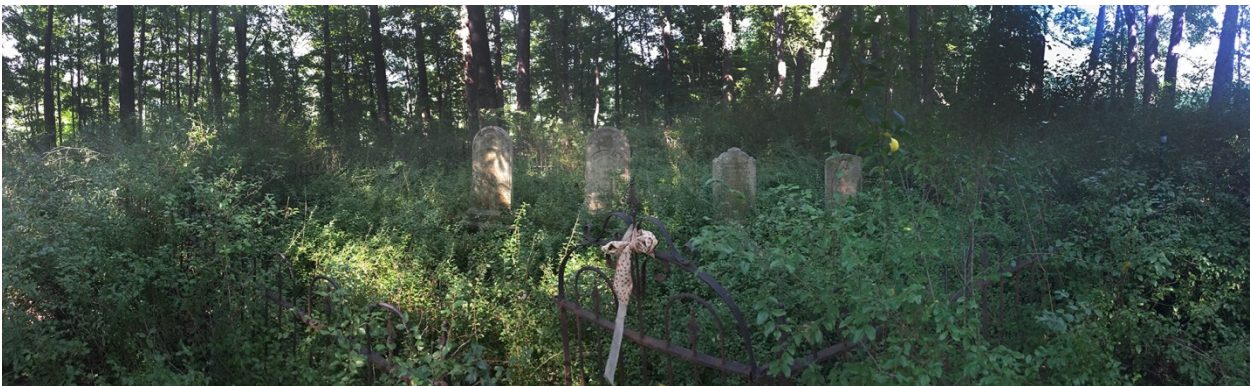
3. Panoramic of enclosed cemetery from south to west to north