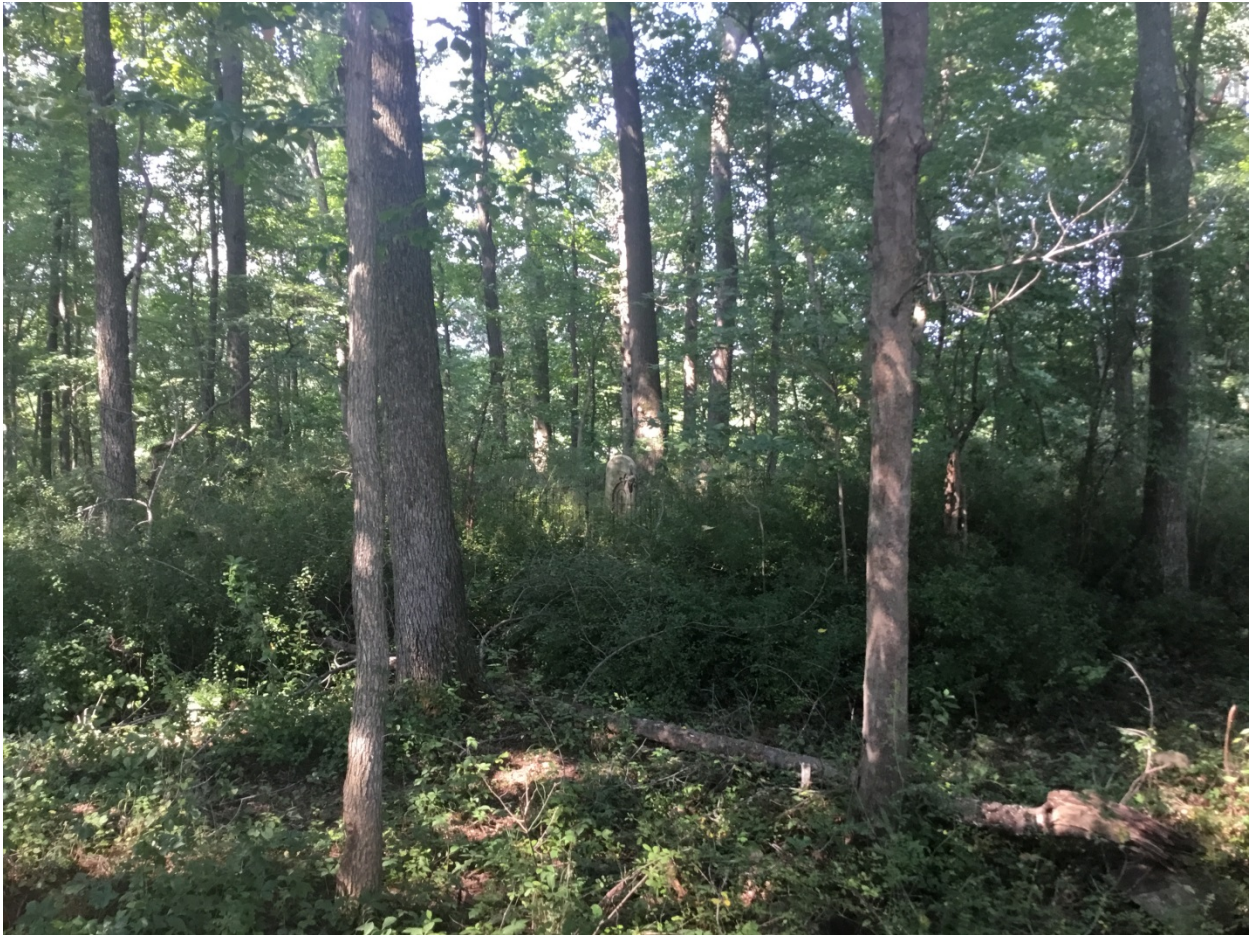
2. Approach to enclosed cemetery in woods, facing south