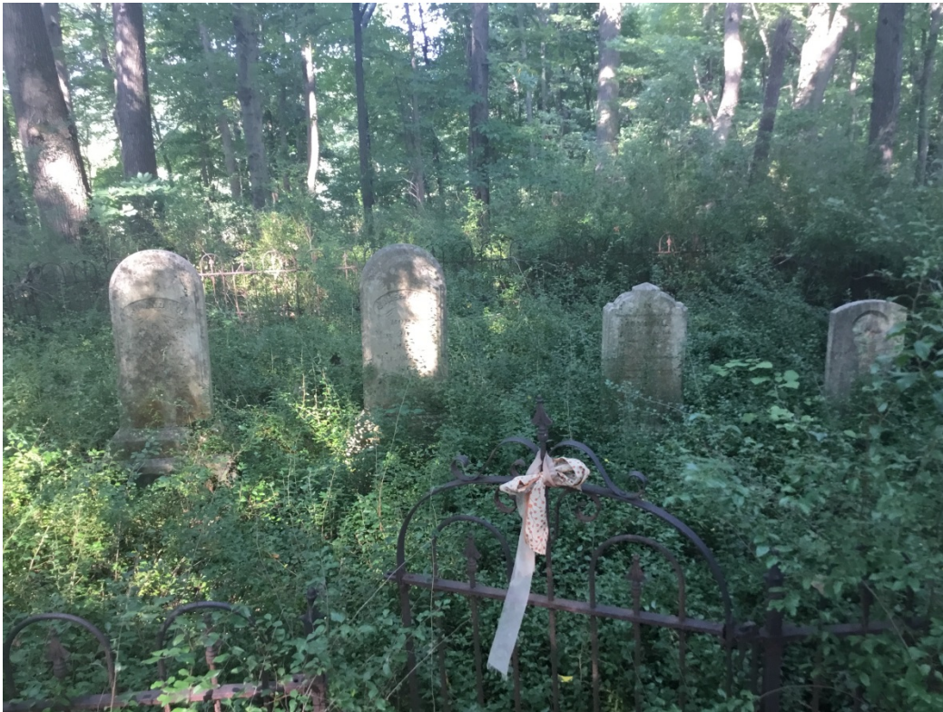
4. Private family plot enclosed by wrought iron fence, facing west