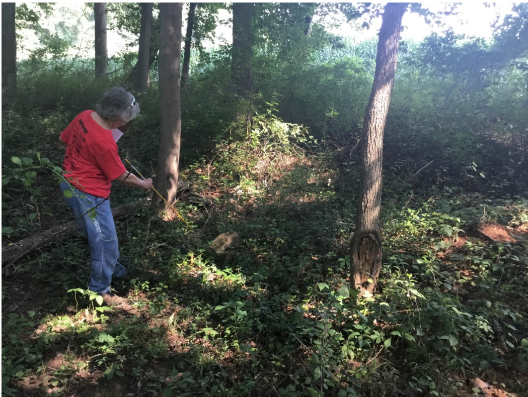
5. Numerous field stones, periwinkle, gopher holes, facing north