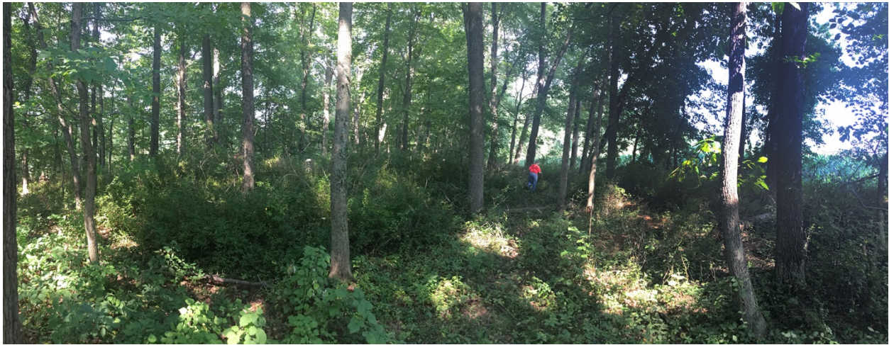
6. Enclosed cemetery surrounded by field stones, from chapel location