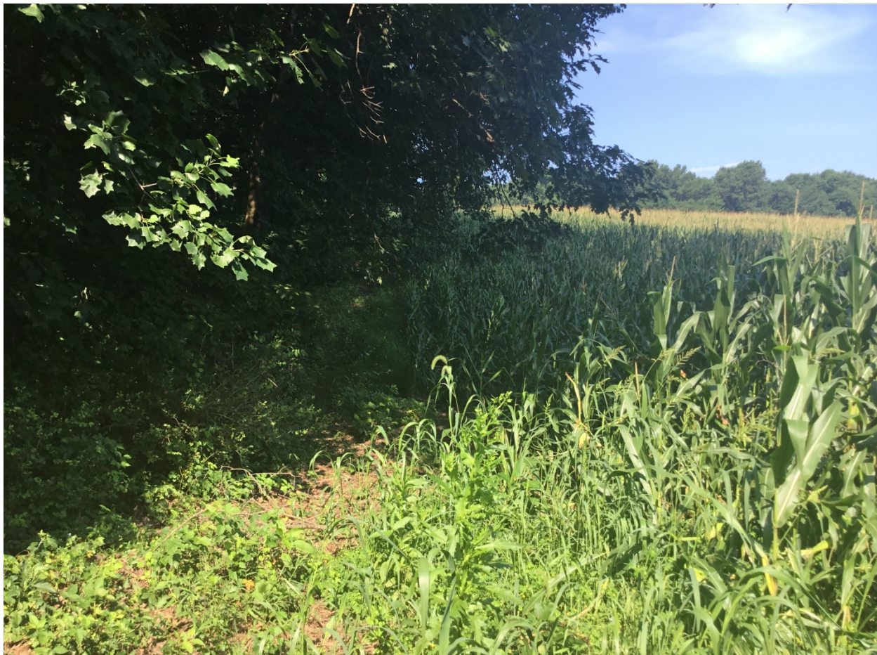
1. Access up hill to cemetery in woods on left, facing west