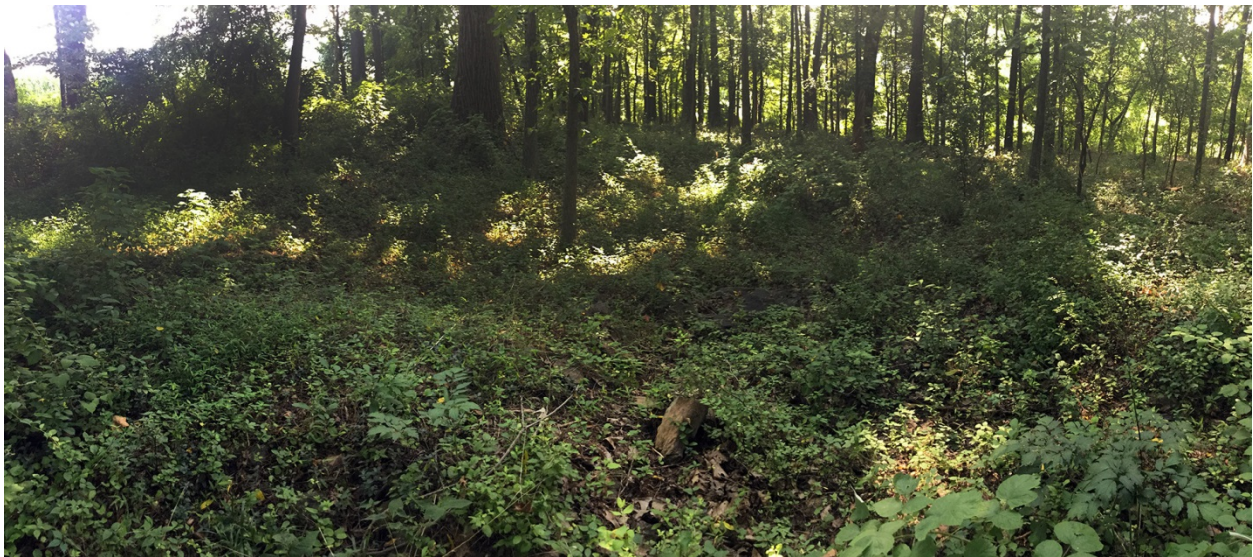
7. Former footprint of the Chapel of Ease