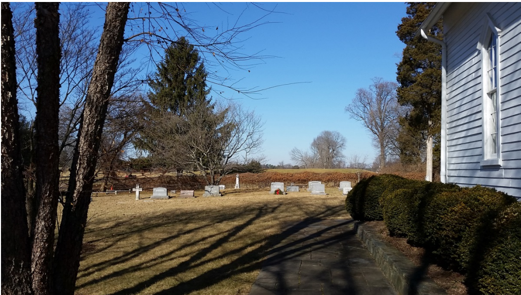
3. Approach to cemetery beside church, facing north