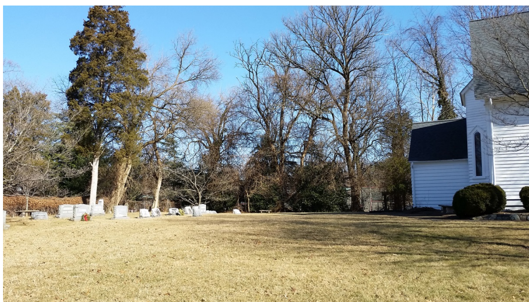
7. View toward back of church, facing east