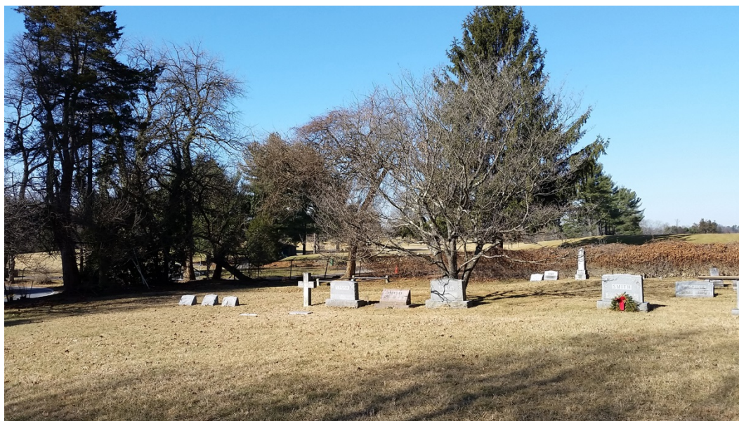
6. View toward center of cemetery, facing north-west