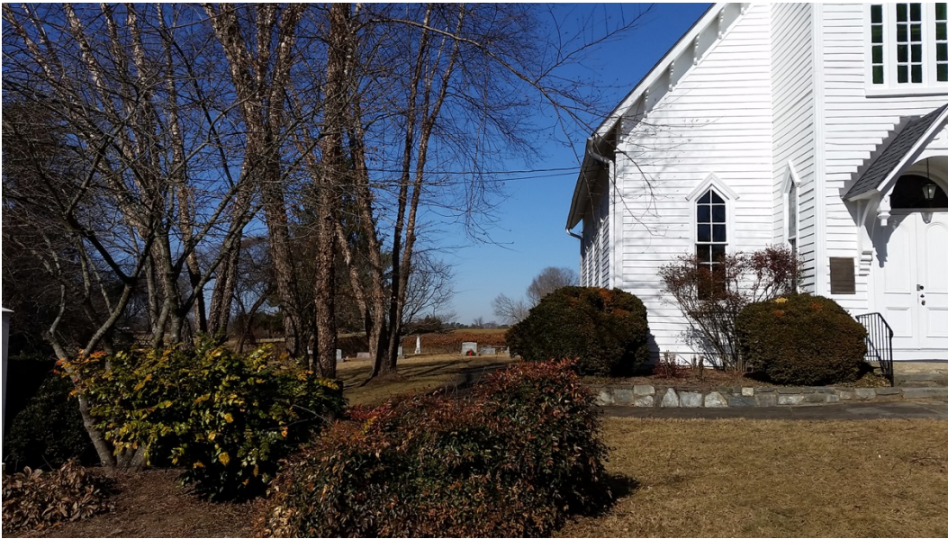
2. View to cemetery behind church, facing north