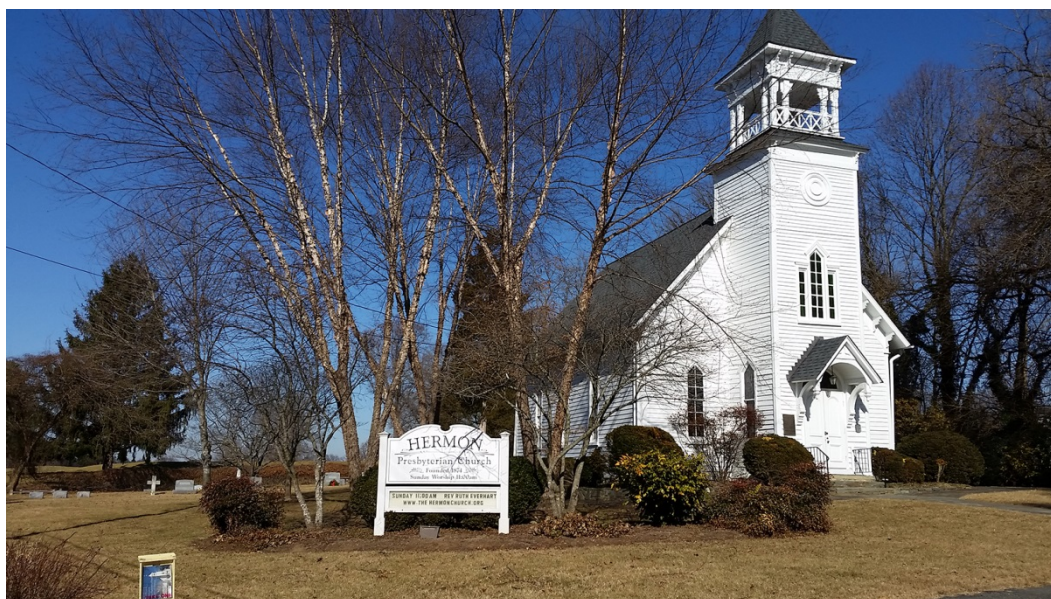
1. View from Persimmon Tree Lane, facing north