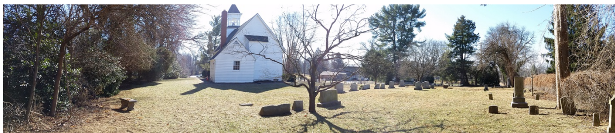
5. Panoramic from east to south to west