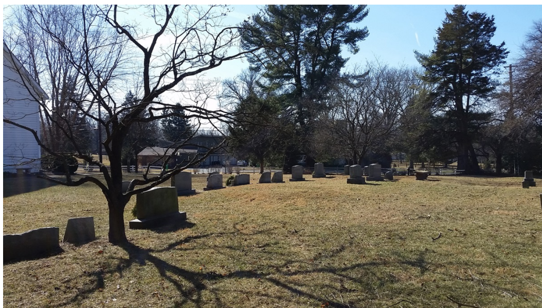
8. View of cemetery, facing south