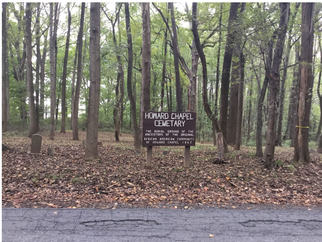
1. Cemetery sign along Howard Chapel Road, facing west