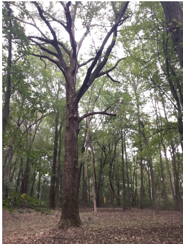
6. Giant, dead maple tree that needs to be removed before it falls