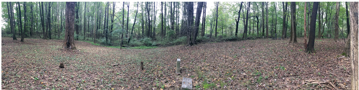
3. Panoramic from west to north to east