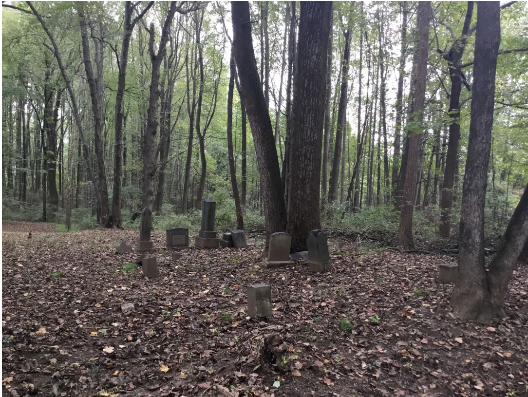
2. Approach to cemetery, facing west