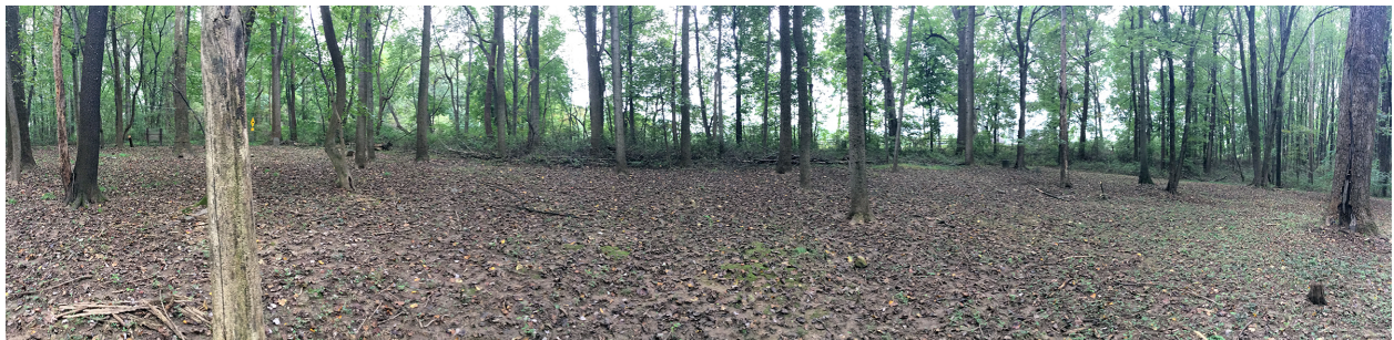
4. Panoramic from east to south to west