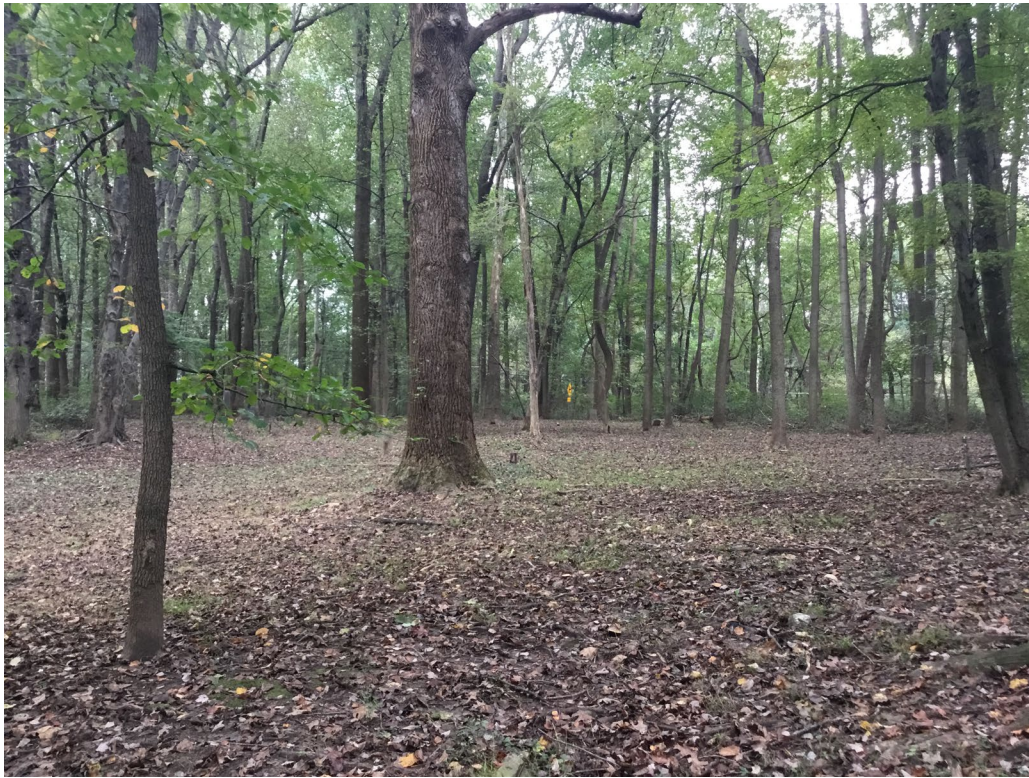
5. View from west border of cemetery toward Howard Chapel Rd, facing east