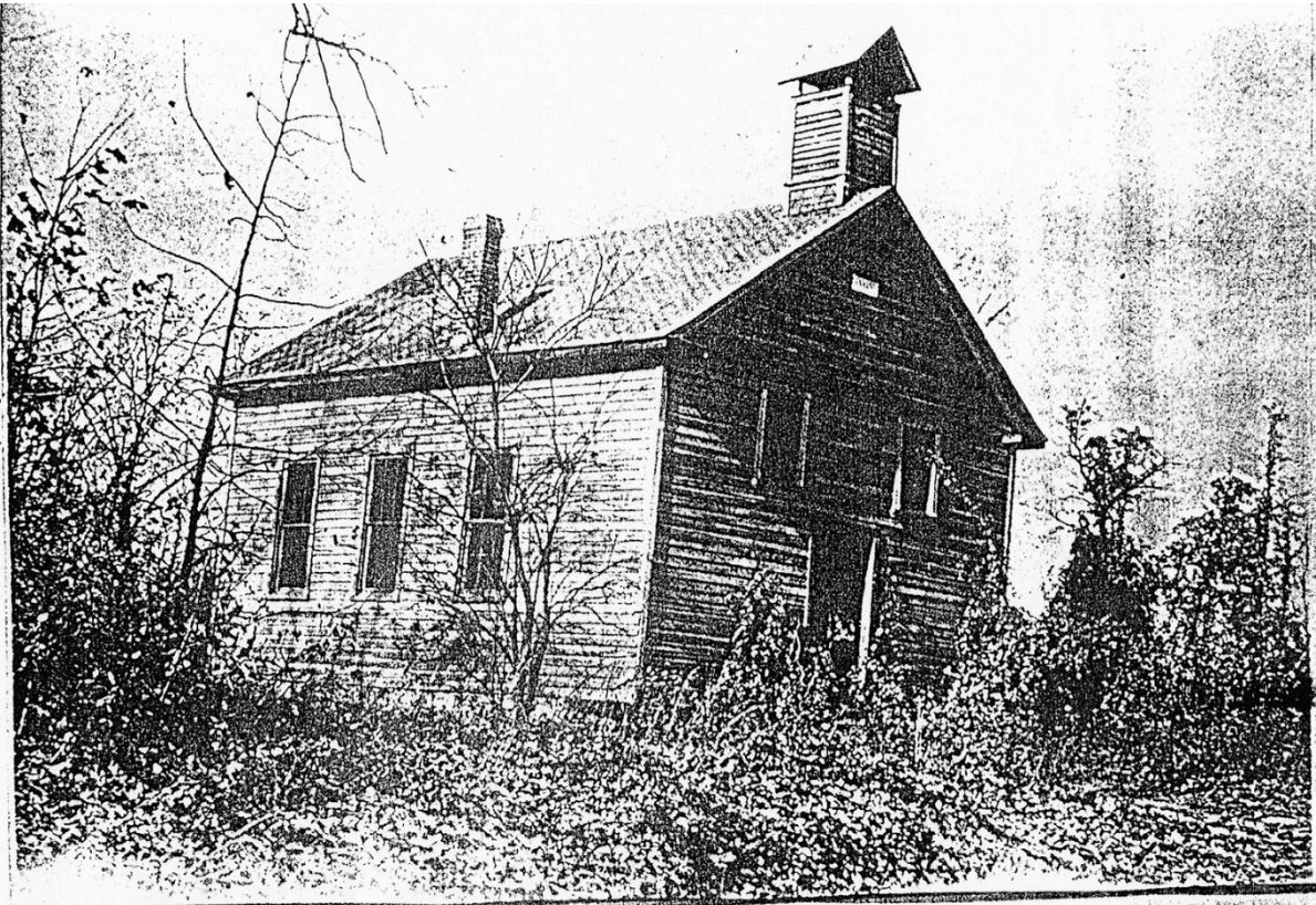
Howard Chapel Built 1889 Burned 1976

7. Howard Chapel. Built in 1889. Burned down in 1976.