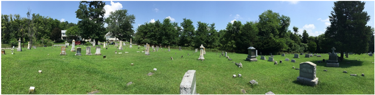
2. Panoramic from west to north to east