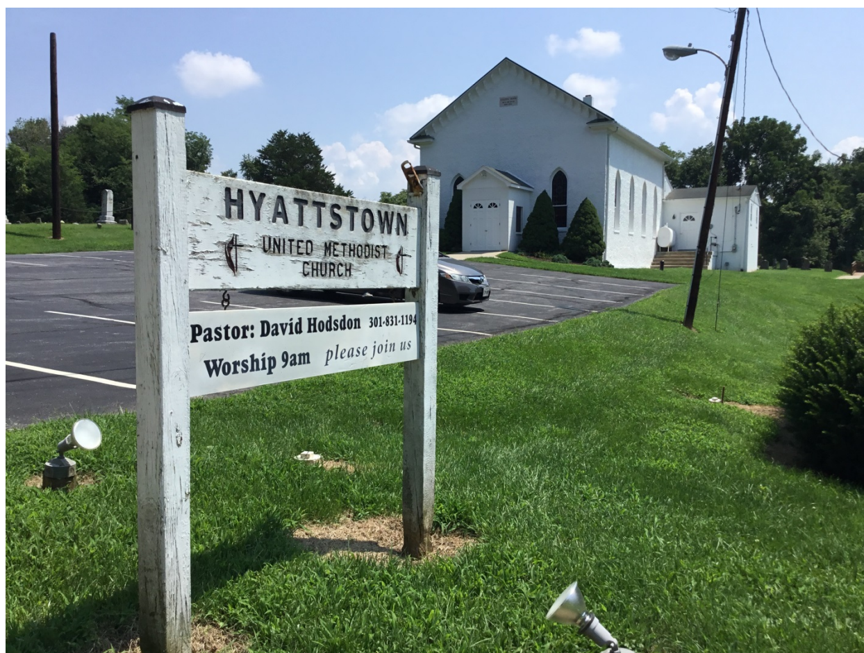
1. Entrance to Hyattstown UM Church, facing east