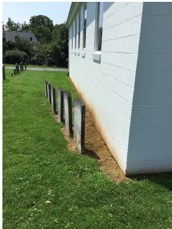
6. Graves possibly under foundation of a church extension building