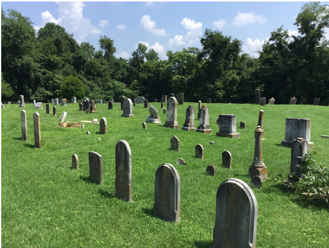
5. Older section located east of the church, facing north