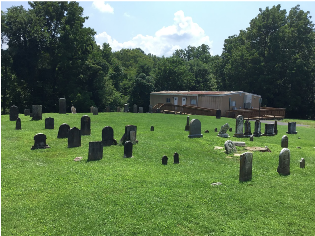
4. Older section located east of the church, facing south