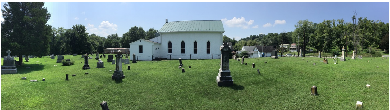
3. Panoramic from east to south to west