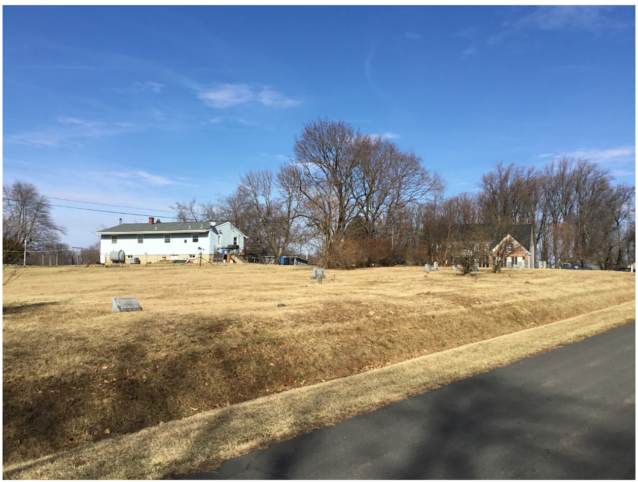
1. Approach to cemetery, facing north-east