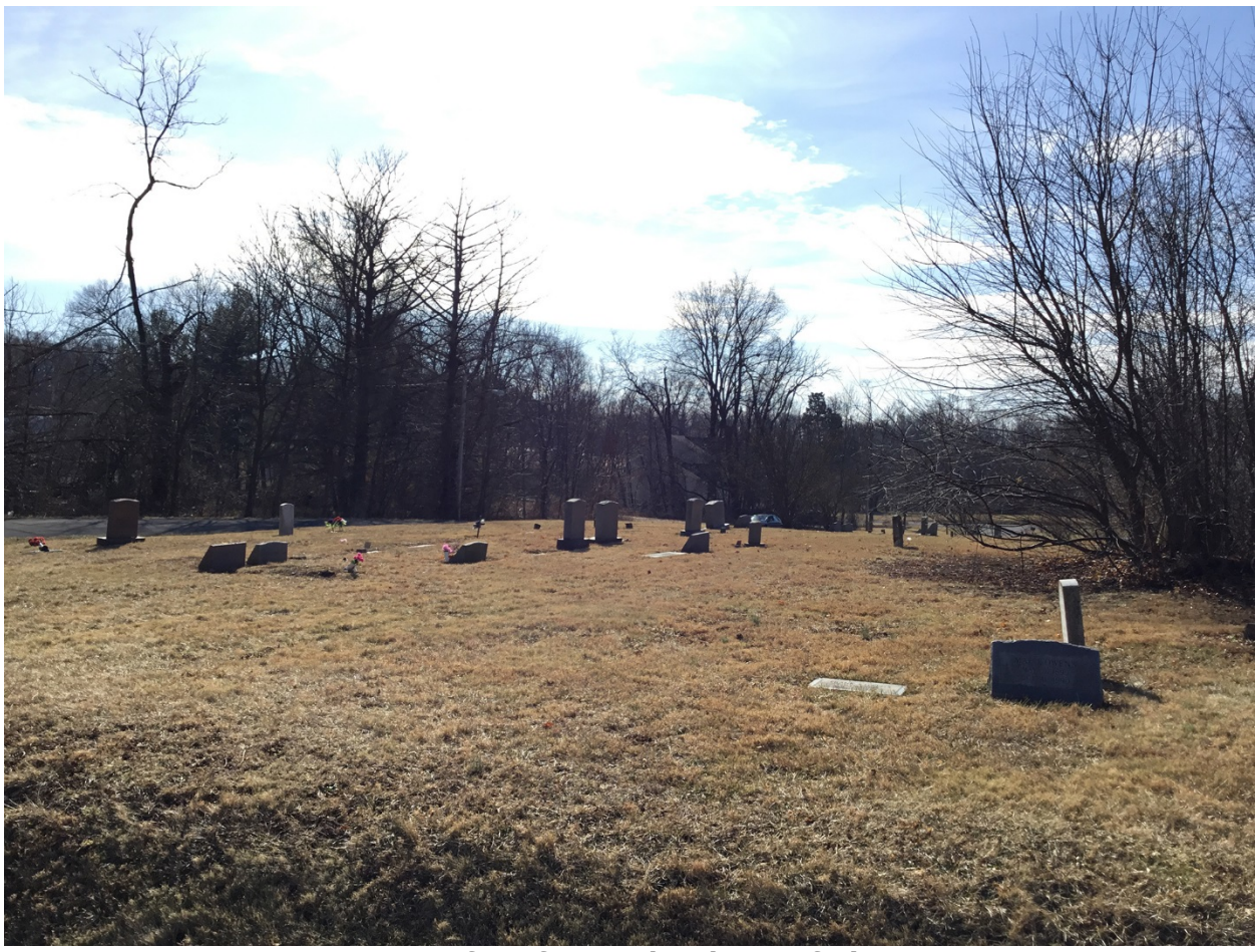
3. Cemetery from former church area, facing west