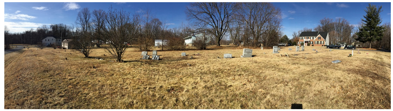
2. Panoramic from west to north to east