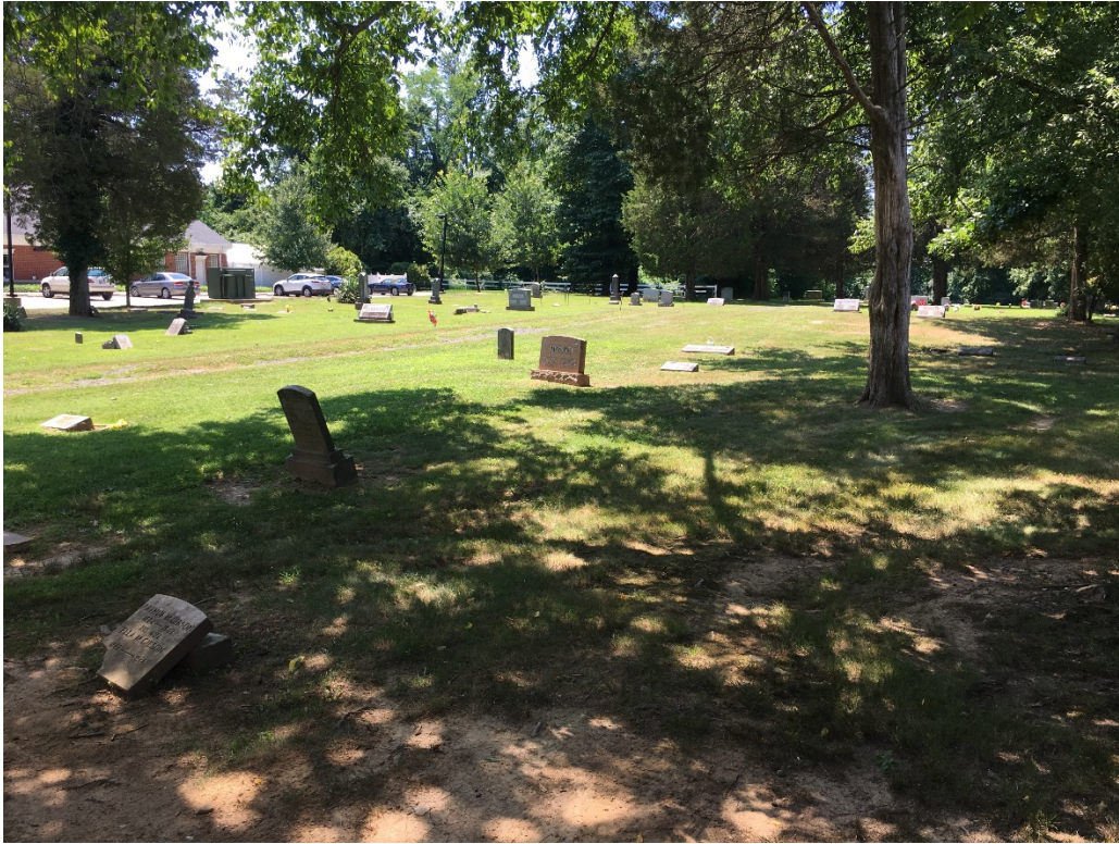
4. North side of cemetery, facing south