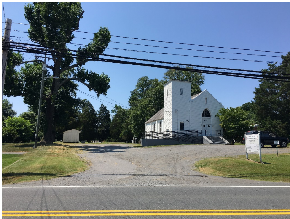
1. View of church and cemetery from Frederick Road, facing southeast