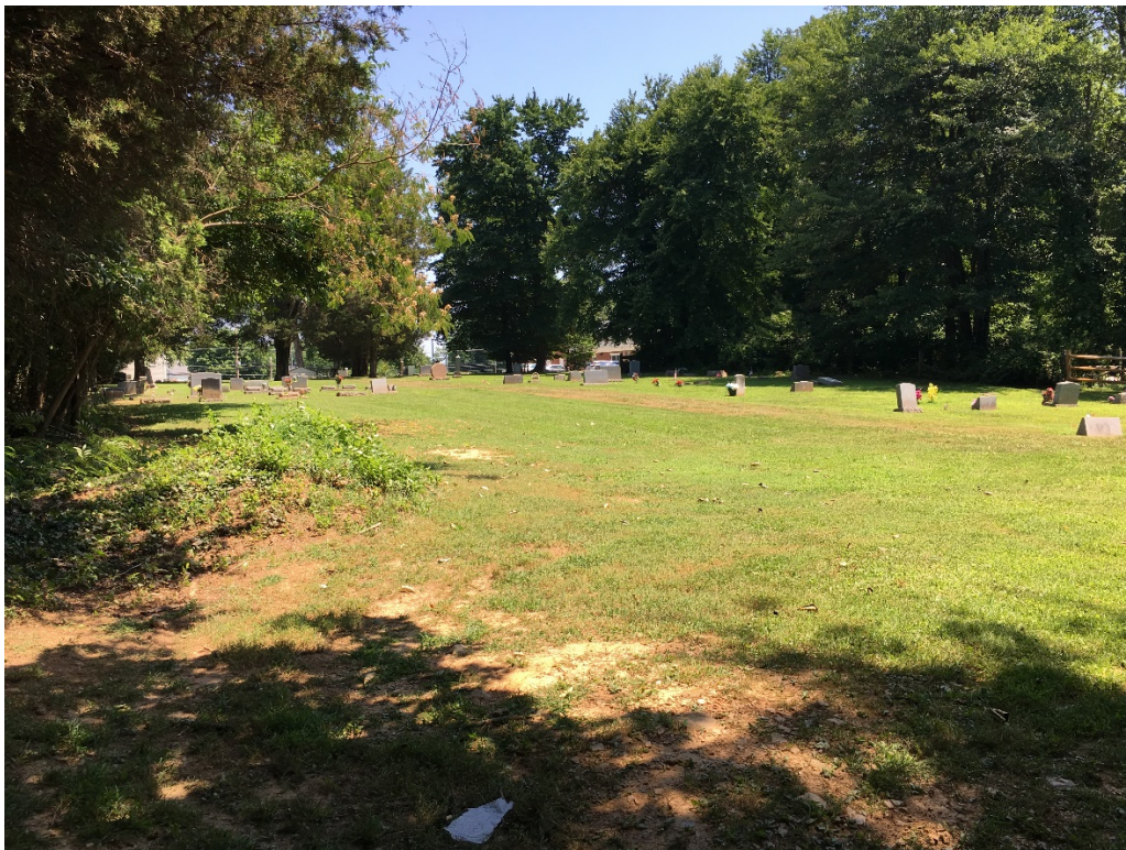
5. South side of cemetery, facing north