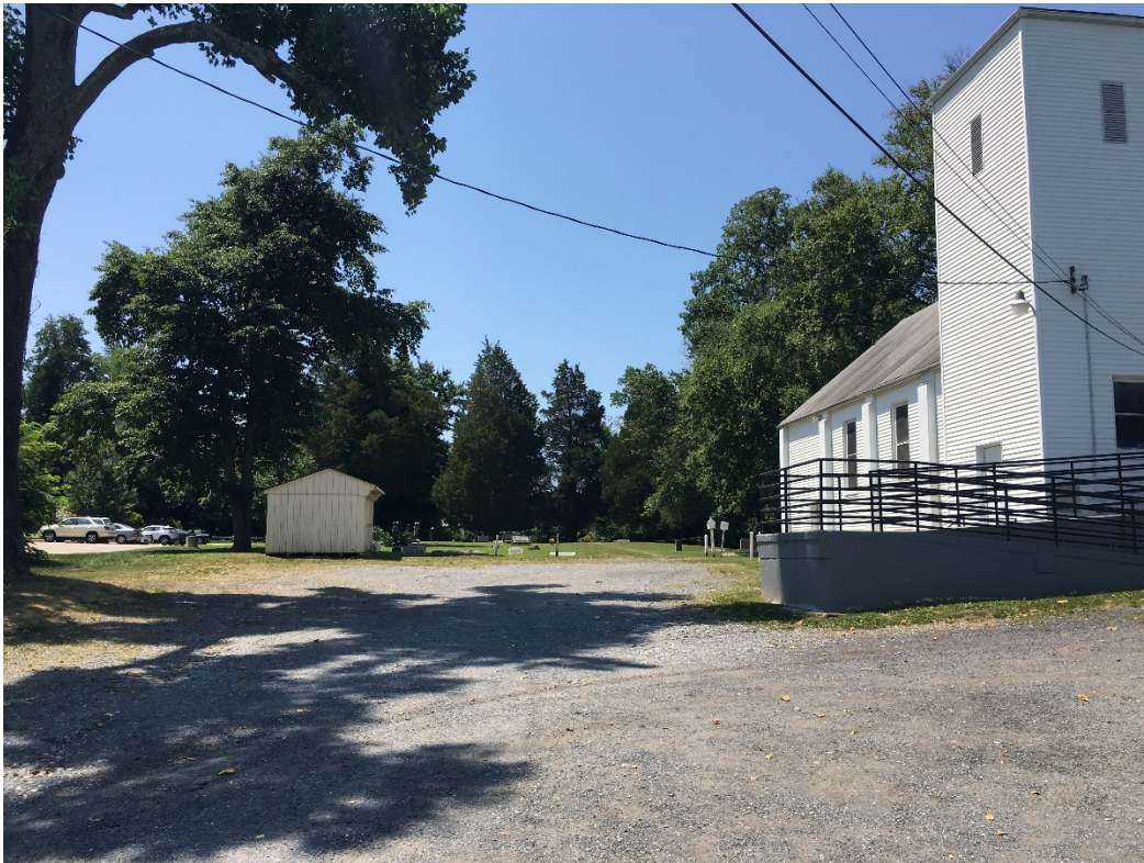
2. Approach to cemetery, facing southeast