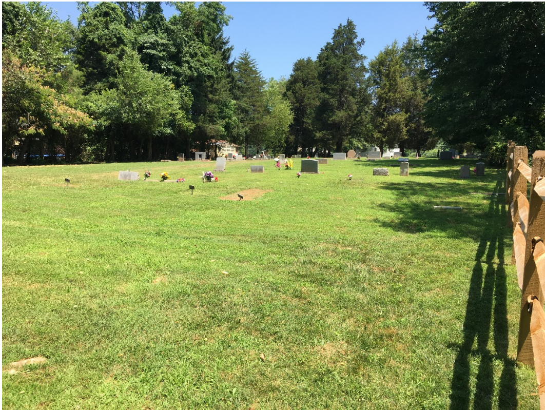
6. South side of cemetery along property line, facing north