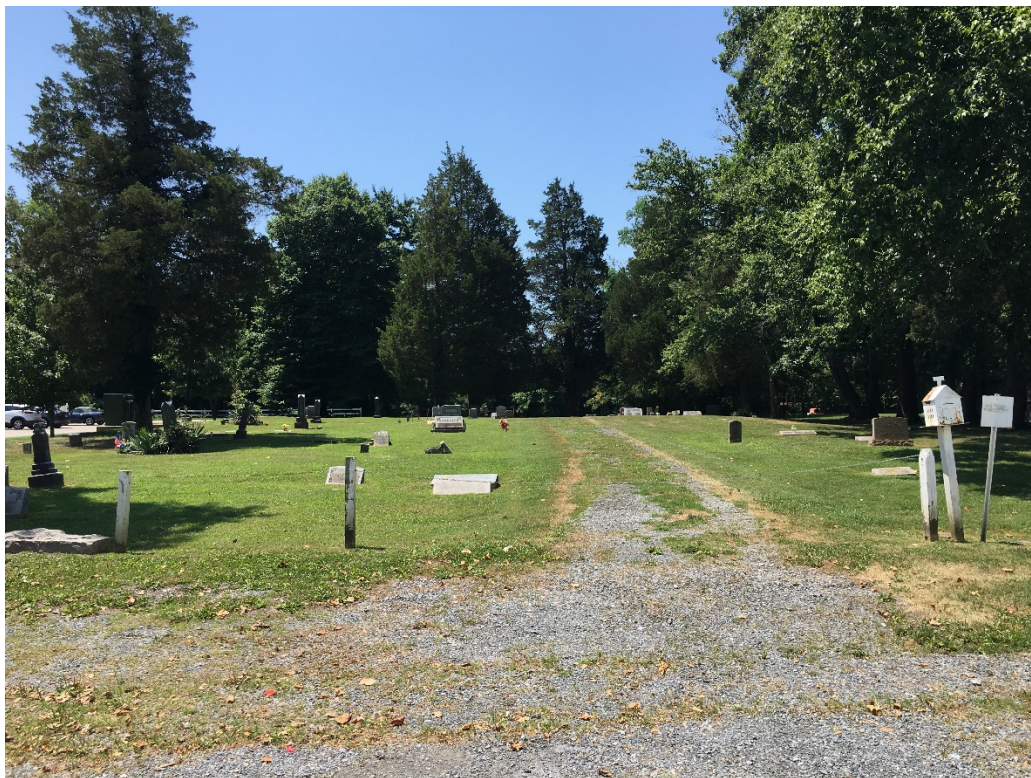
3. View to center of cemetery, facing southeast