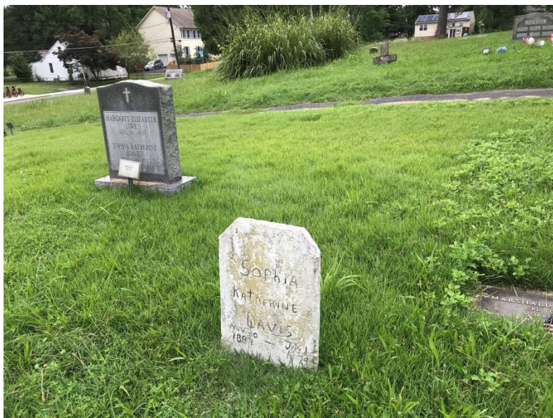
6. Handmade grave marker and commercially made grave marker