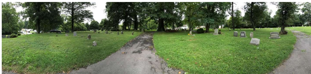
4. Panorama from east to south to west