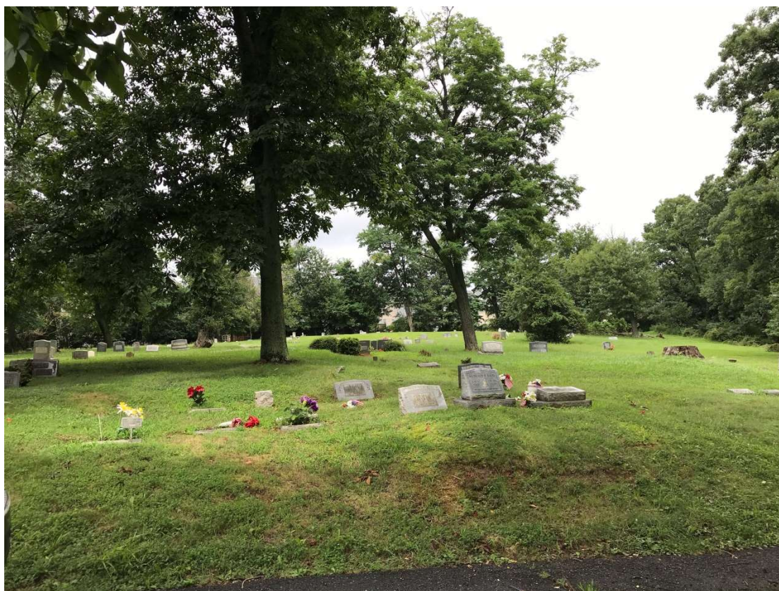
2. Center of cemetery from access road, facing west