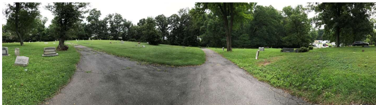
3. Panorama from west to north to east