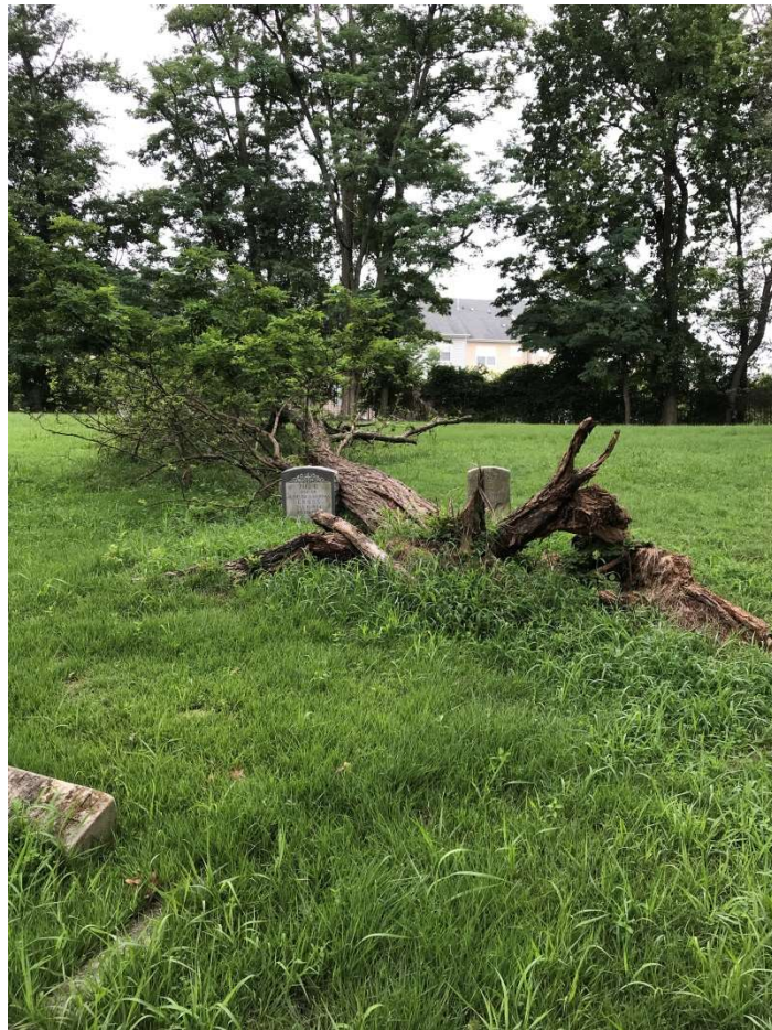
5. Fallen tree between graves