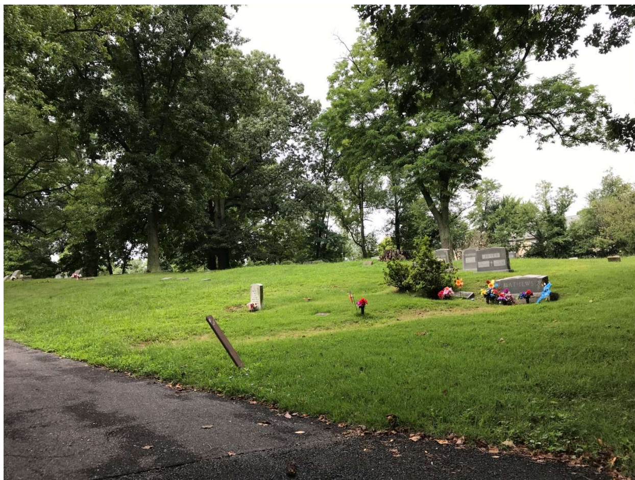
1. Approach to cemetery from North Horners Lane, facing south