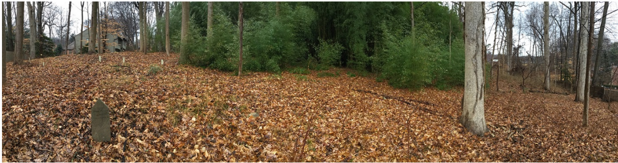
5. Panoramic 1 – west to north to east