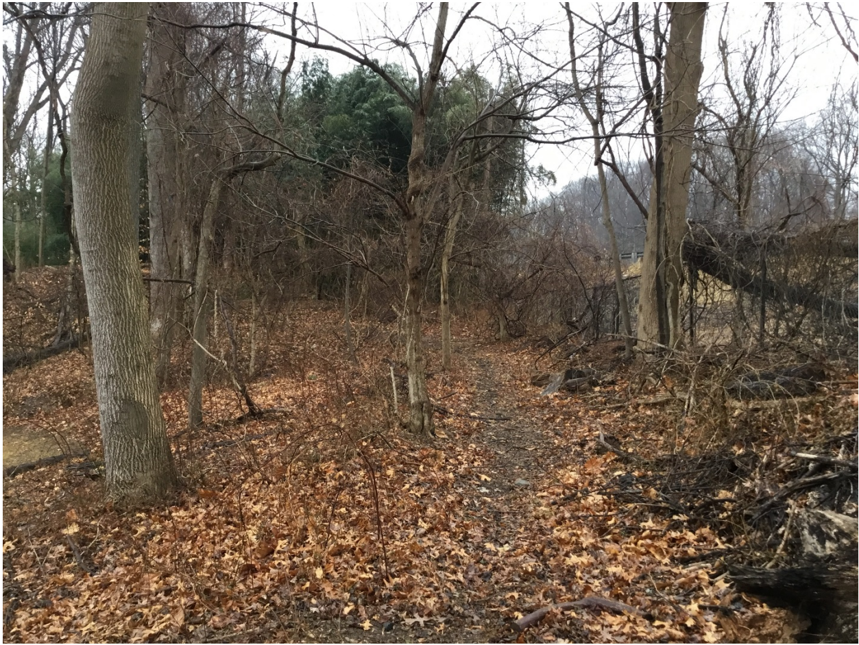
2. Right-of-way, facing west