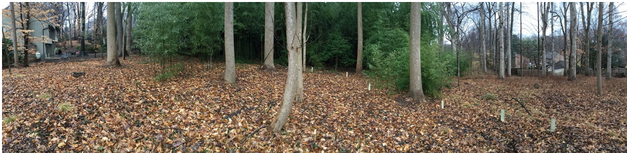
7. Panoramic 2 – west to north to east