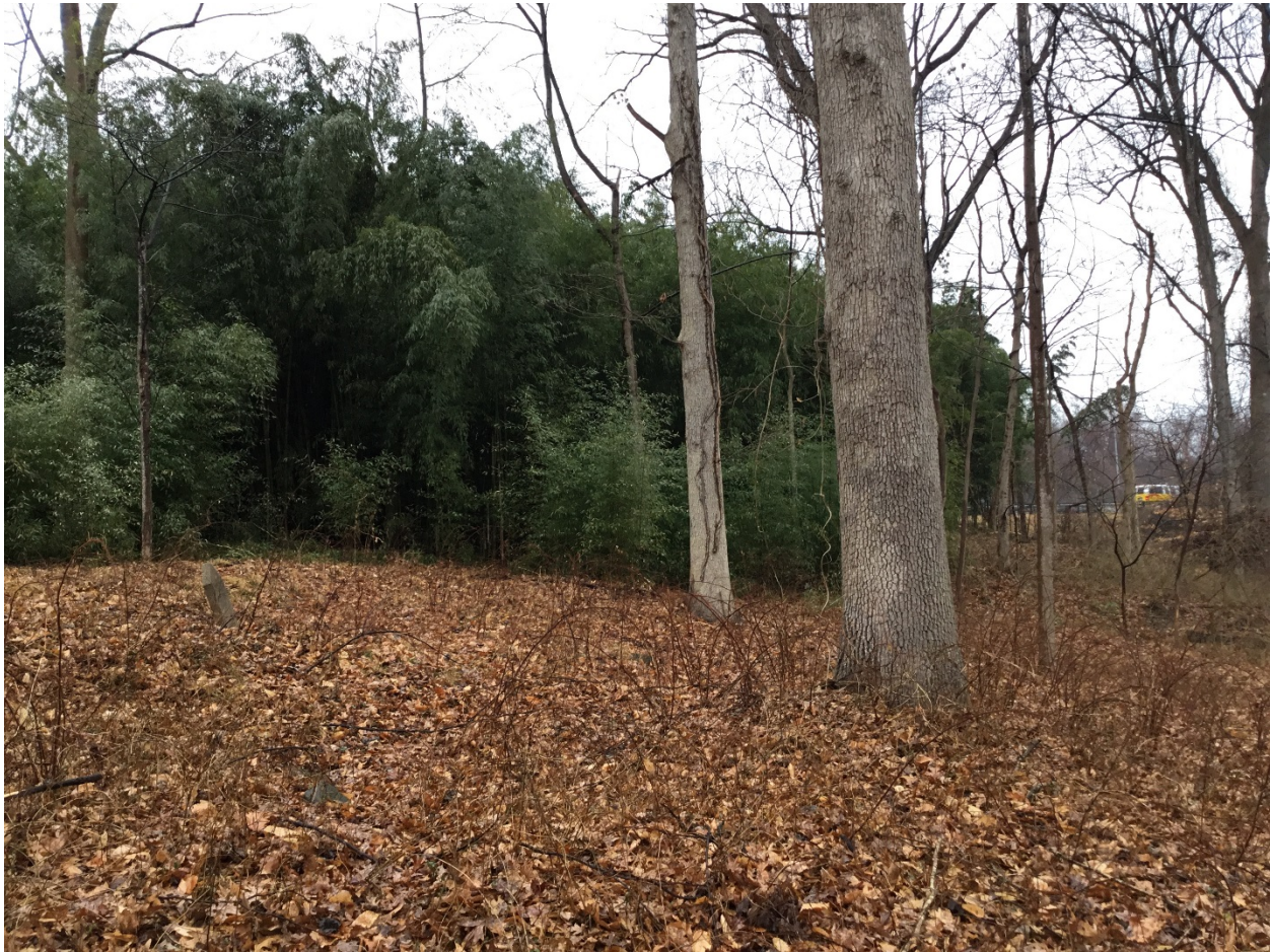
10. Bamboo overgrowth where Moses Hall formerly stood, facing north