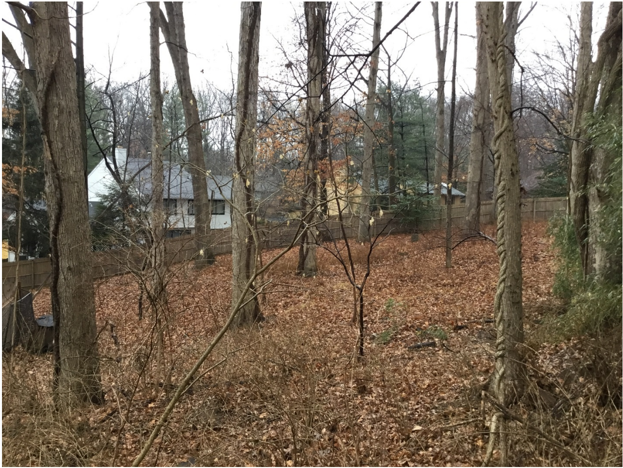
3. View to center of cemetery, facing south-west