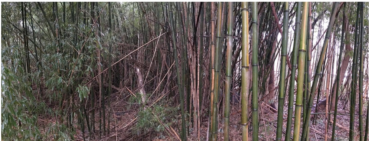
11. Bamboo overgrowth where Moses Hall formerly stood, facing west