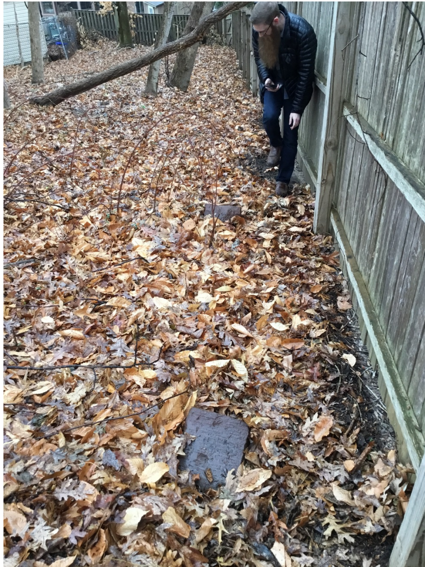
9. Southern edge along residential fence