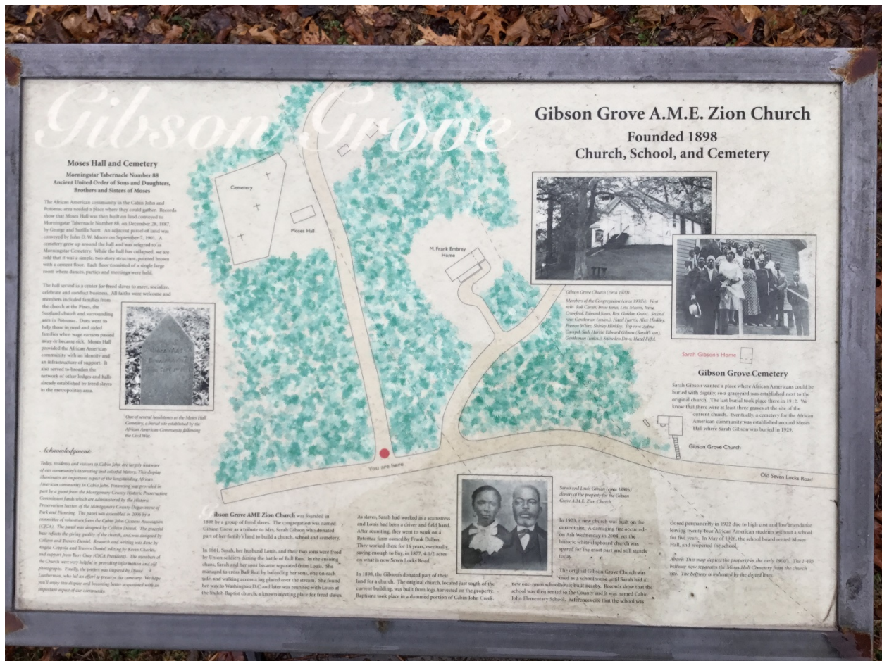
1. Interpretive sign at right-of-way pull-off from Seven Locks Road