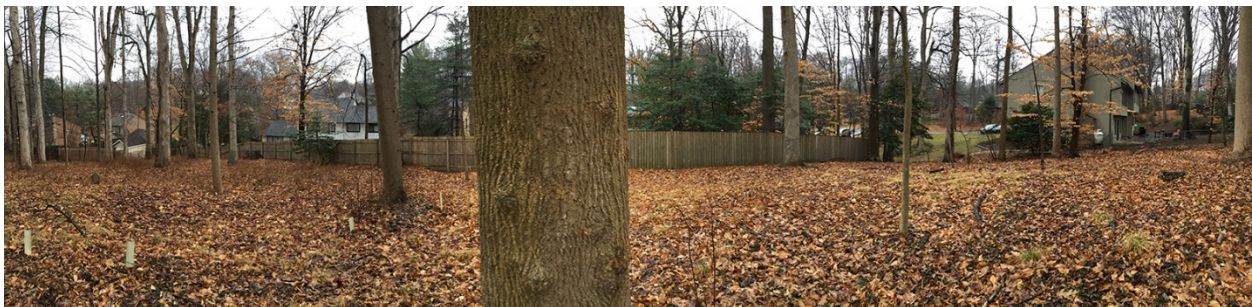
8. Panoramic 2 – east to south to west