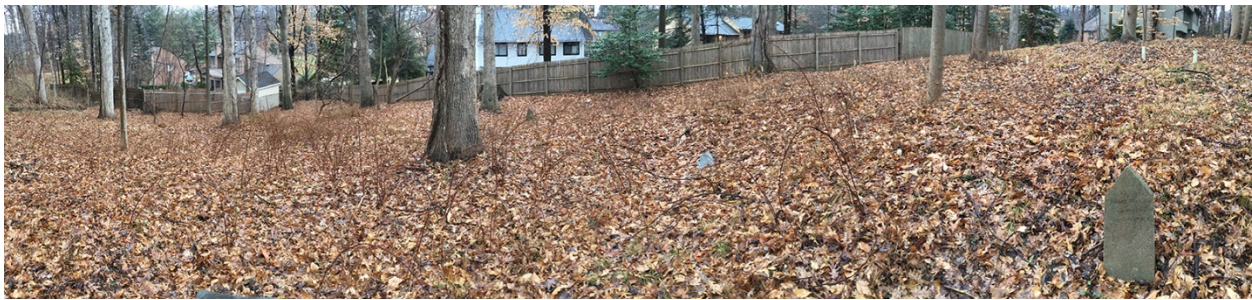
6. Panoramic 1 – east to south to west