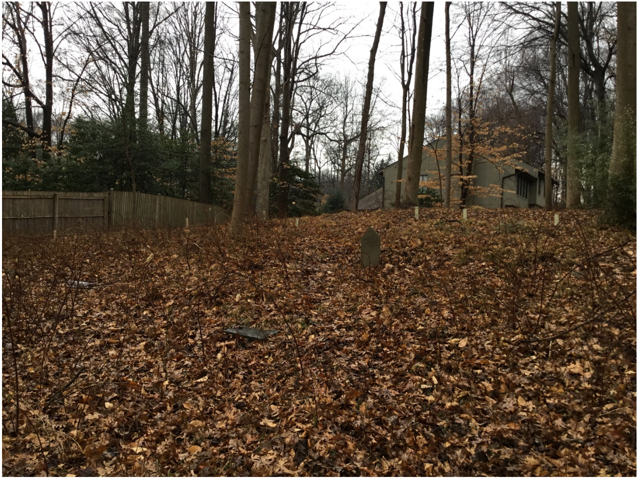
4. View to center of cemetery, facing west