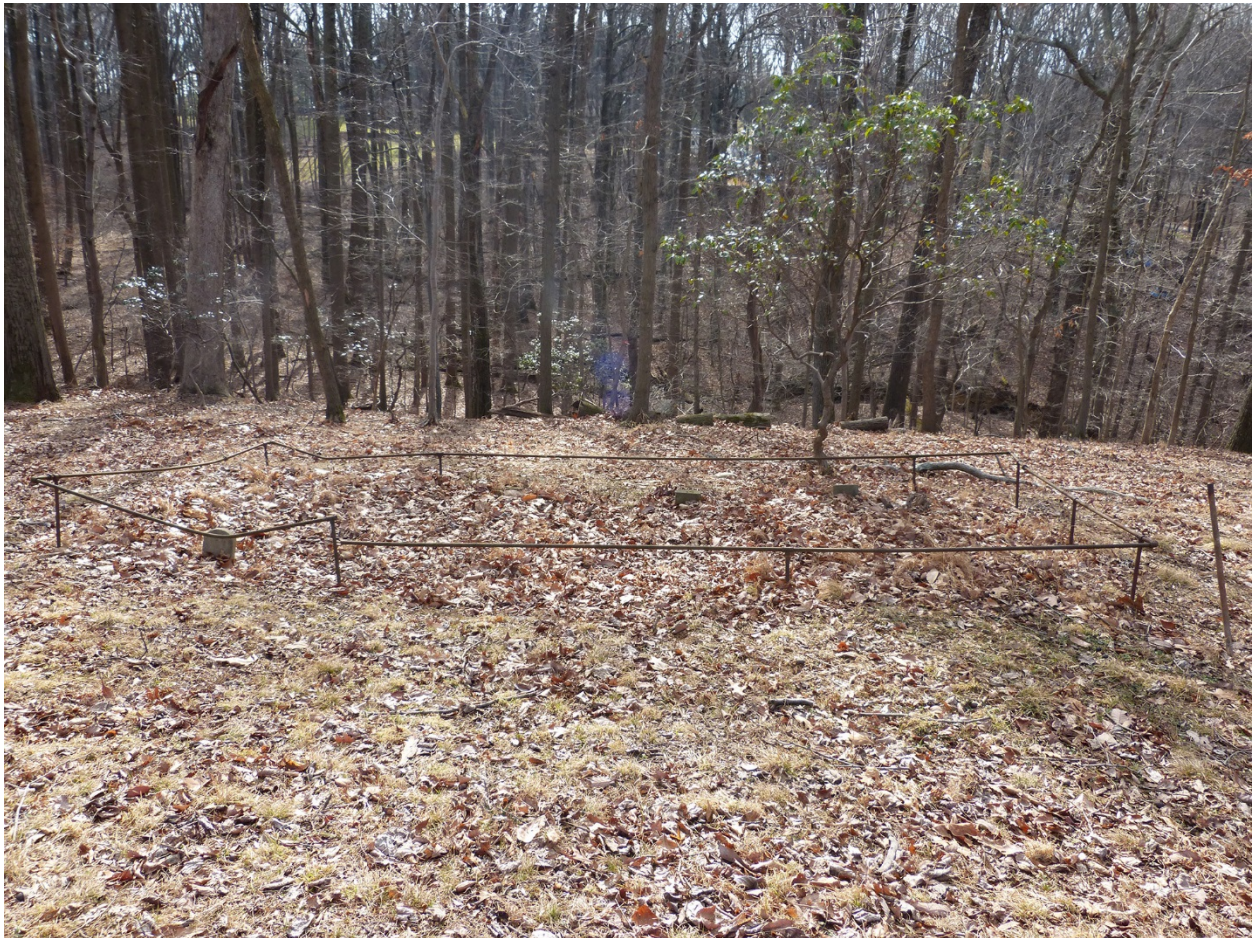
5. Metal pipe fence surrounding burial plot