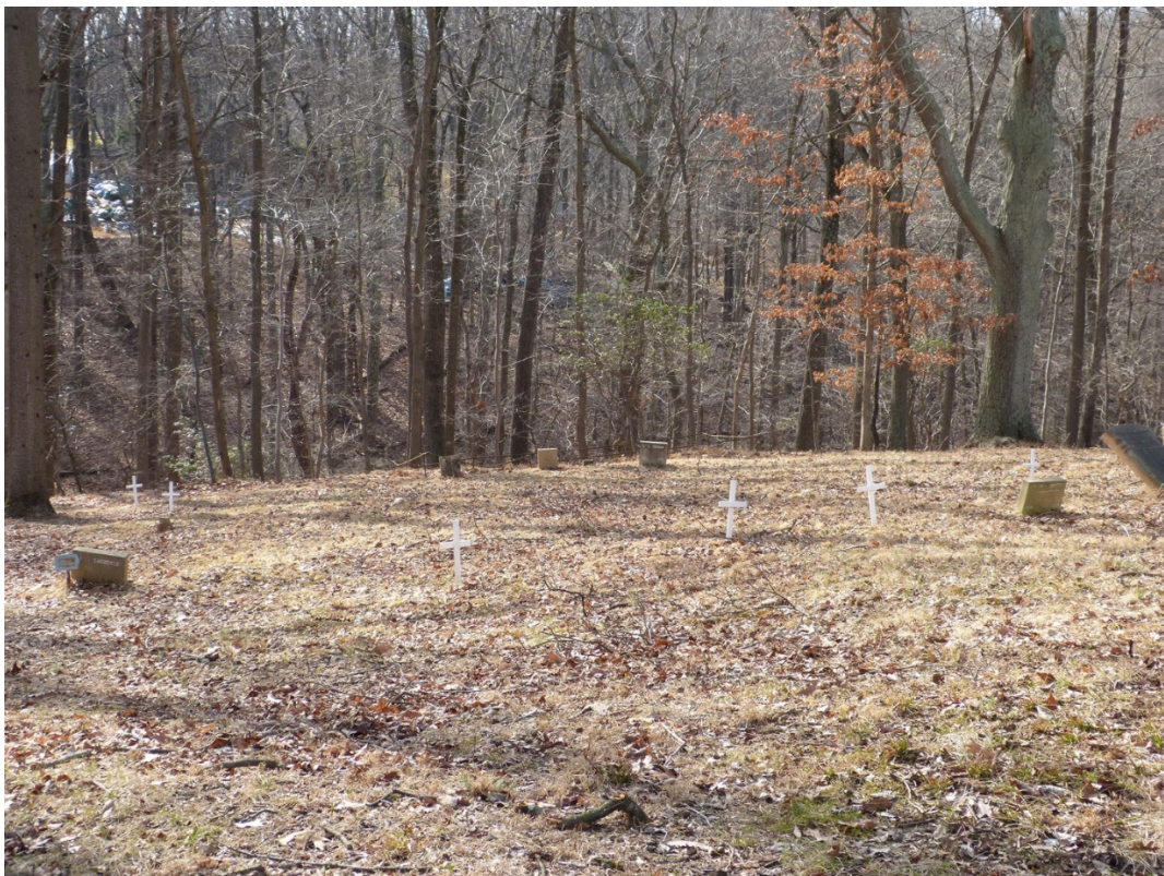
2. Center of cemetery from the parking lot, facing east