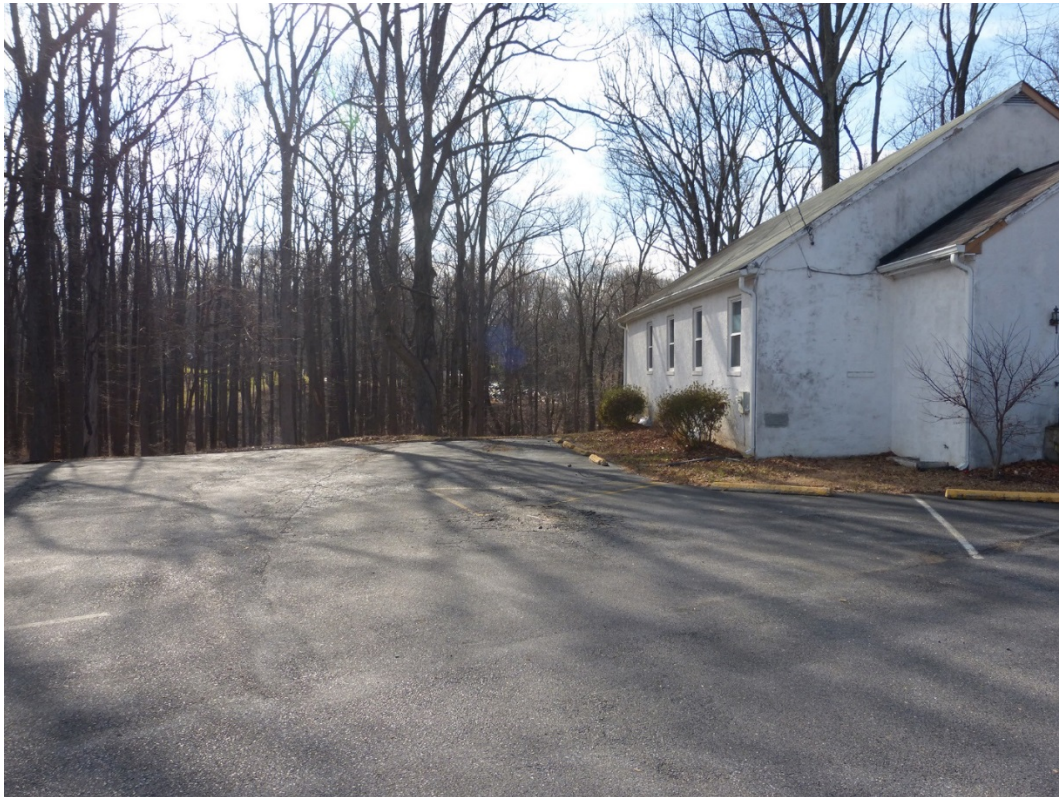
1. Cemetery entrance to the left of the church, facing east