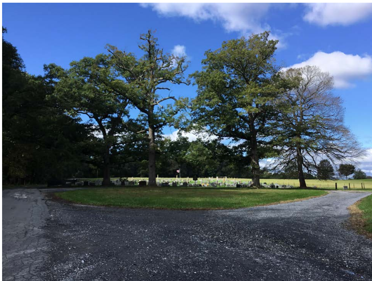
1. Approach to cemetery, facing west