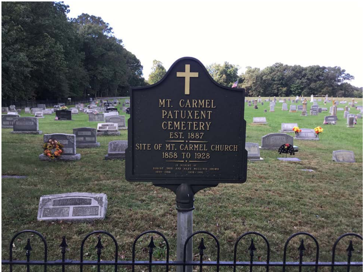
2. Cemetery sign at entrance gate, facing west