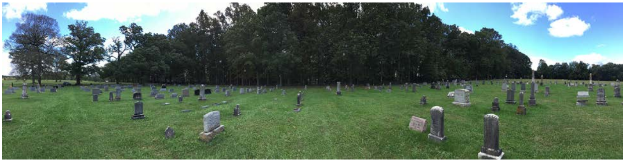
5. Panoramic from east to south to west