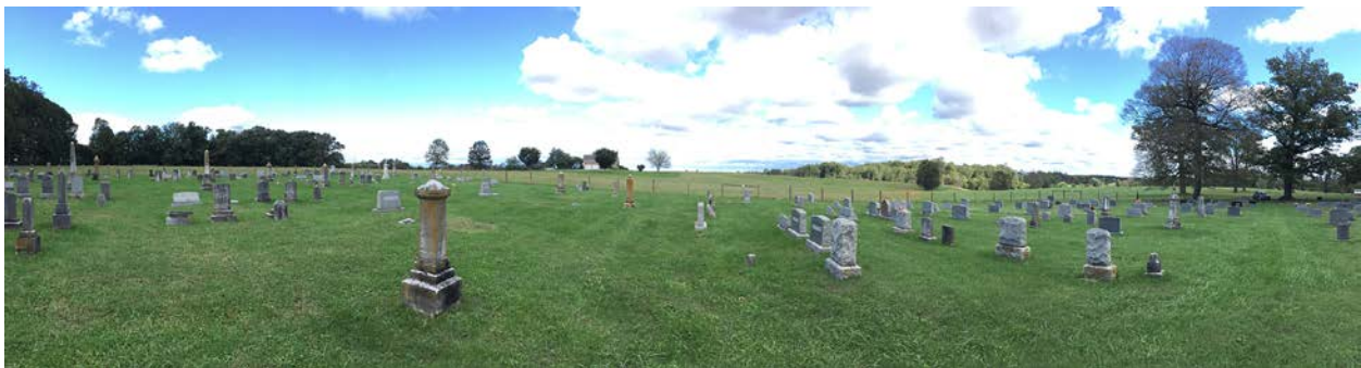
3. Panoramic from entrance gate, facing west