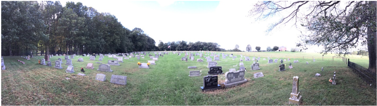
4. Panoramic from west to north to east