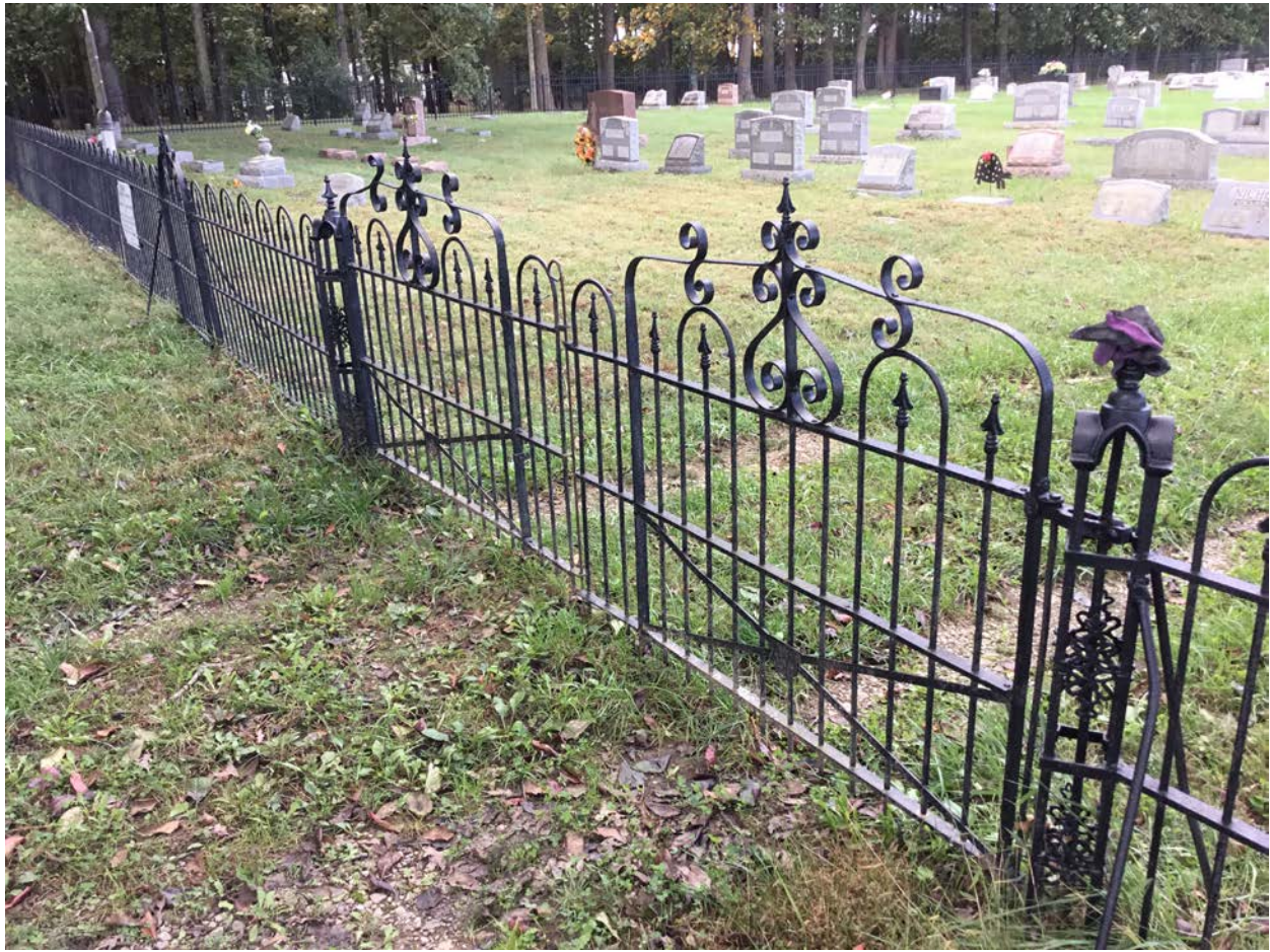
6. Wrought iron fence and gate at entrance