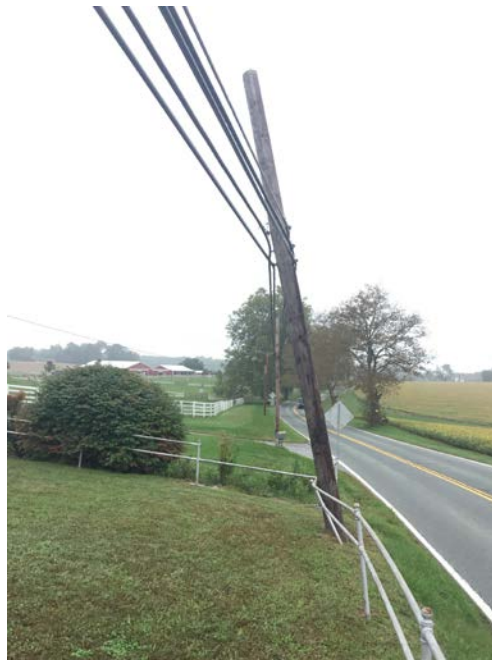
6. Leaning utility pole bending the fence, facing east