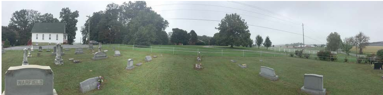
4. Panoramic from west to north to east