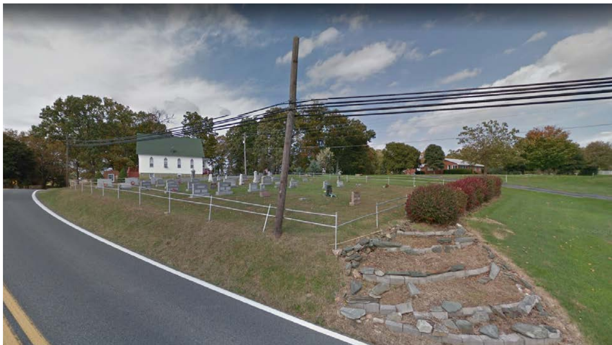
1. Approach to cemetery from Damascus Road, facing west