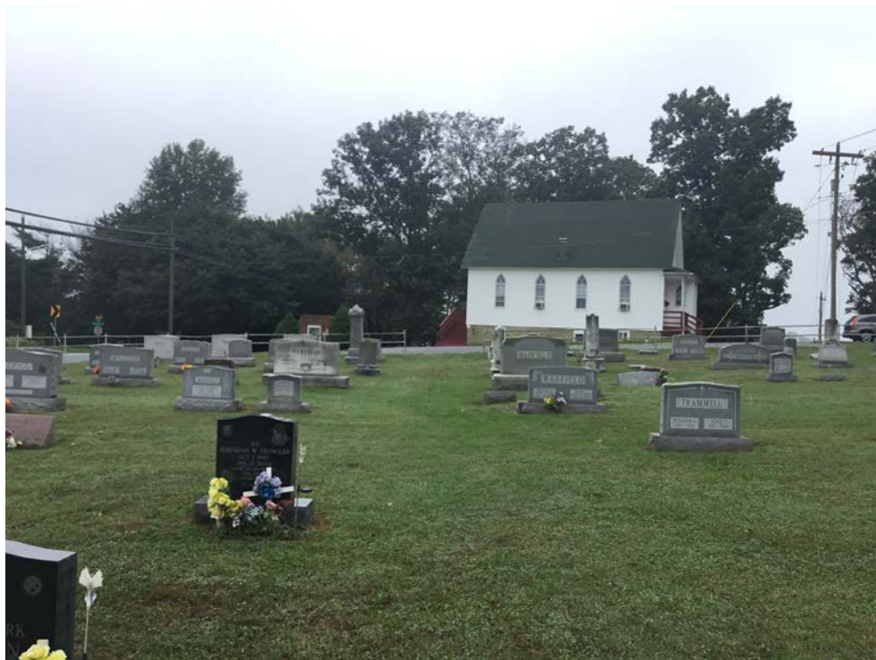
8. Grass lane down the center of the cemetery, facing west