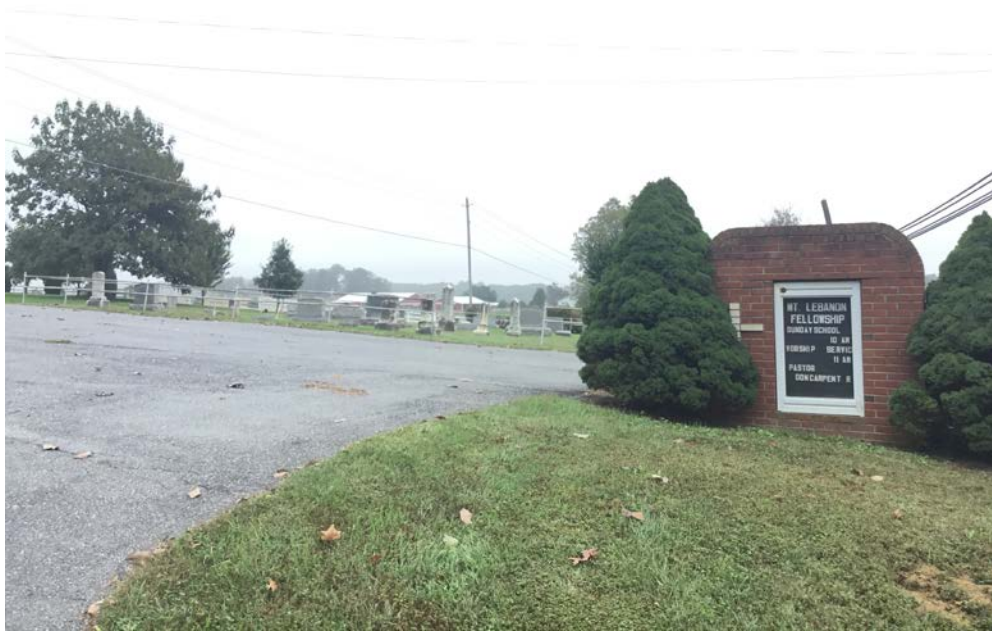
2. Entrance from Damascus Rd, facing east