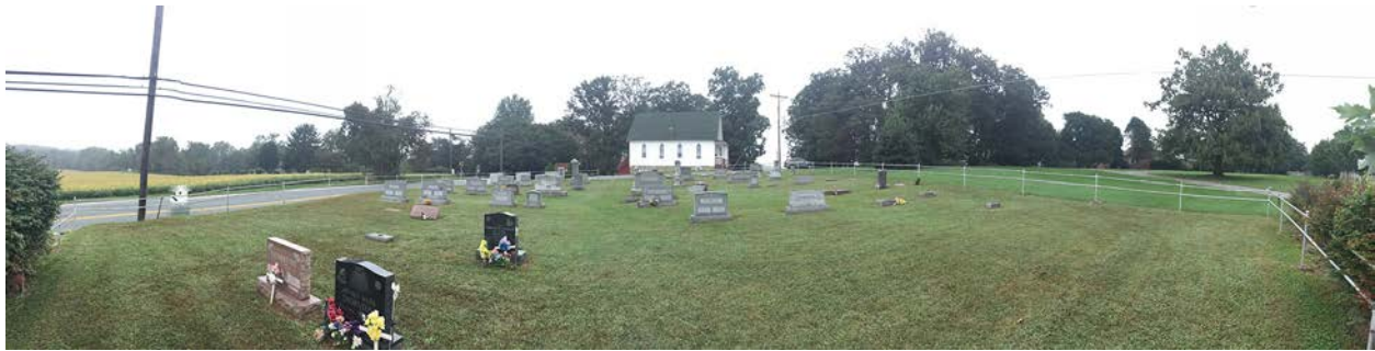
9. Panoramic from south to west to north