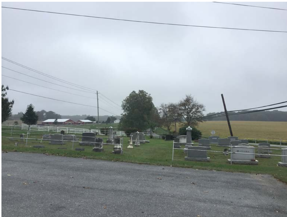
3. Approach to cemetery, facing east