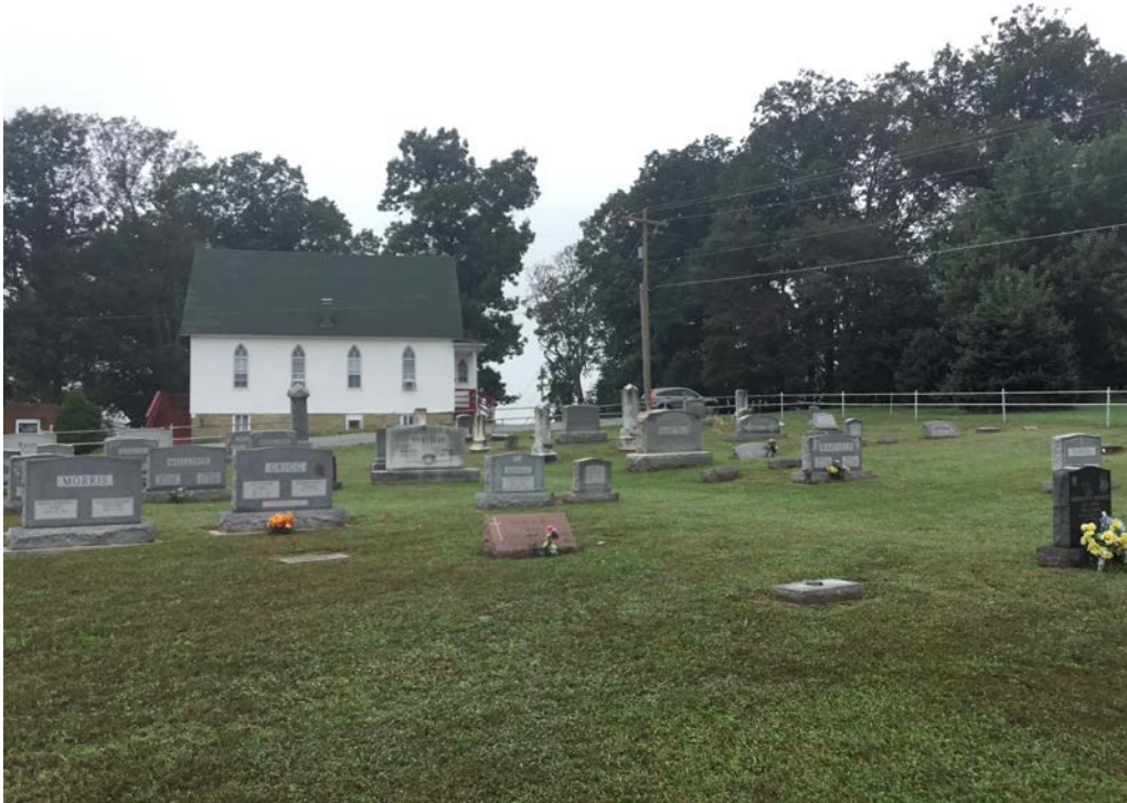
7. View from bottom of cemetery up to church, facing west