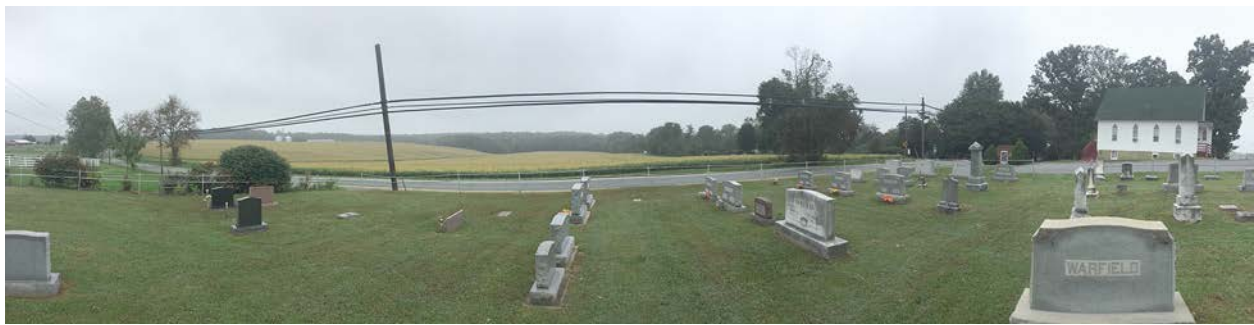
5. Panoramic from east to south to west