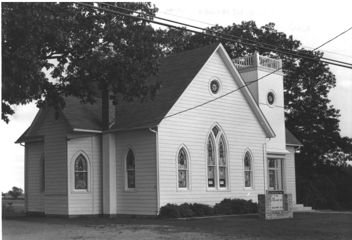
Front façade, at right Photo: Michael Dwyer, 1974