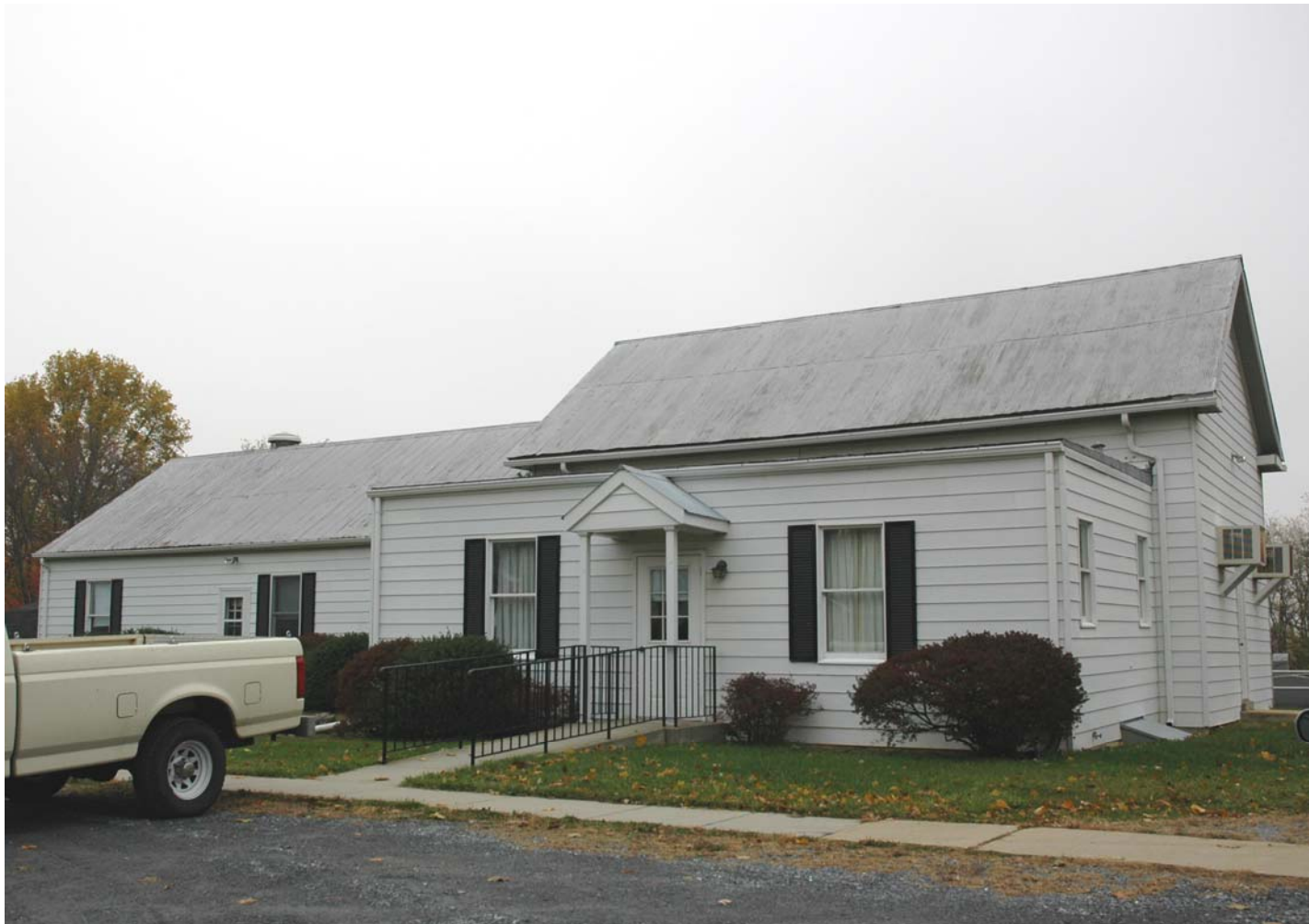
Original church building (1881), gable roof structure at right, 11-2007