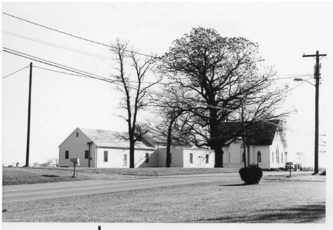
1973 view showing kitchen addition at left of 1881 church, and foyer-bathroom addition in center of image.