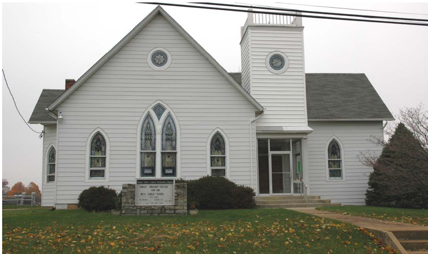
Mt Tabor ME Church 11-2007