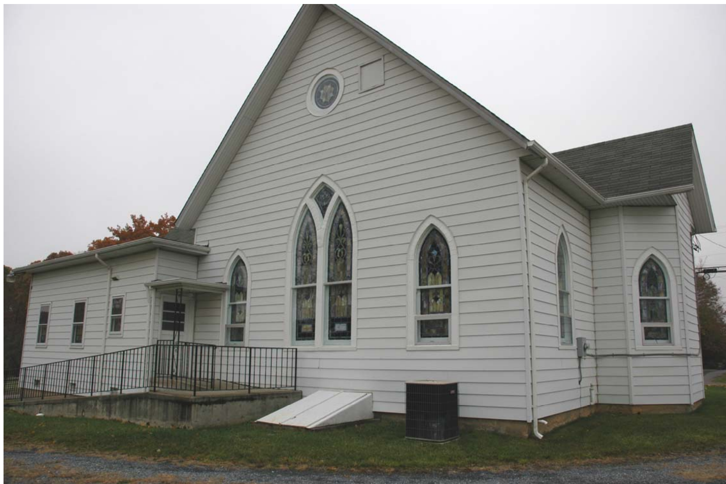
Mt Tabor ME Church Rear façade, at left, 11-2007