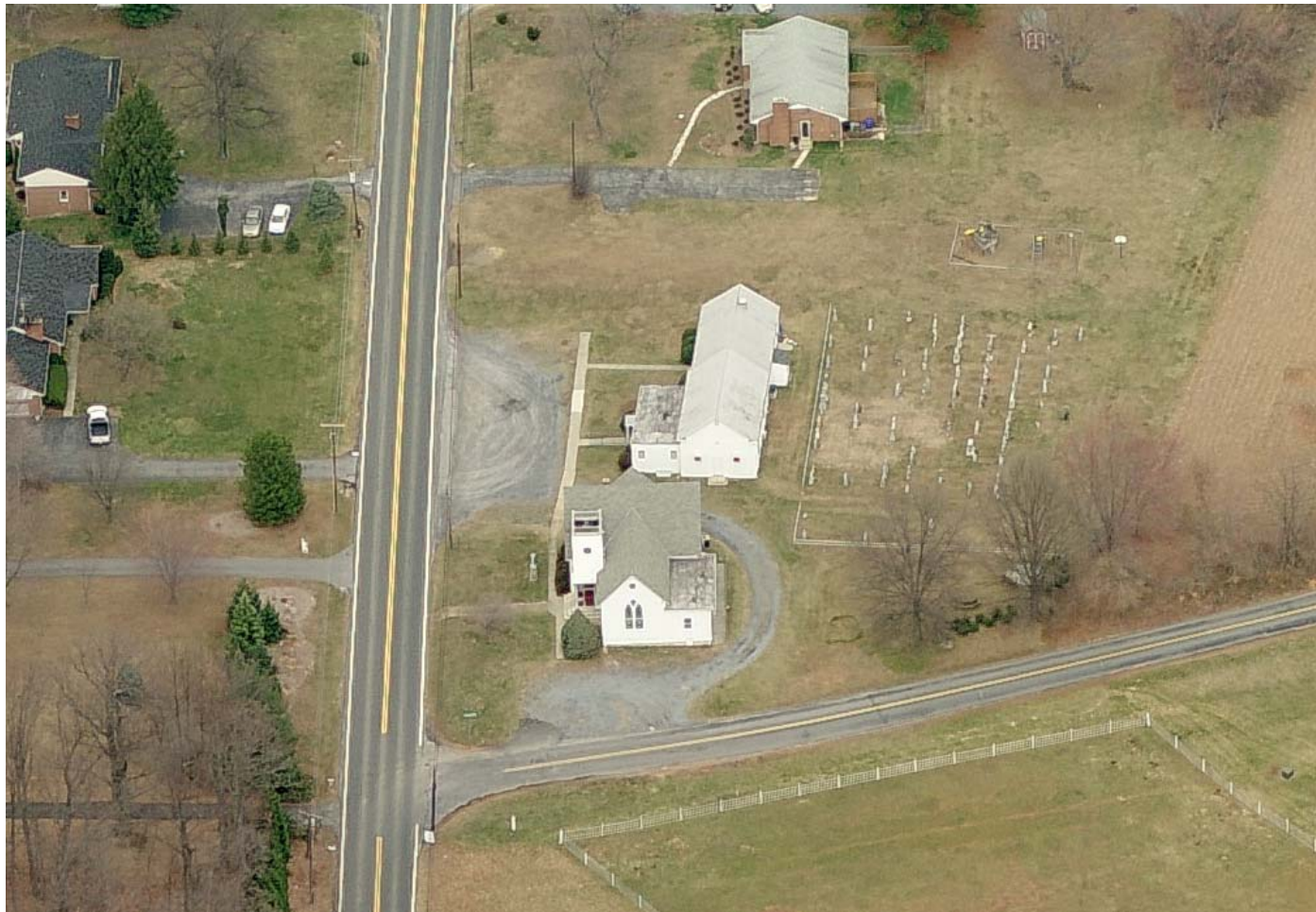
Aerial view north, Pictometry, 2008