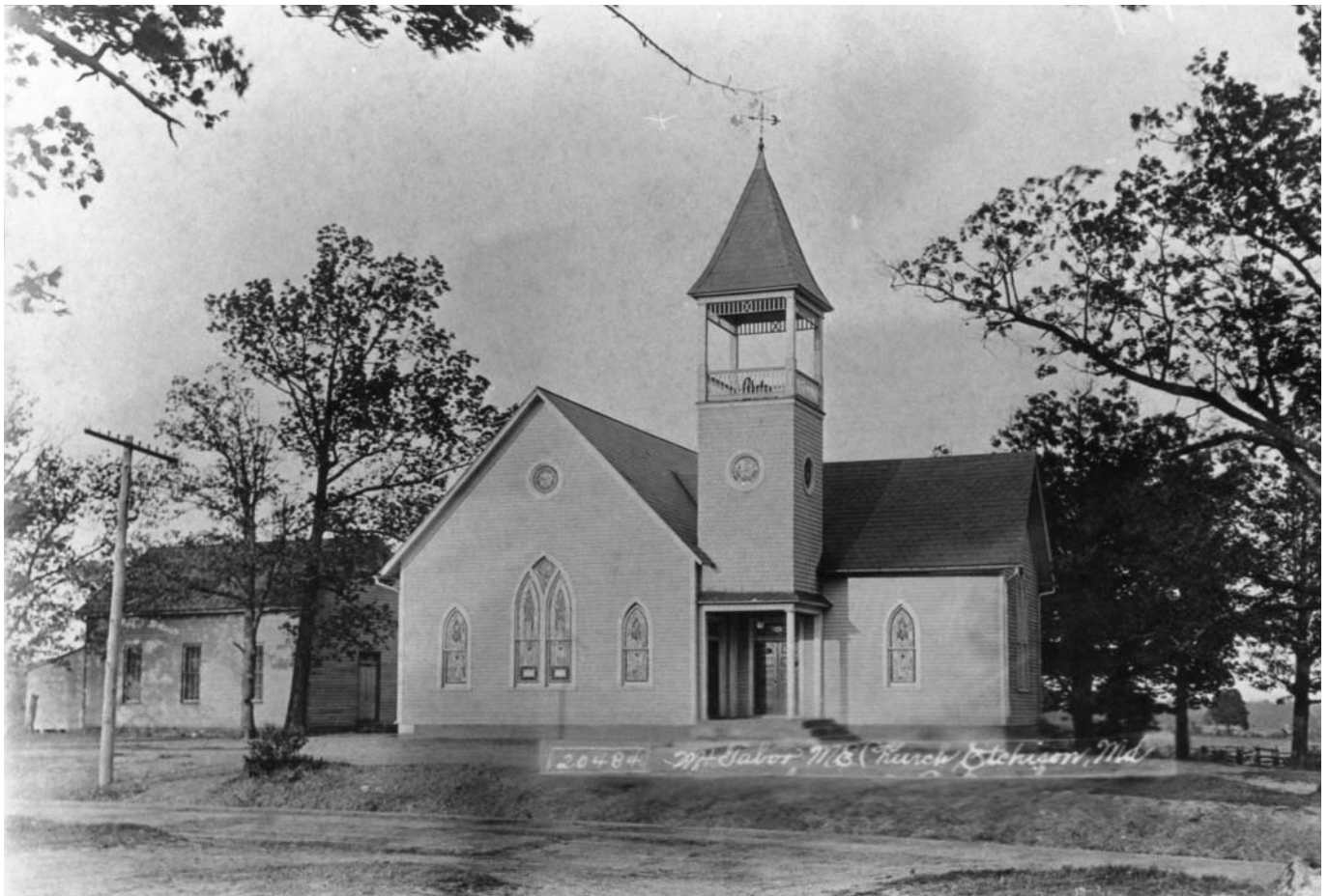
Mt Tabor ME Church: 1914 church right, with original 1881 church at left. Note, by this time, c1914, a rear shed roof addition had been built on the rear of the 1881 church.