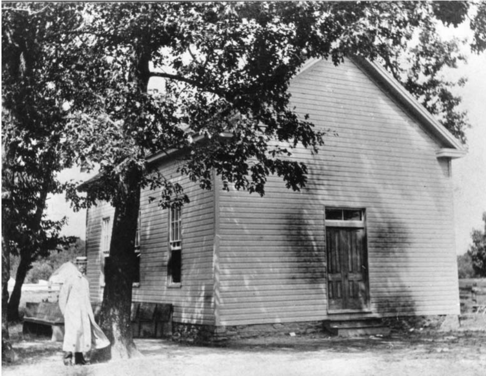
Mt Tabor ME Church, first building (1881). The building faced south to Hipsley Mill Road. View from c1910-1915