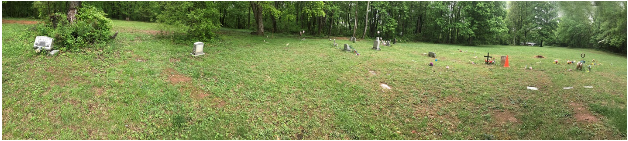
2. Panoramic from west to south to east