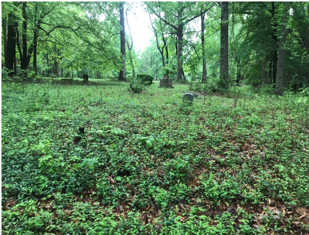
1. Approach to cemetery, facing west