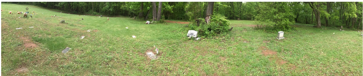
3. Panoramic from east to north to west