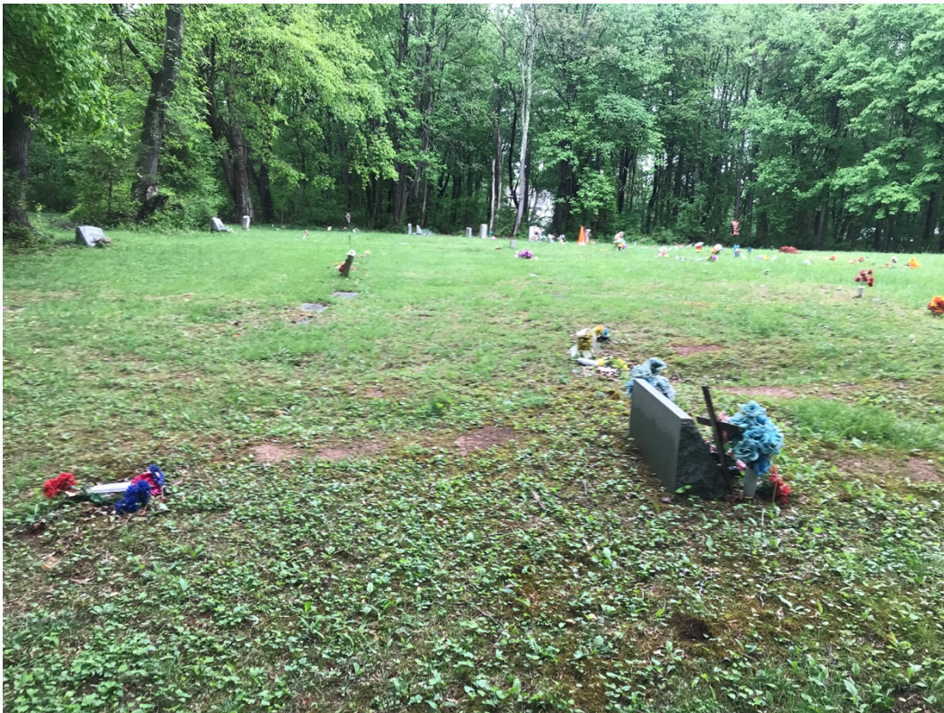
4. View from perimeter toward cemetery center