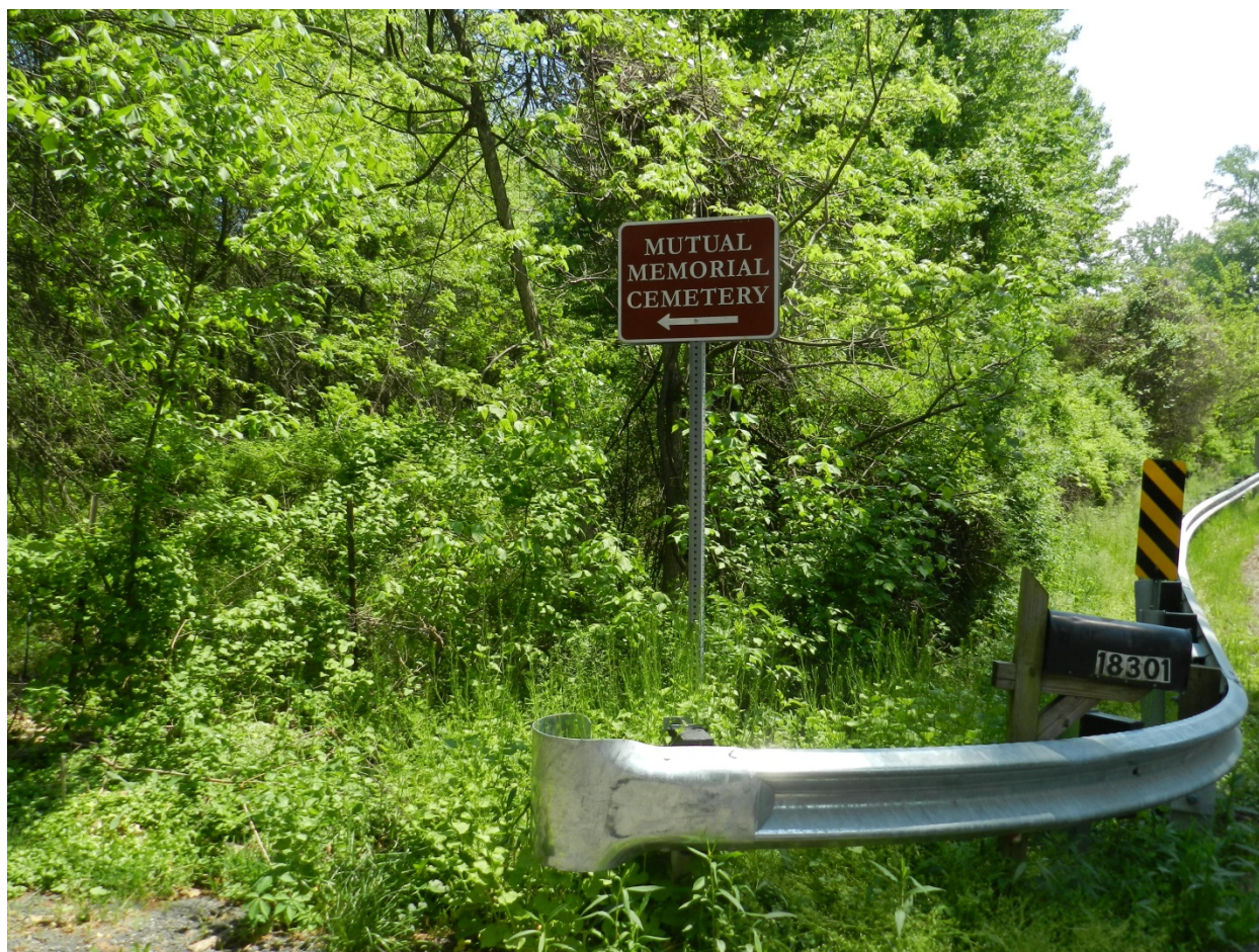
1. Cemetery sign on Brooke Rd, facing south