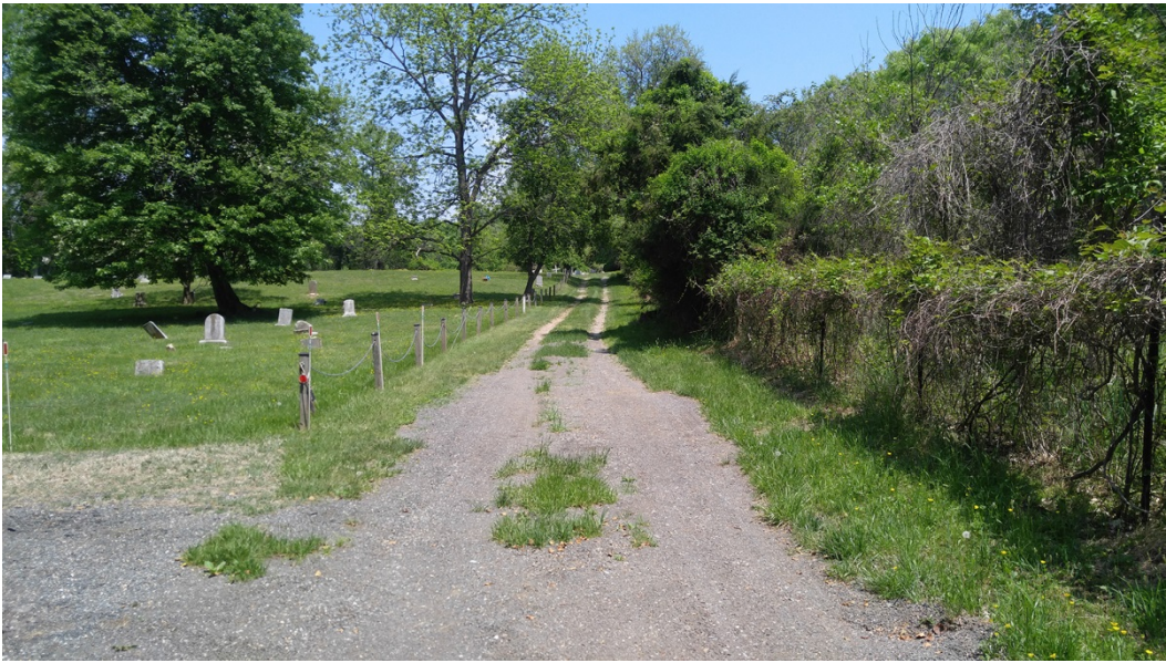
4. Initial view to cemetery along access lane, facing northeast