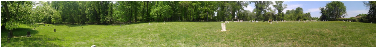
5. Panoramic from west to north to east