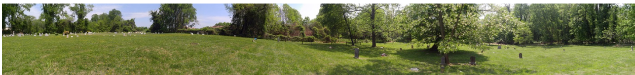
6. Panoramic from east to south to west