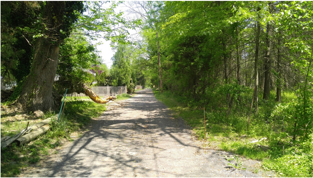
2. Access lane from Brooke Rd, facing northeast