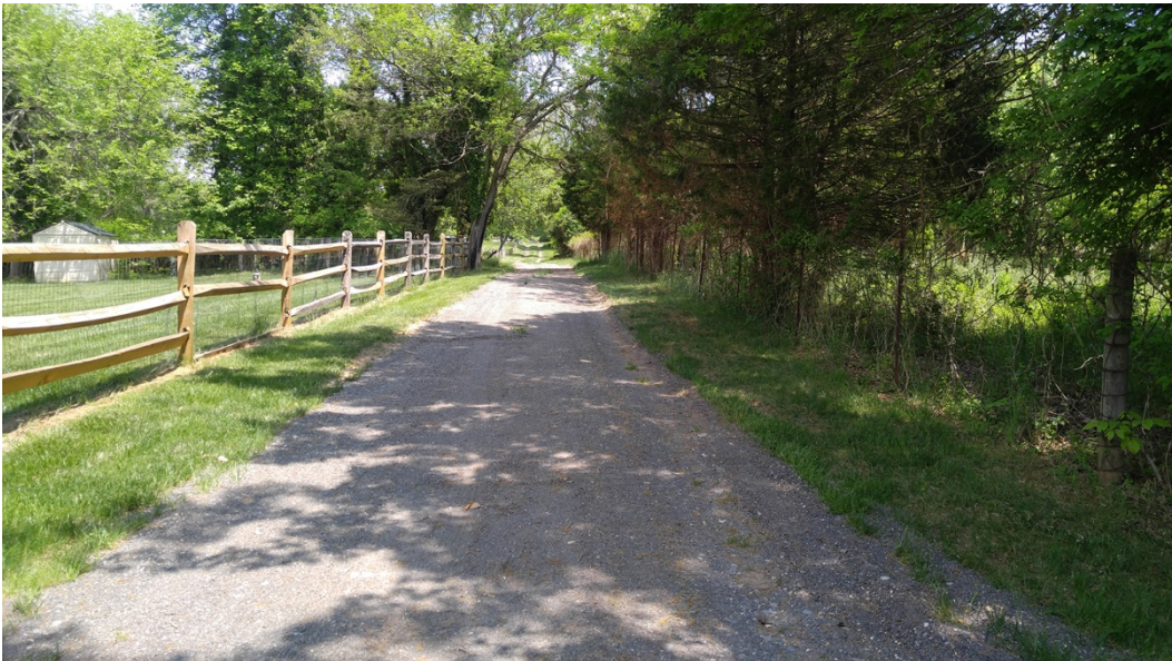
3. Access lane continues toward cemetery, facing northeast