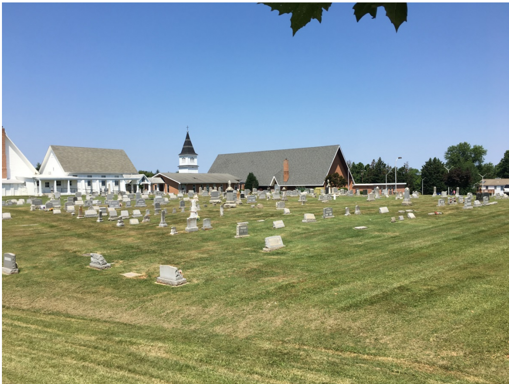
4. View of cemetery from eastern property line, facing northwest