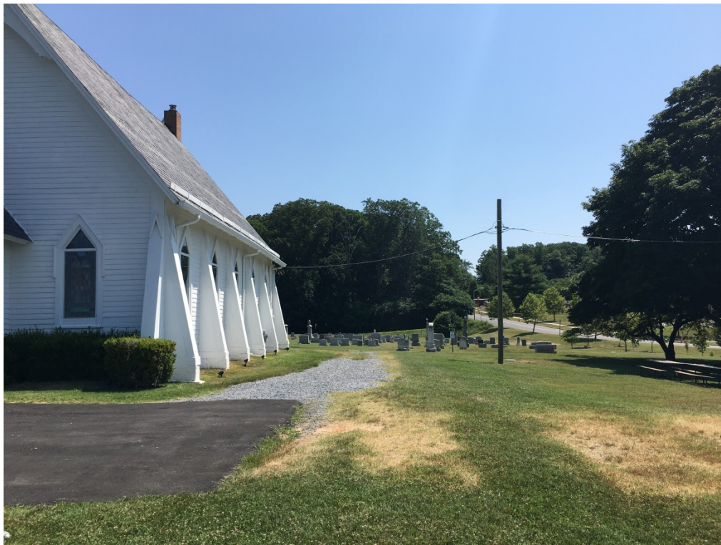
2. Continued access onto gravel driveway to cemetery, facing east