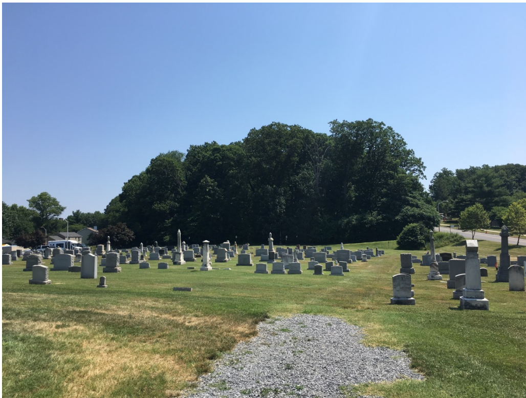
3. Initial view to cemetery, facing east