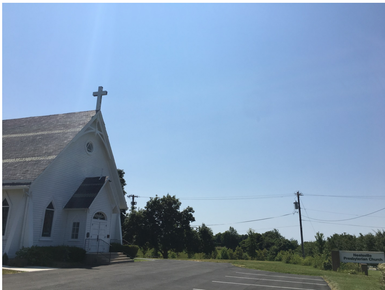
1. Access parking lot to cemetery behind historic church building, facing south