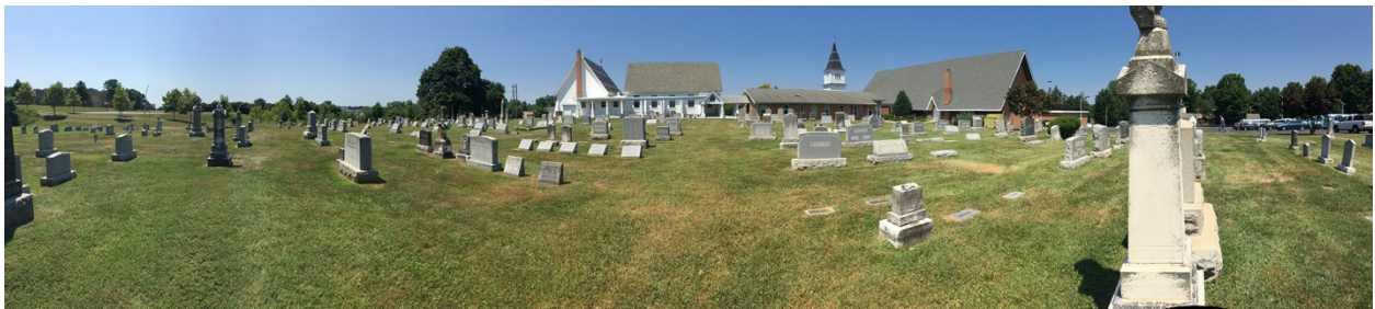
7. Panoramic from east to south to west