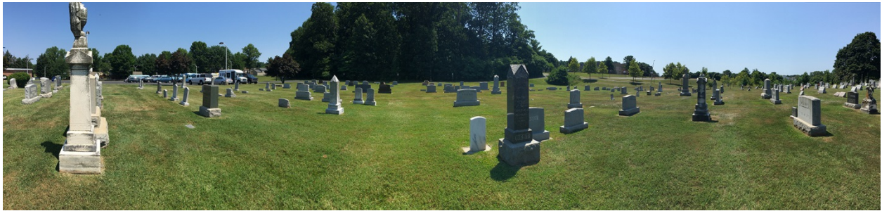
6. Panoramic from west to north to east