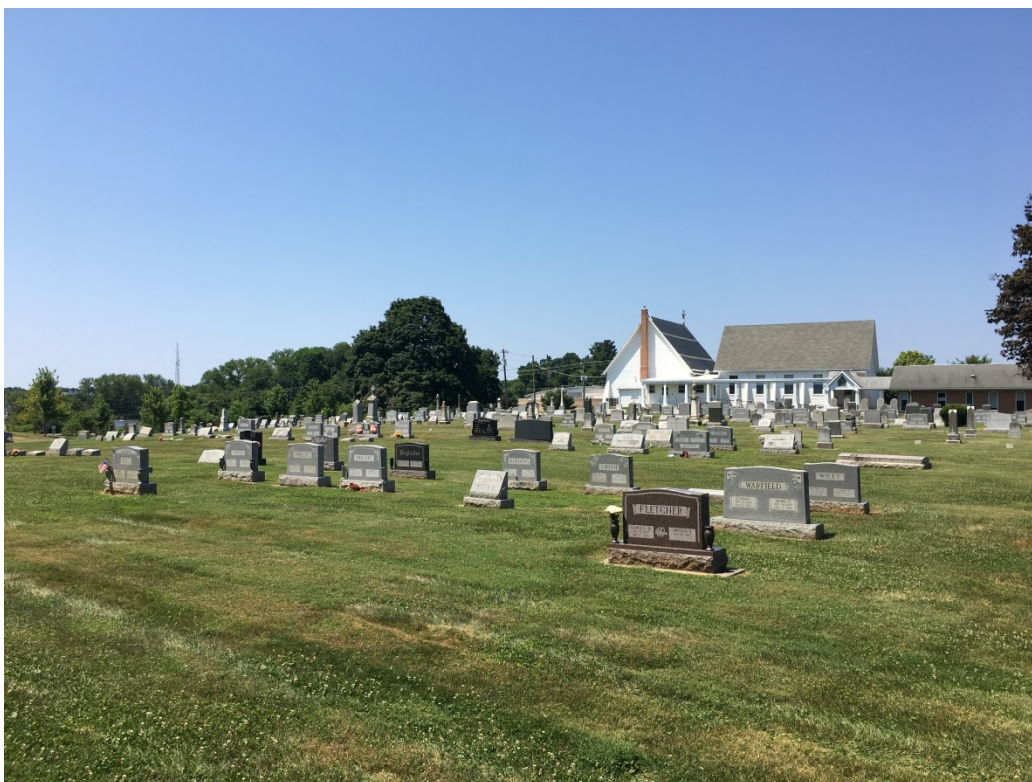
5. View of cemetery from eastern property line, facing southwest