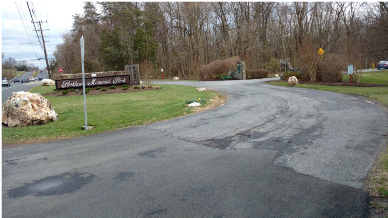
1. Entrance to cemetery off Veirs Mill Road, facing southwest