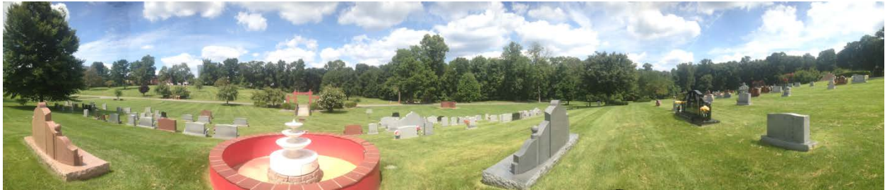
3. Panoramic from west to north to east