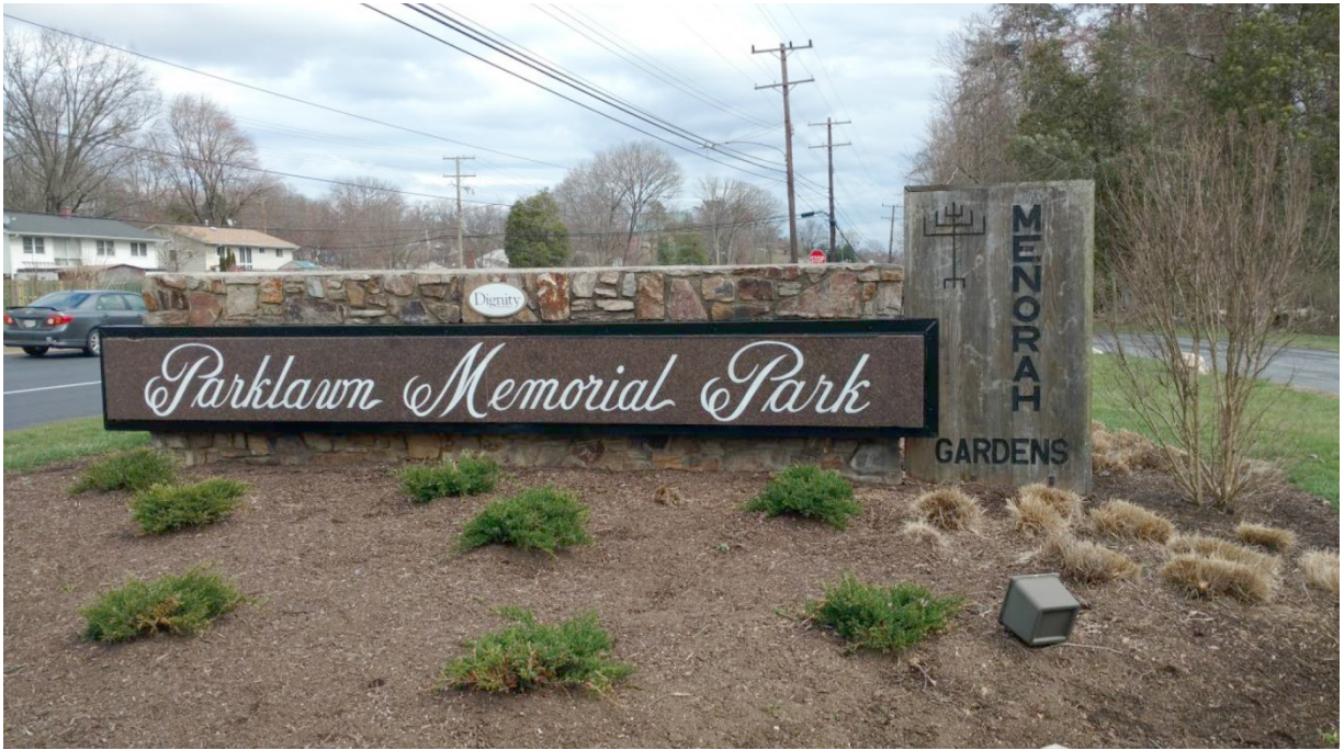
2. Cemetery sign along Veirs Mill Road