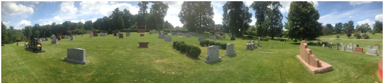
4. Panoramic from east to south to west