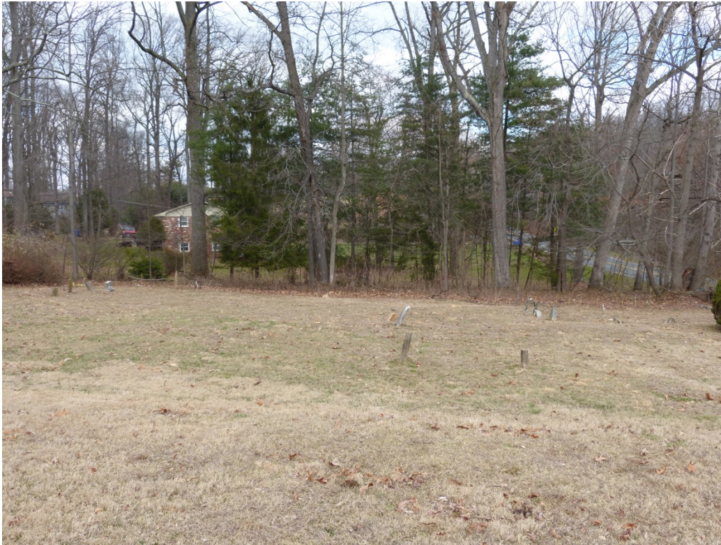
2. Center of cemetery from driveway, facing north