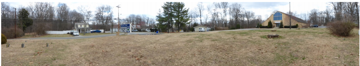
4. Panoramic from east to south to west