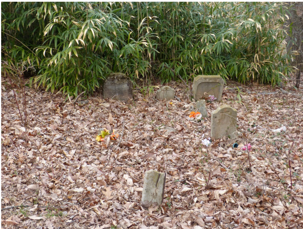
8. Bamboo encroachment on grave, facing west