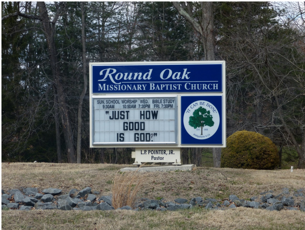
10. Church sign, facing north