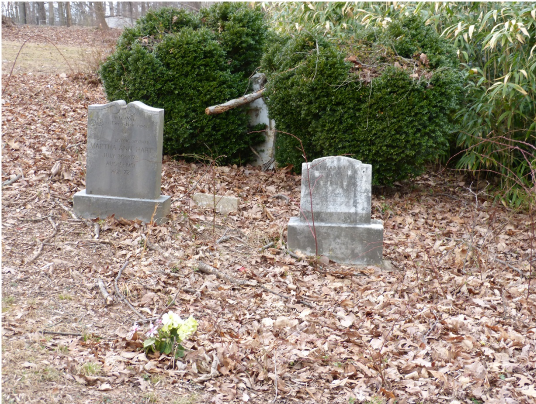
9. Boxwood bushes covering grave marker, facing west