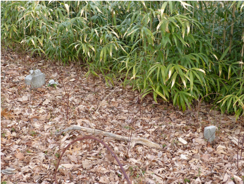
7. Bamboo encroachment on grave, facing north