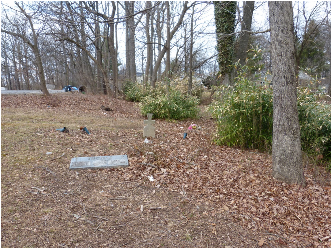
6. Bamboo encroachment and trash, facing west