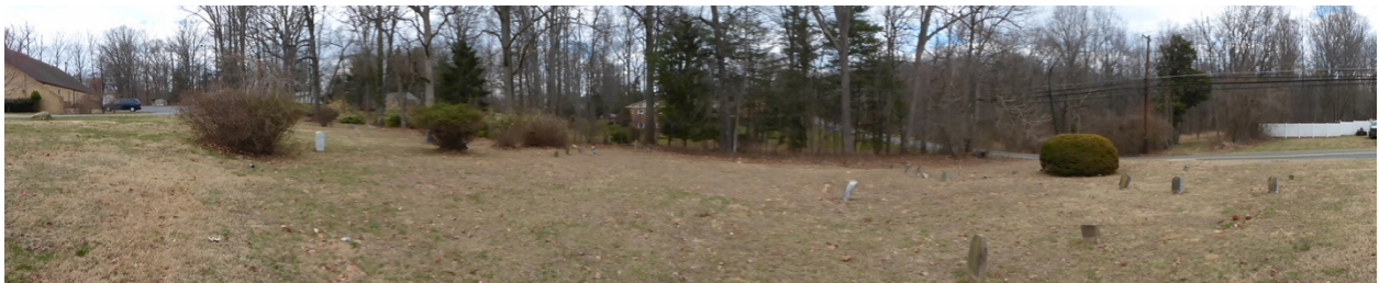
3. Panoramic from west to north to east