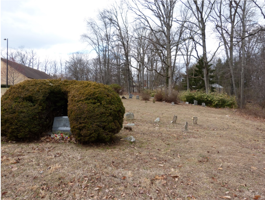
5. Center of cemetery from Good Hope Rd, facing west