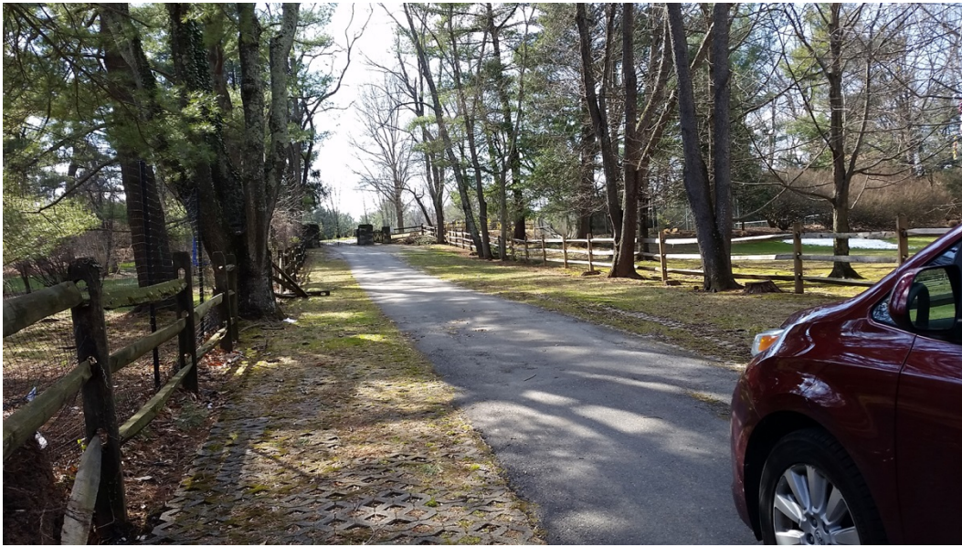
2. Main gate, facing west