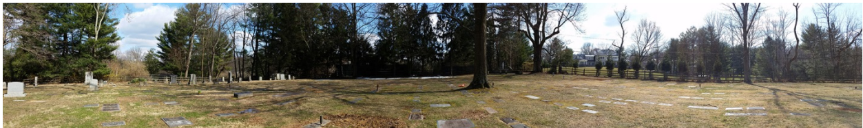
6. Panoramic from east to south to west