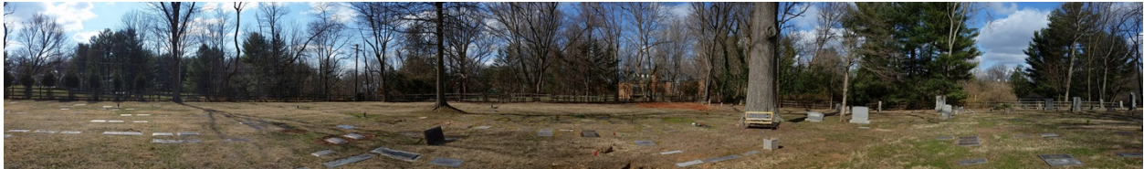
5. Panoramic from west to north to east