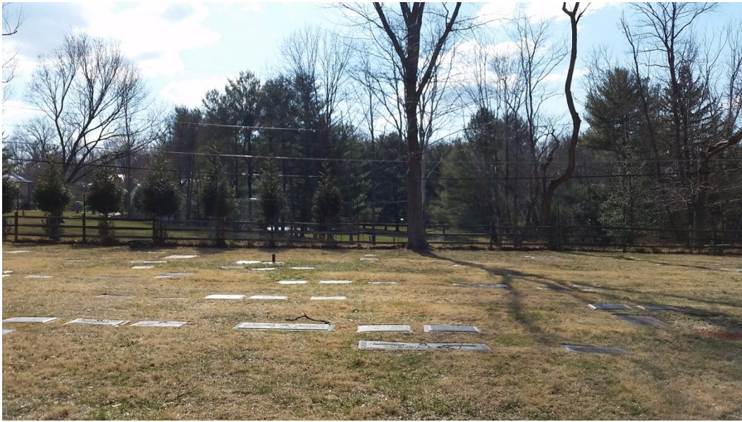
4. Center of cemetery, facing south-west