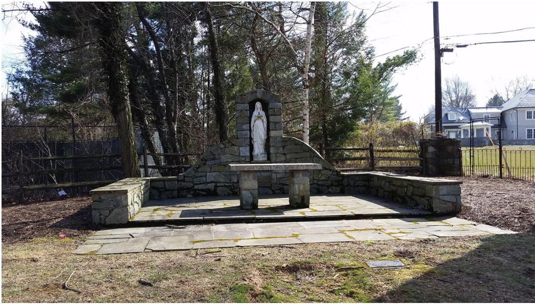
7. Shrine in southern corner, facing south