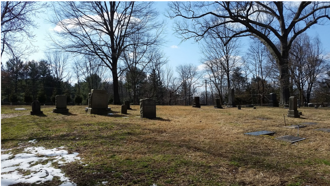
3. Center of cemetery, facing north-west