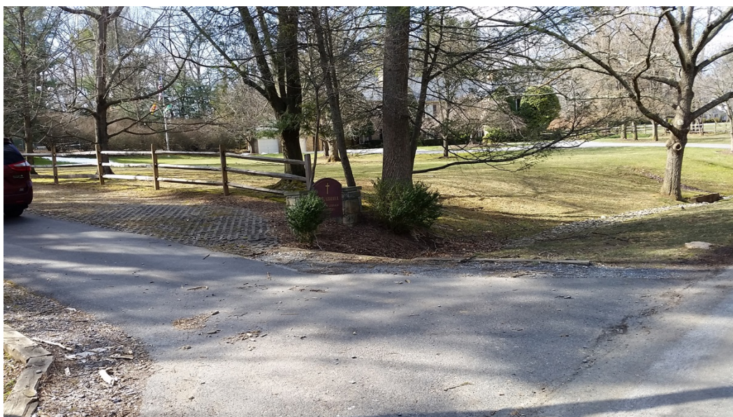
1. Main entrance off Alloway Drive, facing north