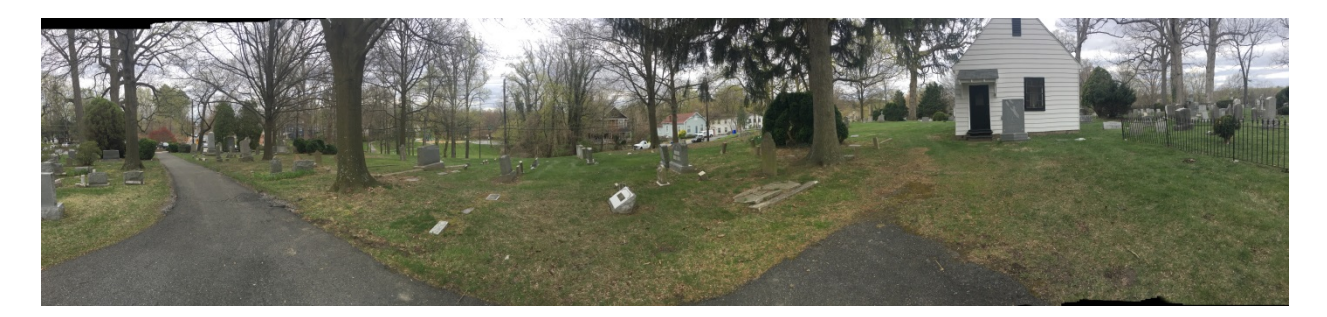
3. Panoramic from east to south to west