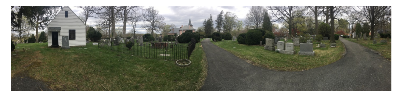
2. Panoramic from west to north to east