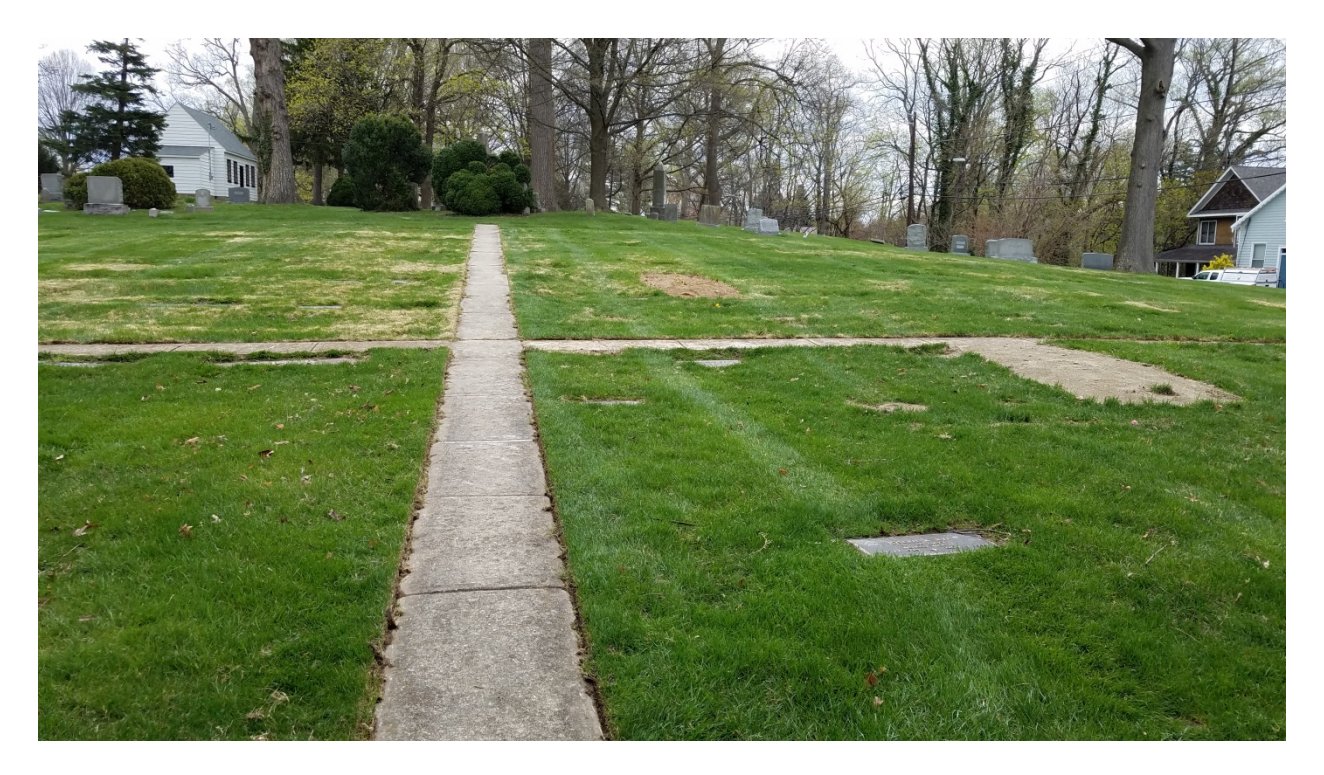
4. Western field with ground-flush markers, facing east