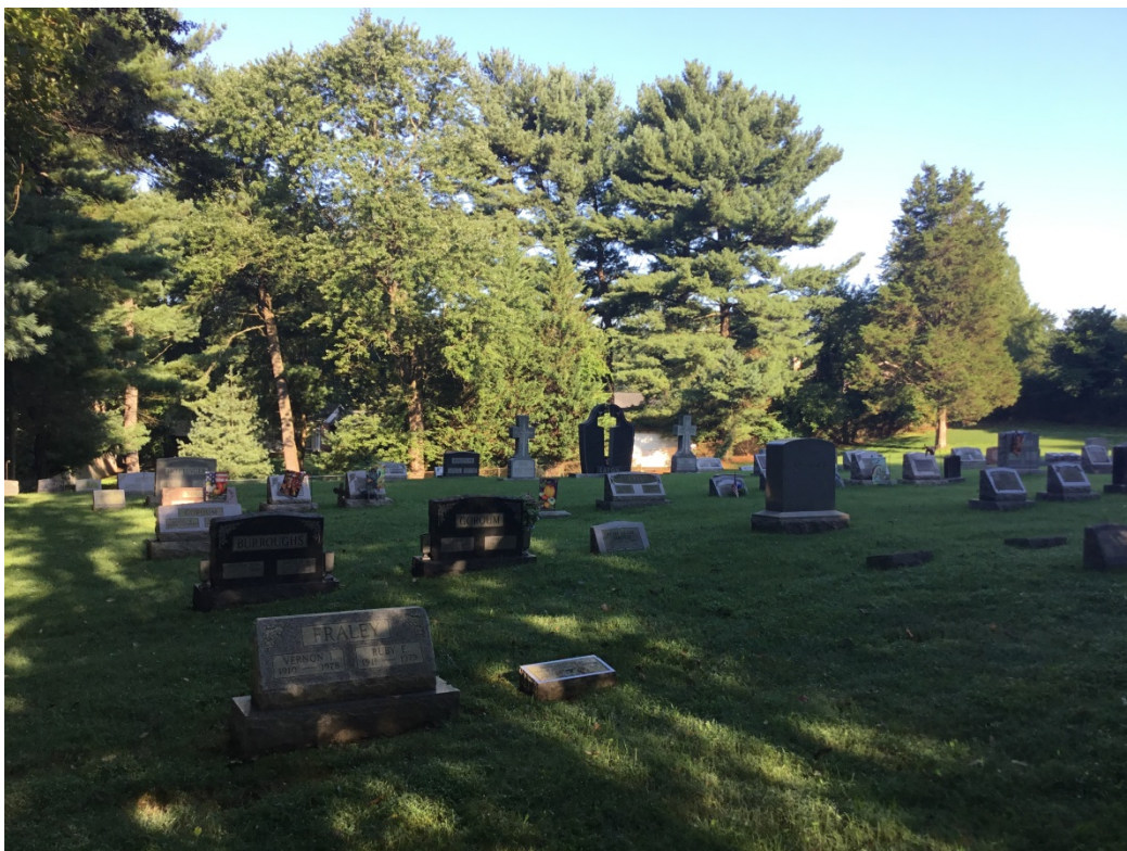
6. Cemetery from southeast corner, facing north