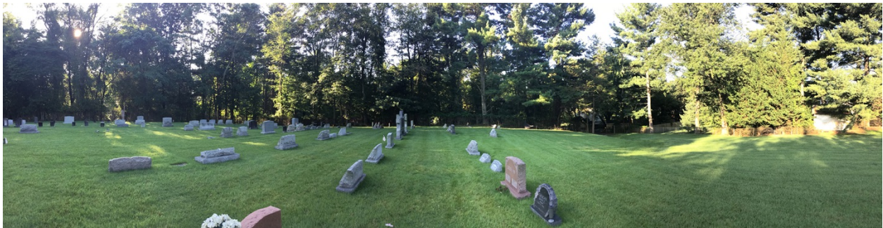
5. Panoramic from east to north to west