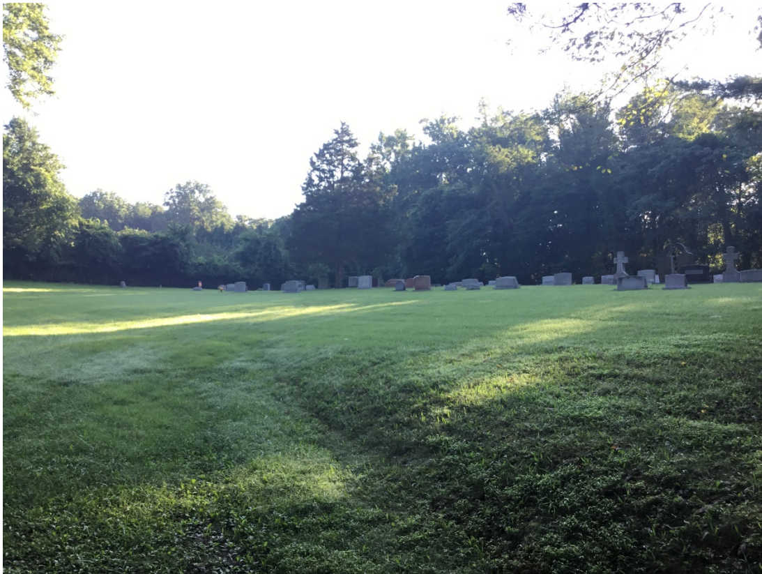
3. Approach to cemetery, facing northeast