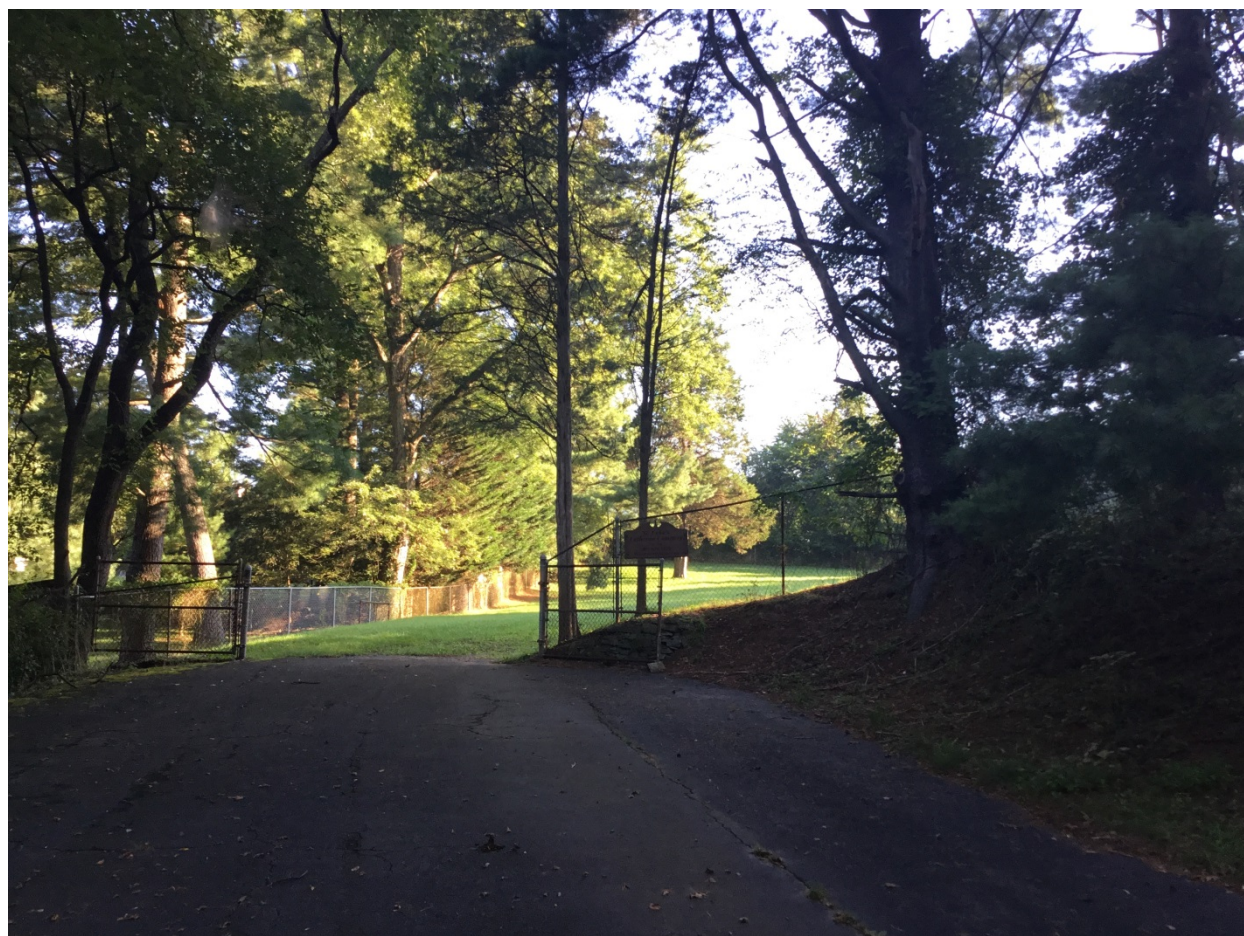
1. Entrance driveway to St. Luke's Cemetery, facing north