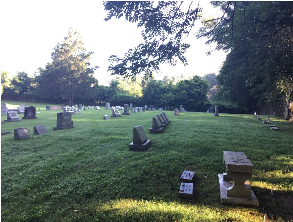
7. Cemetery from southeast corner, facing east