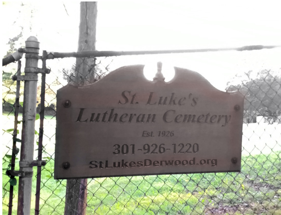
2. Cemetery sign at gate