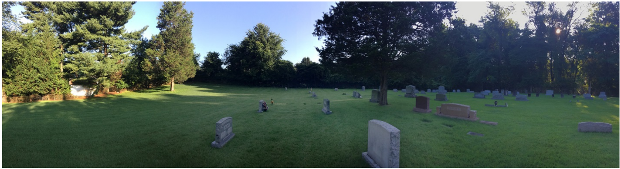
4. Panoramic from west to north to east