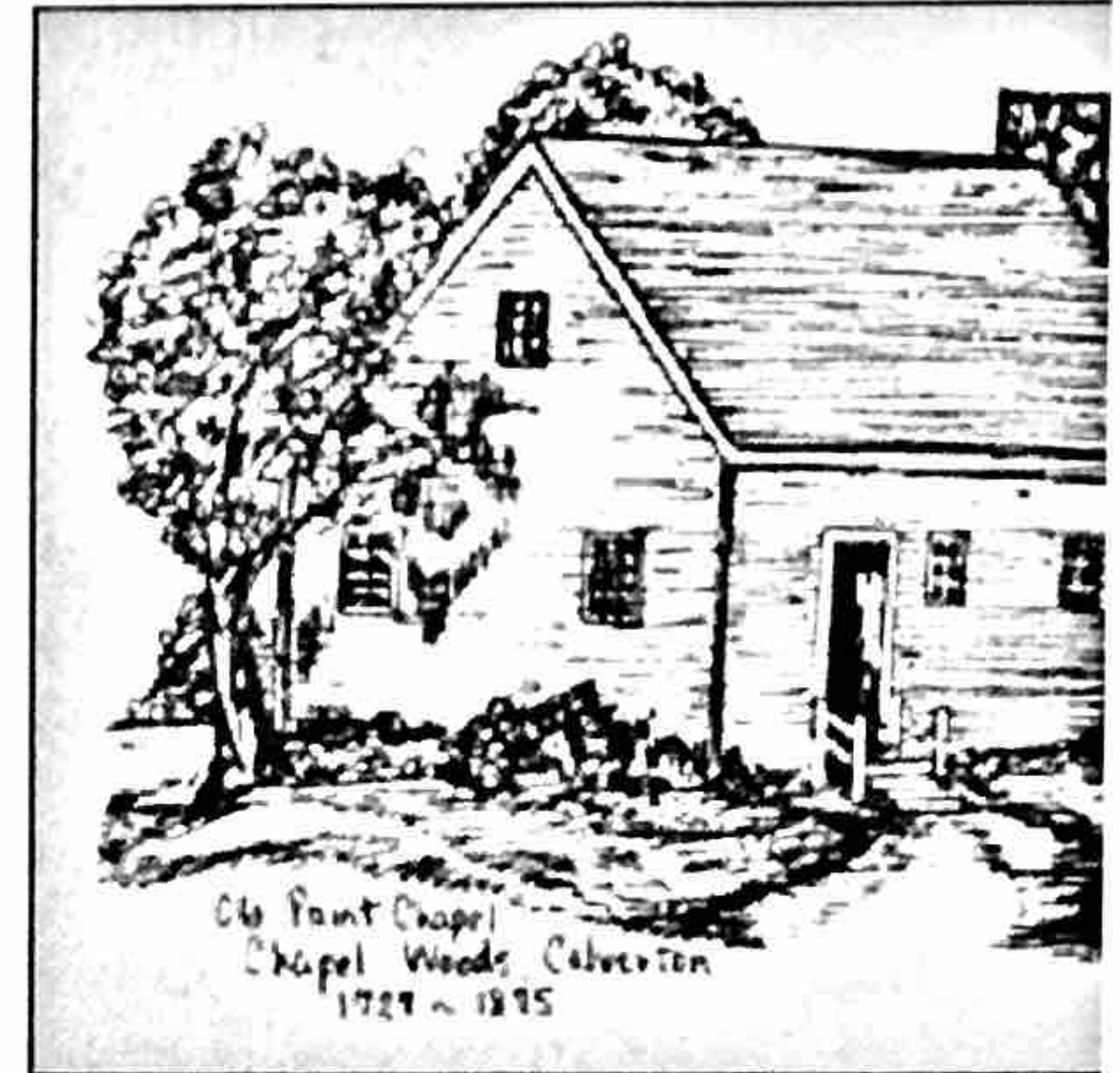
Old Paint Chapel Chapel Woods, Calverton 1729 - 1812

St. Mark's Episcopal Church stems from the Anglican Church of Maryland. In colonial times, several Anglican parishes in southern Maryland were established. One of these was the Piscataway Parish in Prince Georges County. This parish initiated the Prince Georges Parish, now known as Rock Creek Parish located in Washington, D.C. In the mid 1700's a chapel-of-ease of Rock Creek Parish was erected to serve parishioners in the remote areas along the Paint Branch stream. This chapel was given the name of Paint