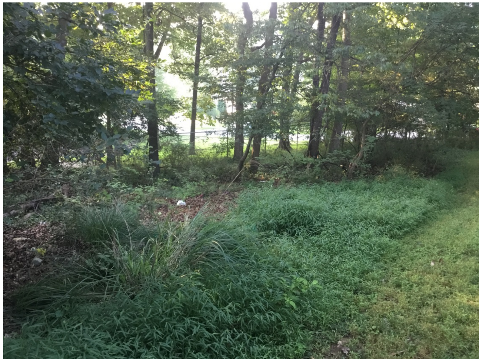
6. African American burial area, facing east