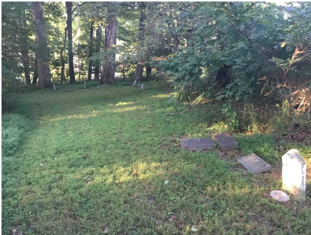
5. African American burial area, facing south