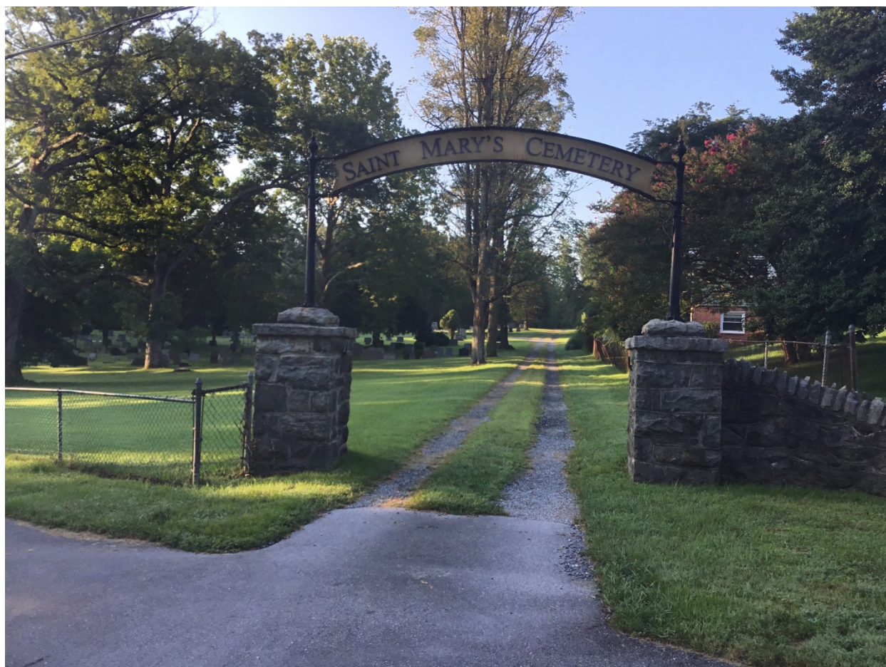
1. Entrance gate with sign, facing south