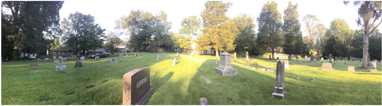
2. Panoramic from center of cemetery, south to west to north