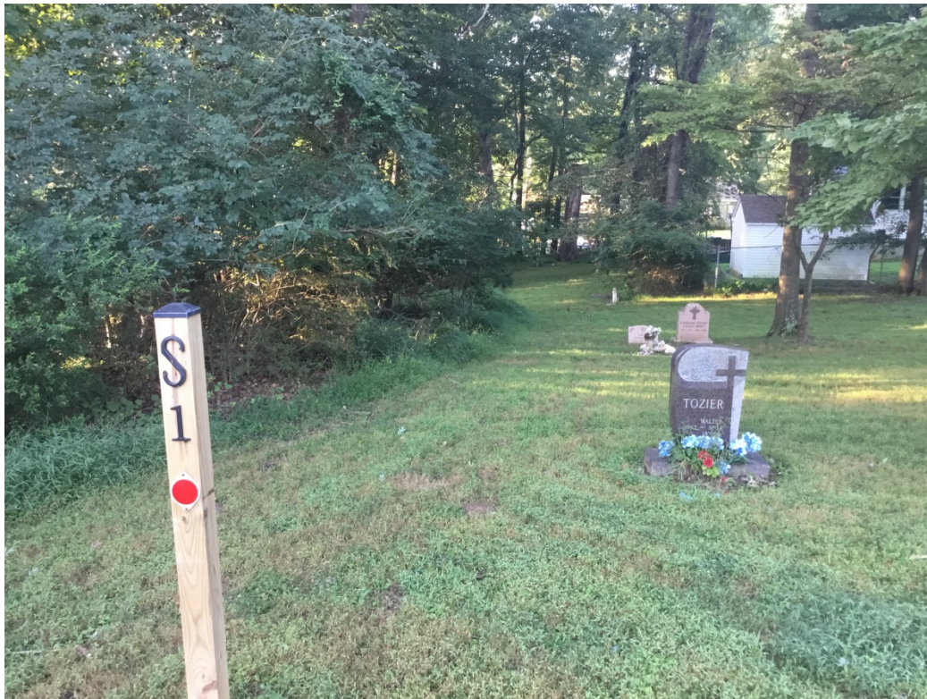
4. Pathway to African American burial area, facing south