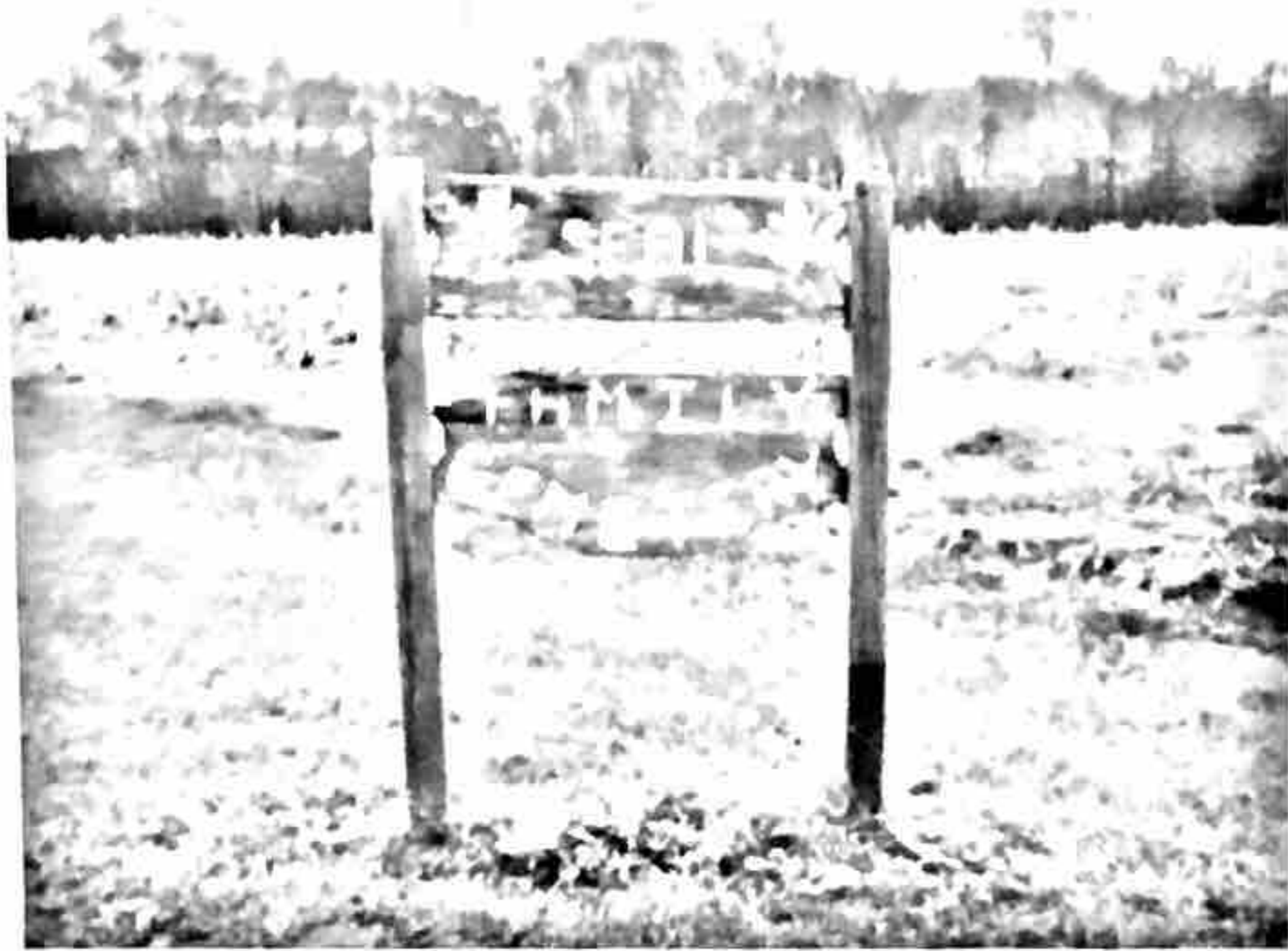
Cemetery sign near Damascus Road 144-01.JPG