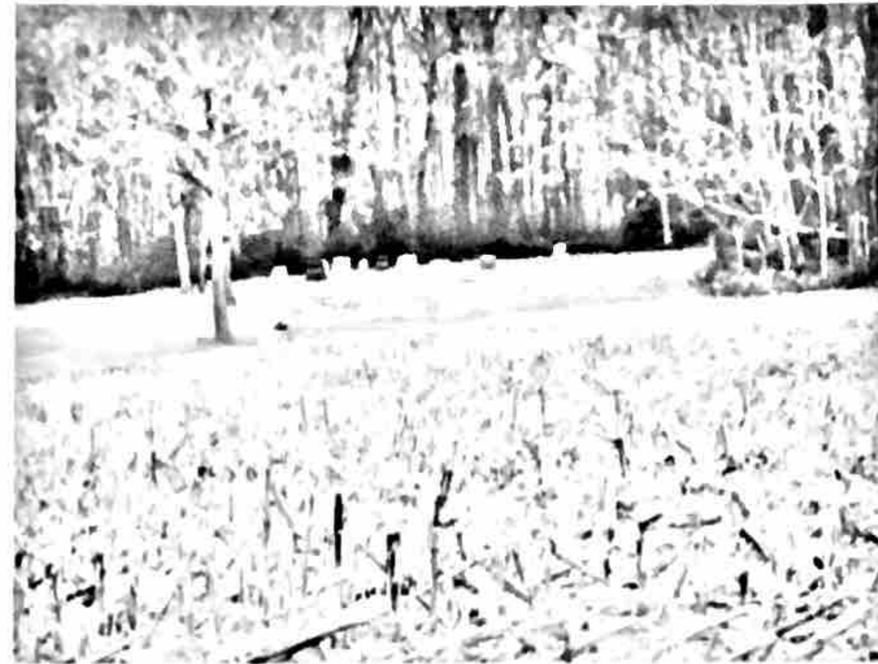
View of cemetery across field, looking northwest 144-02.JPG