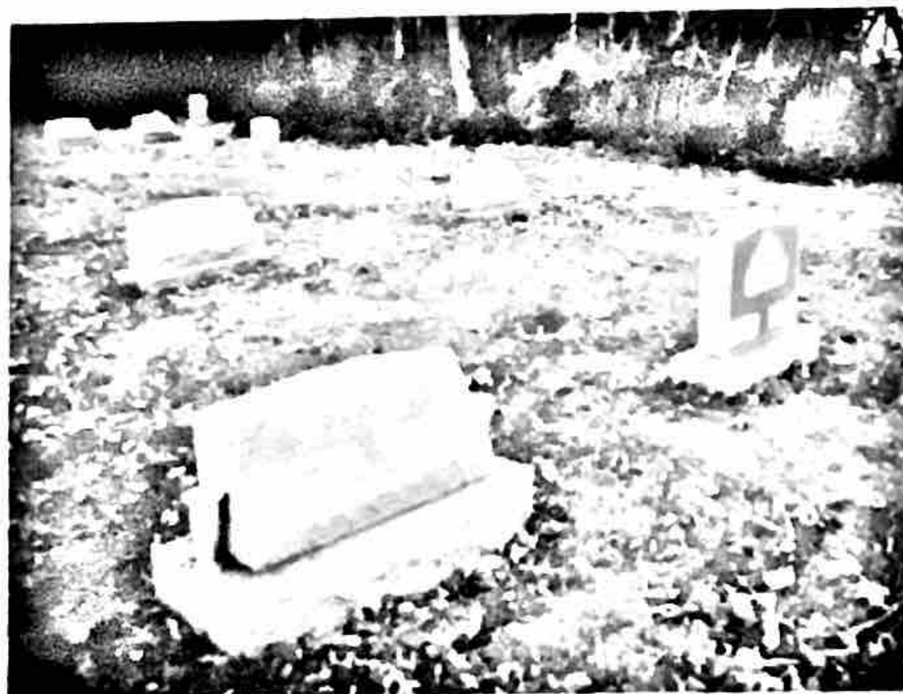
More "Mathis" and Seal" markers 144-05.JPG