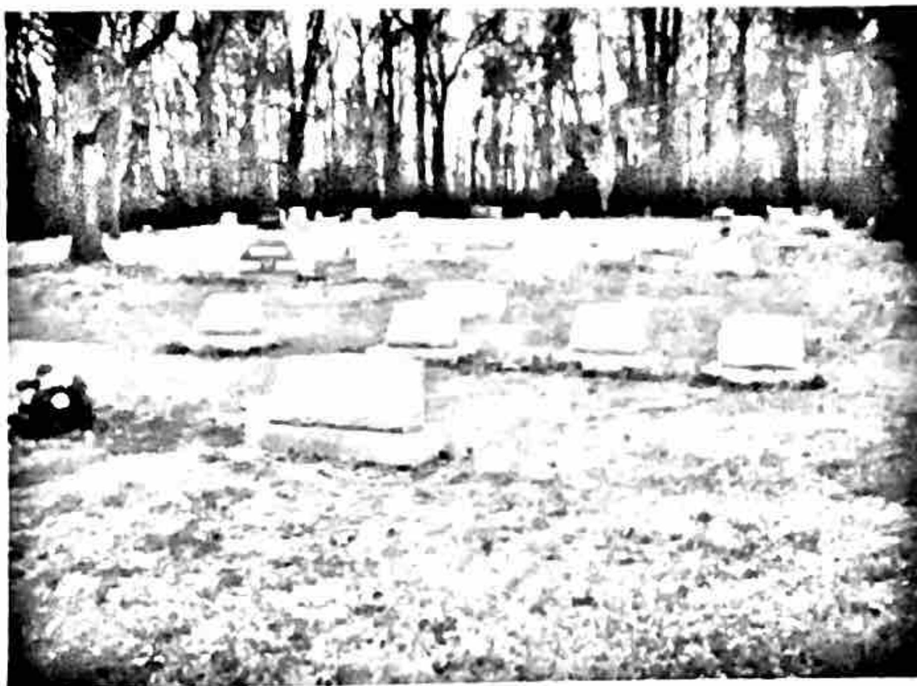
Main cemetery, looking north 144-03.JPG