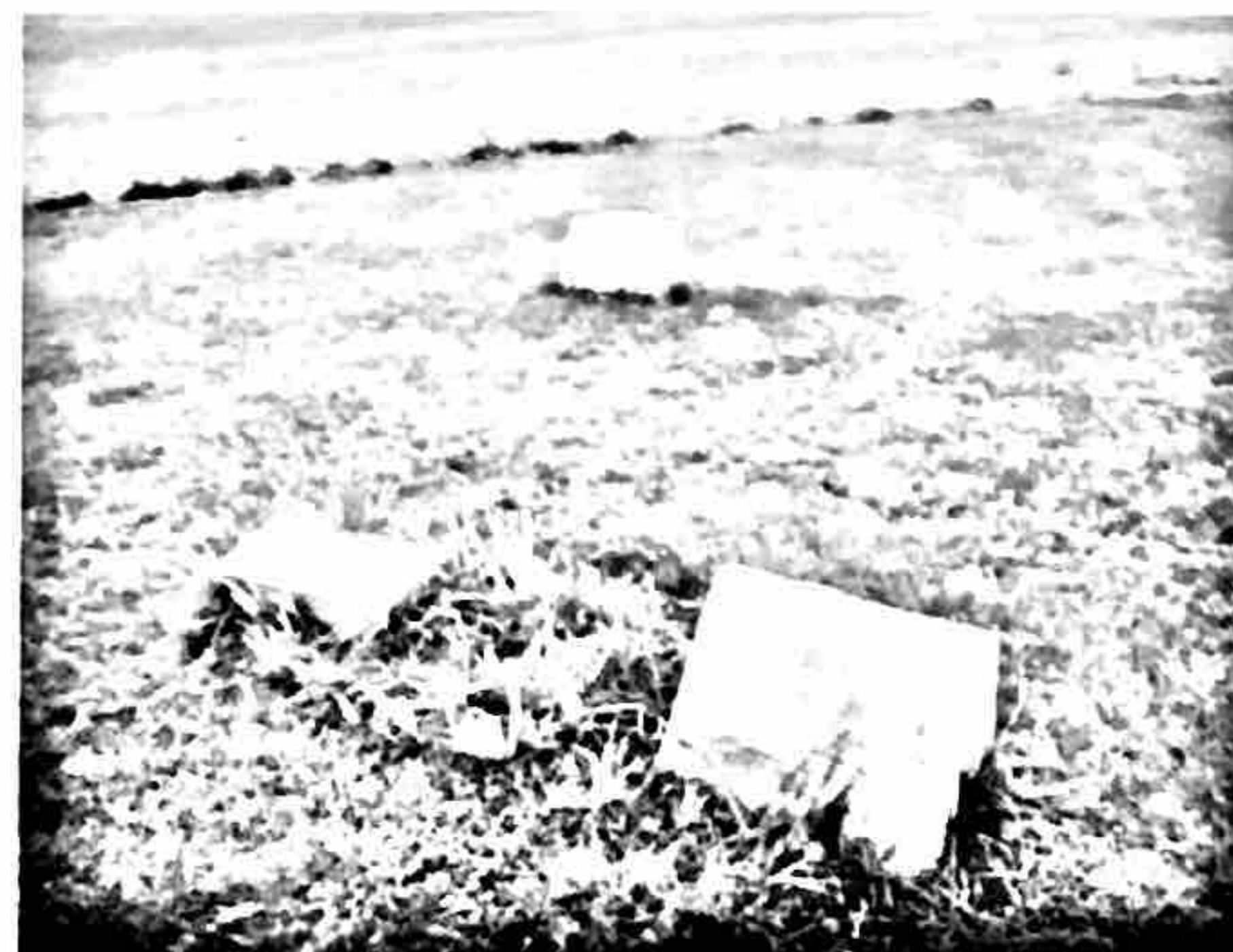
Three "Seal" markers located about 100 yards south of main cemetery 144-06.JPG

144 SEAL FAMILY CEMETERY BETWEEN 5210 & 5520 DAMASCUS RD. ETCHISON