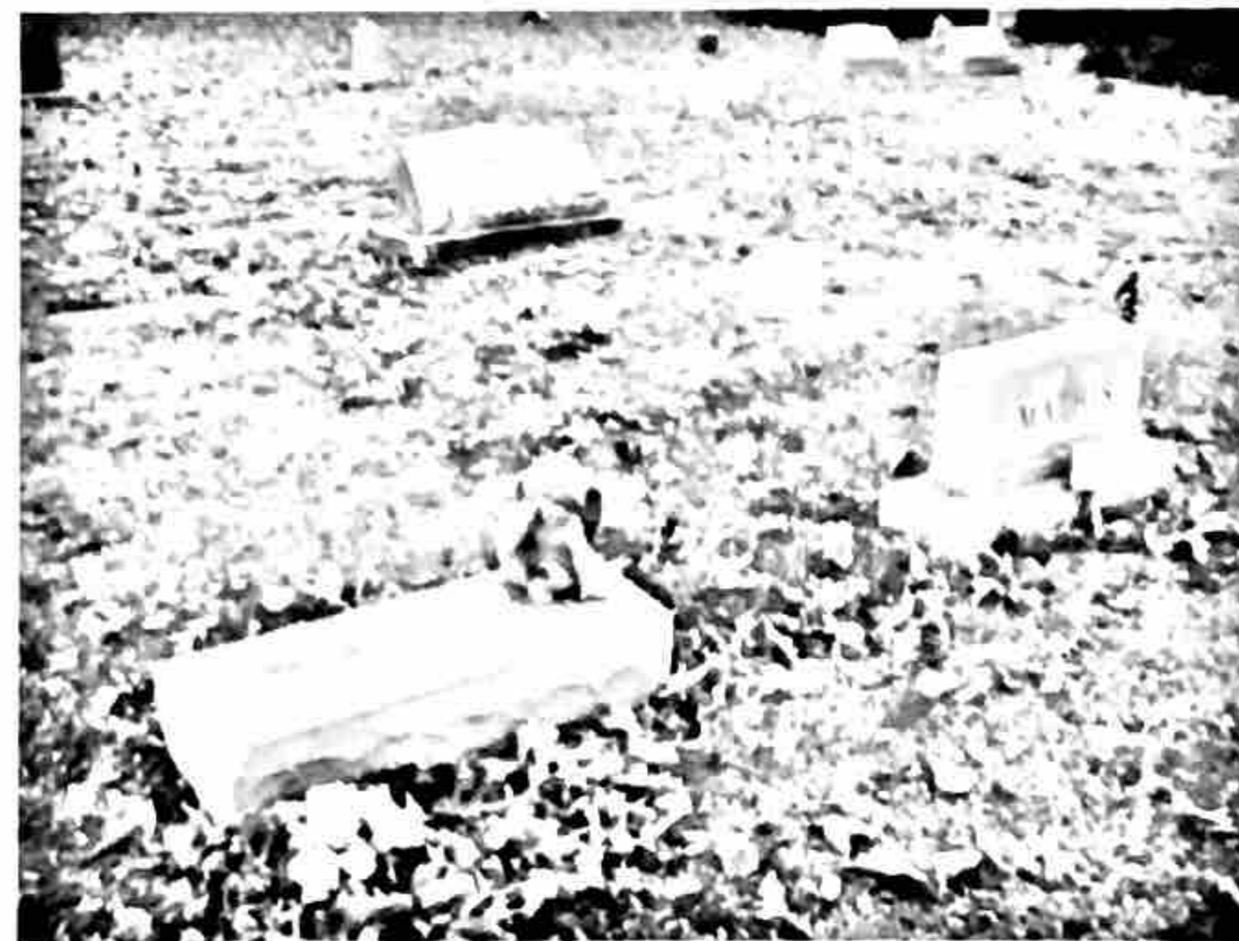
"Mathis" and "Seal" markers 144-04.JPG