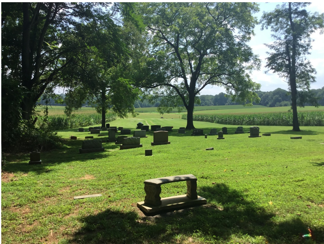
6. View from center of cemetery down to lower cemetery, facing southeast