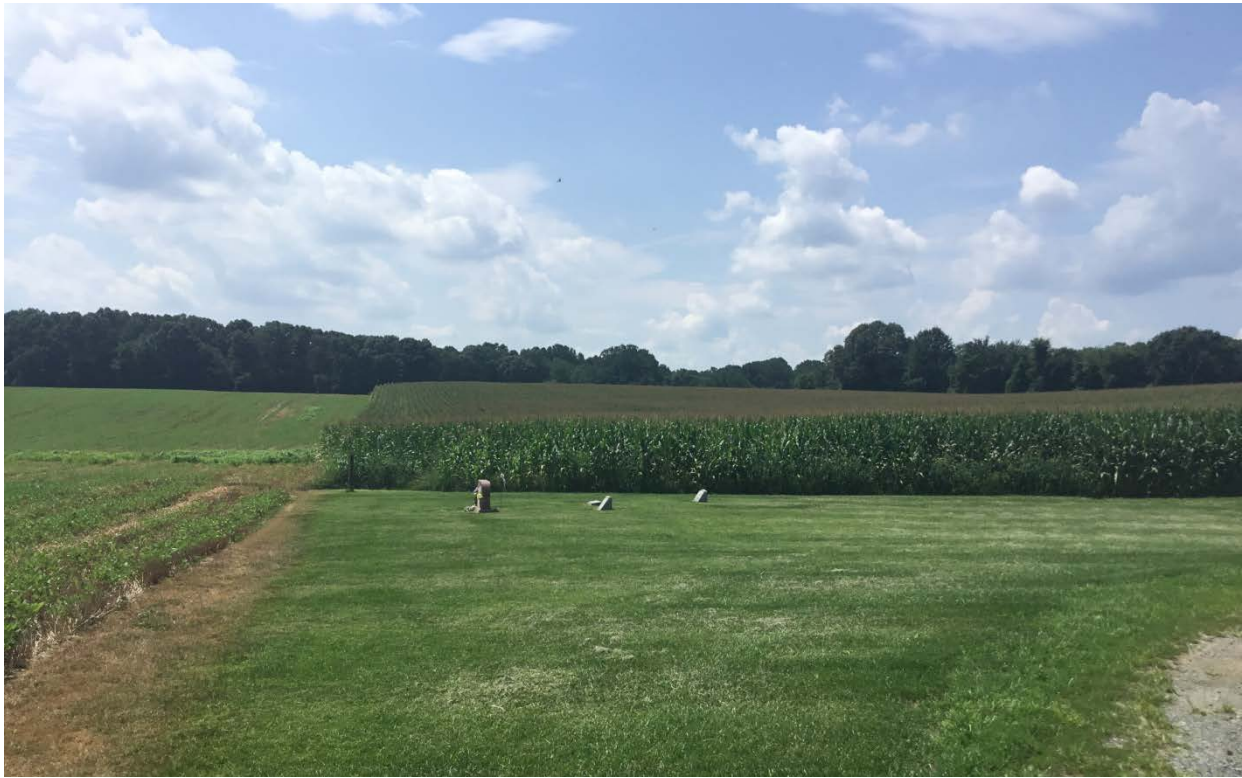
2. Lower cemetery along gravel road, facing south