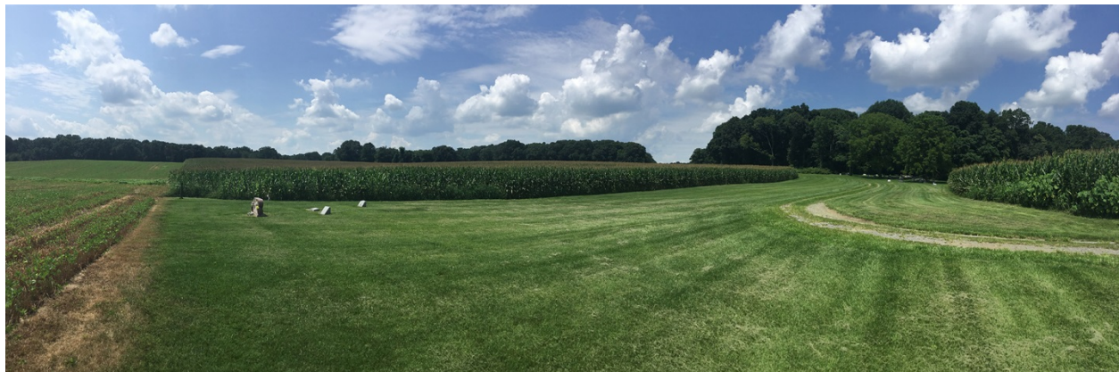
3. Panoramic from south to west to north