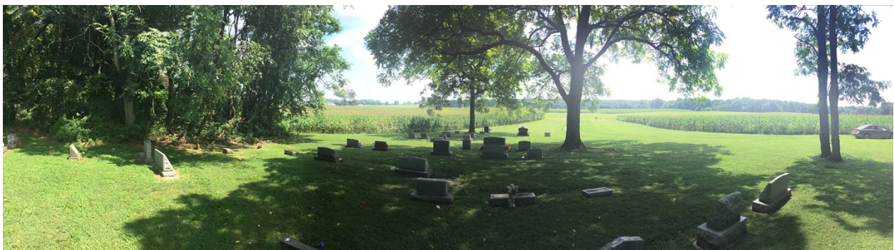
5. Panoramic of upper cemetery from east to south to west