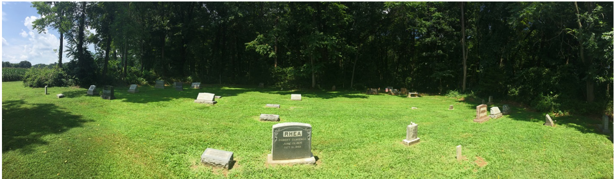
4. Panoramic of upper cemetery from west to north to east