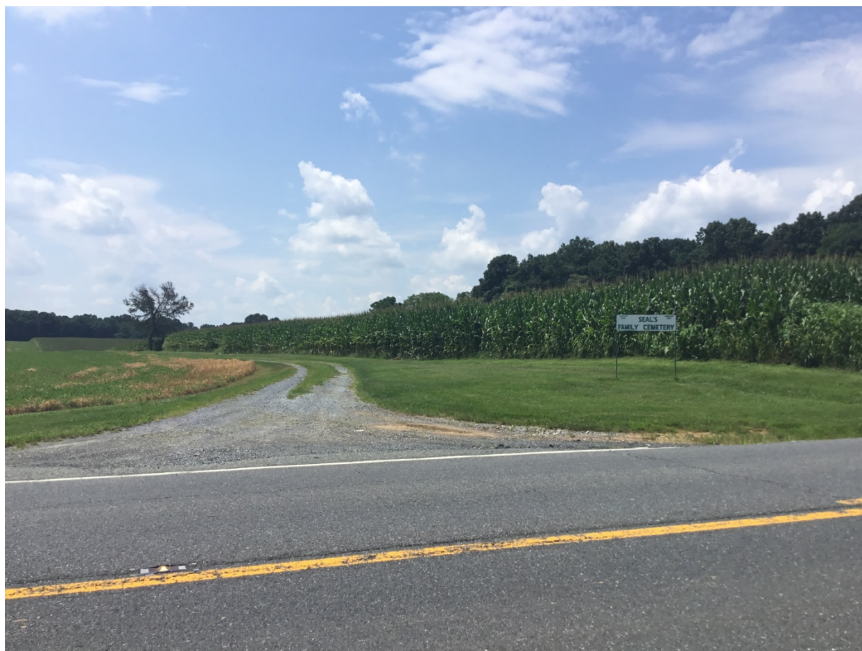
1. Entrance to cemetery from Damascus Road, facing south