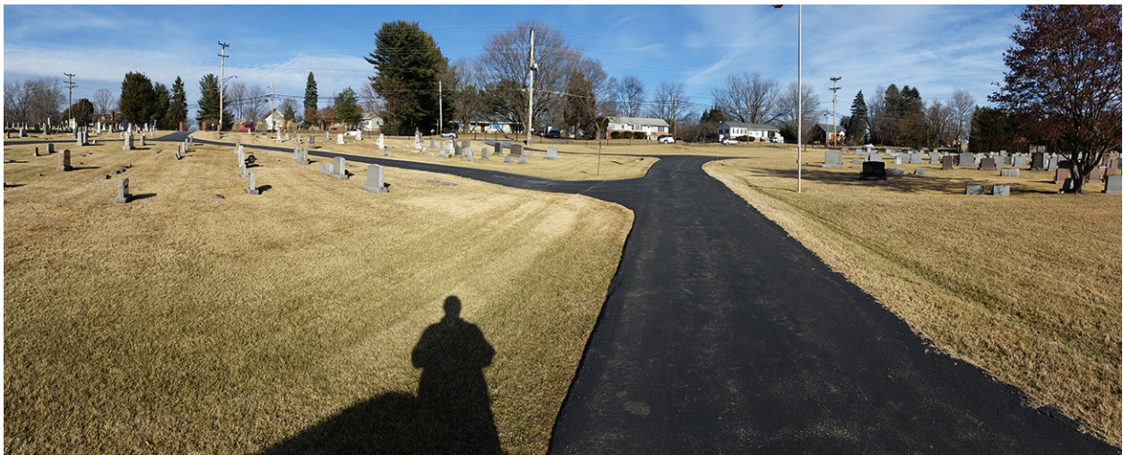
4. East-South- West panorama