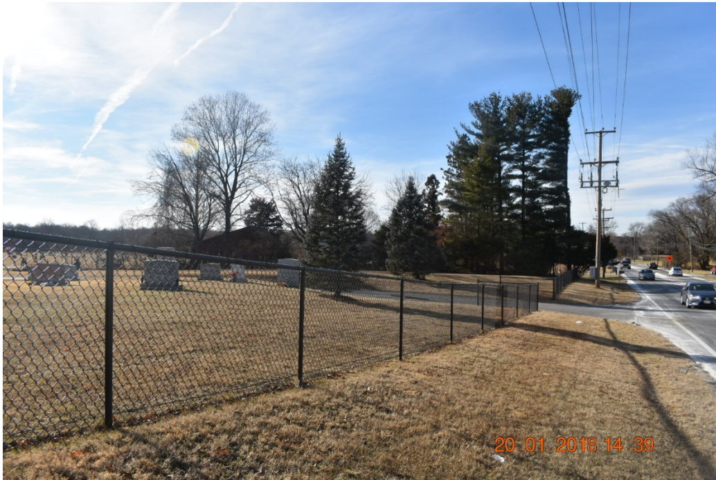
1. Roadside approach facing north