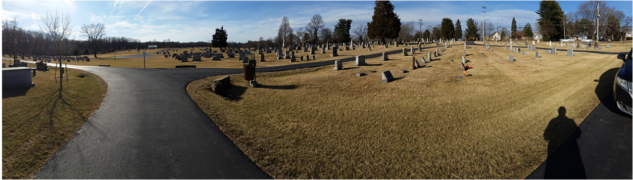
3. West-North-East panorama