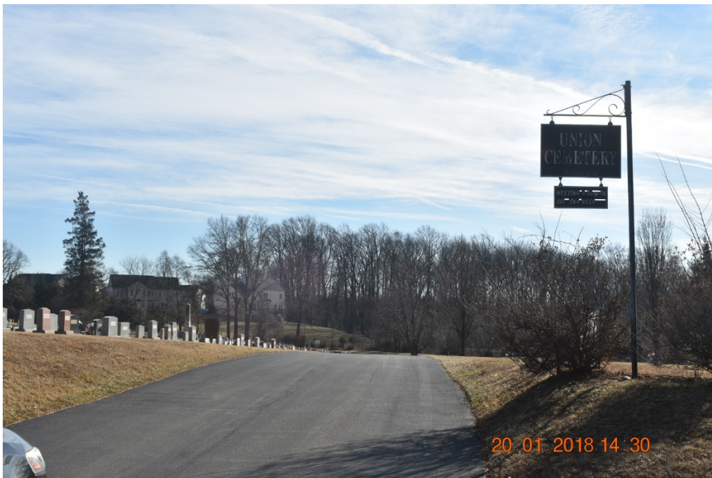
2. Entrance with sign toward center