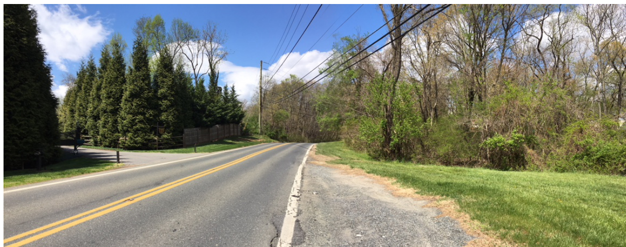
1. Corner of Piney Glen and Piney Meetinghouse, facing cemetery on right