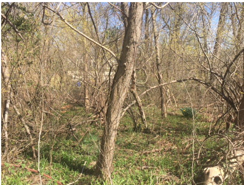
2. Center of cemetery, facing north