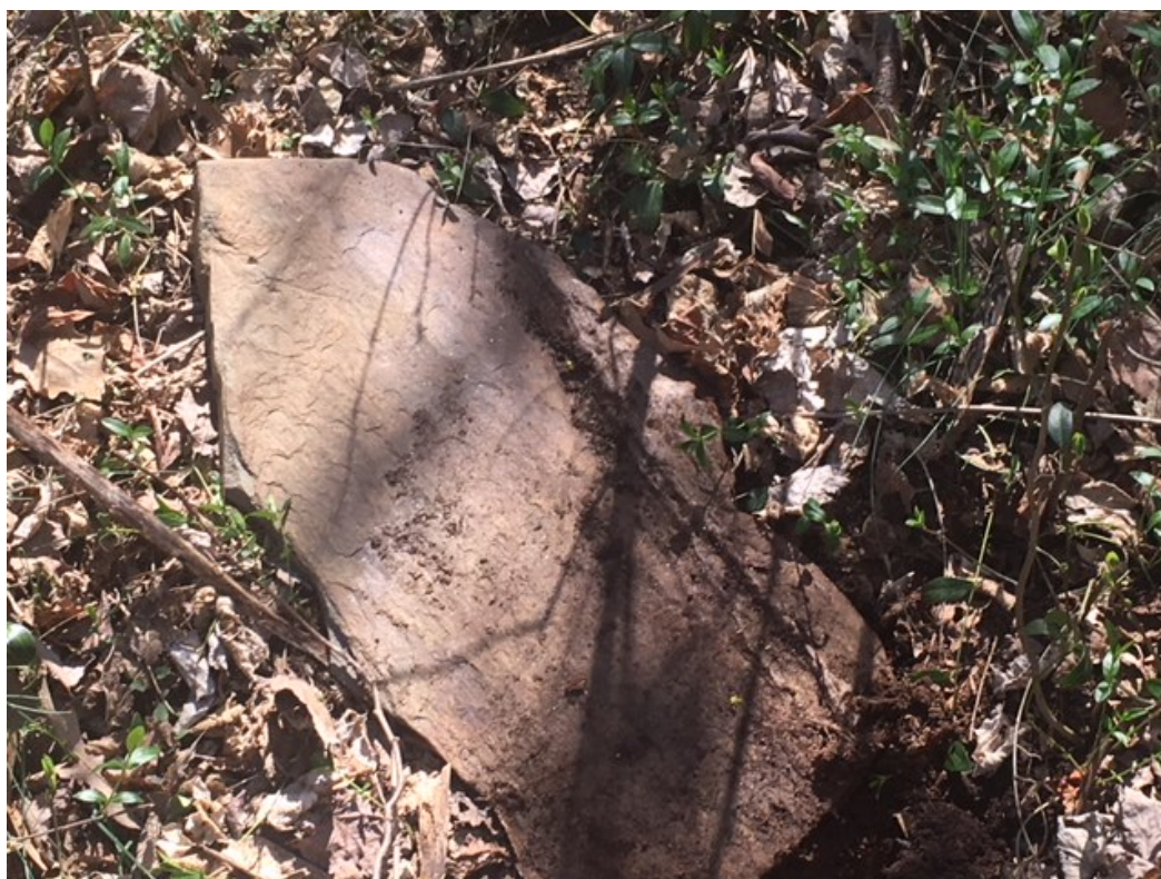
5. Cut grave stone