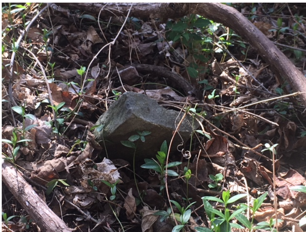
6. Field stone marker