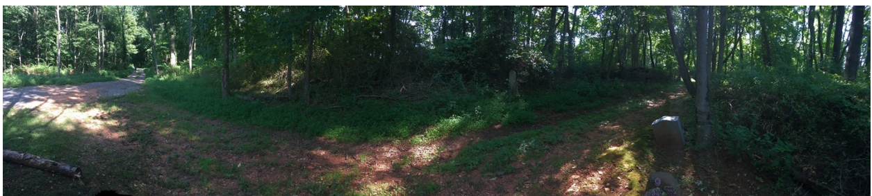
4. Panoramic of lower portion from east to south to west