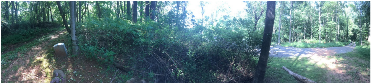
3. Panoramic of lower portion from west to north to east