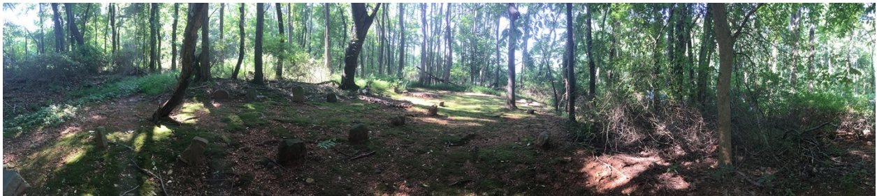
6. Panoramic of upper portion from west to north to east