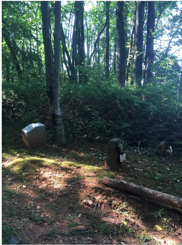
2. Cemetery detail, facing south