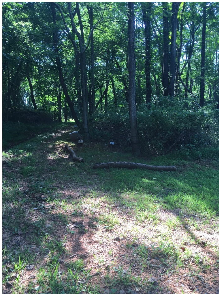
1. Approach to lower portion of cemetery, facing east