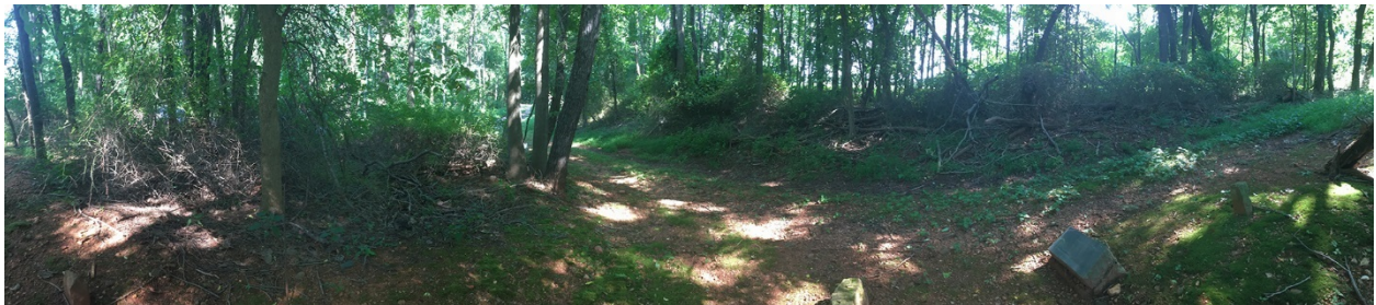
7. Panoramic of upper portion from east to south to west