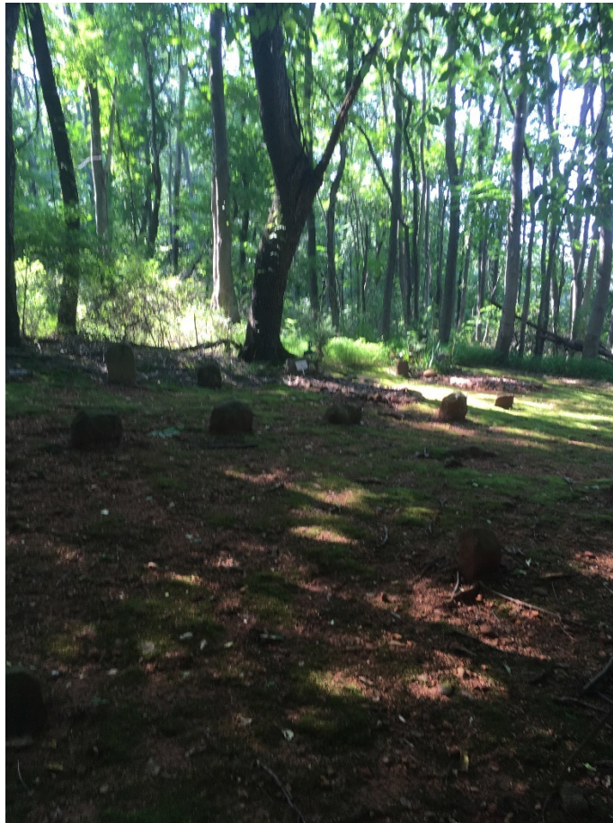
5. Upper portion of cemetery, facing southwest