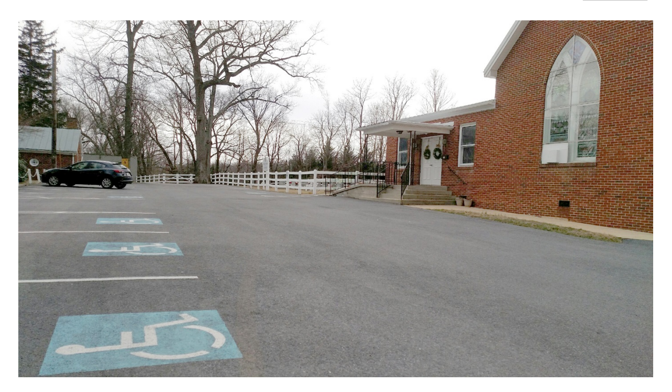
2. Church parking lot, facing south