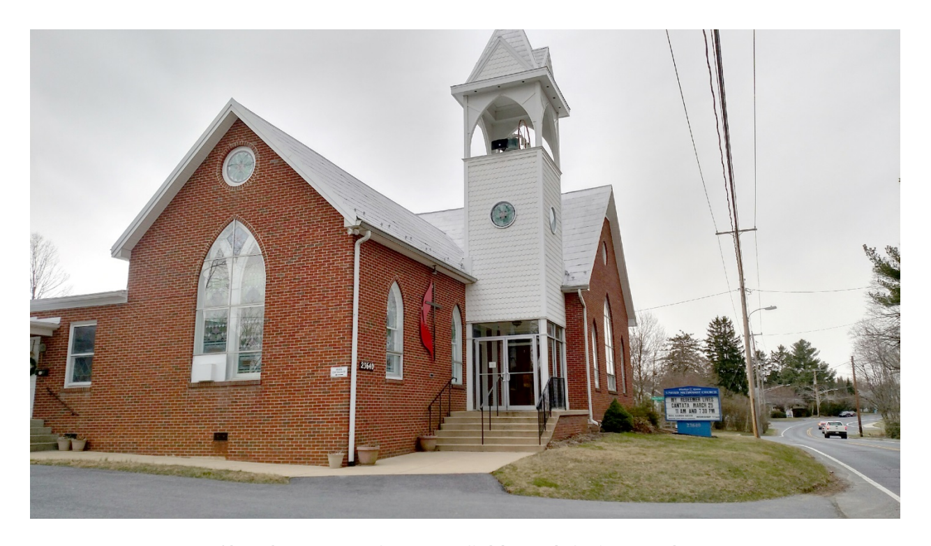
1. Church entrance from Warfield Road, facing north-west