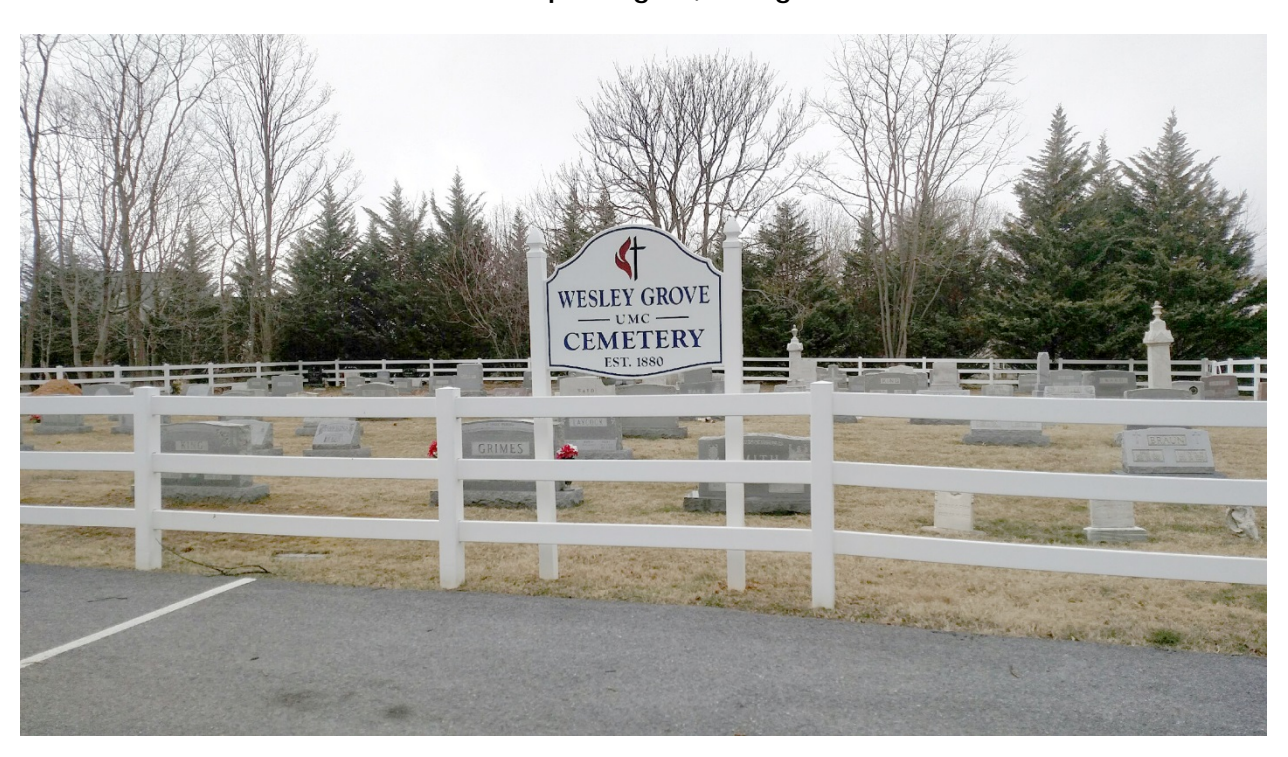
3. Cemetery sign, facing north