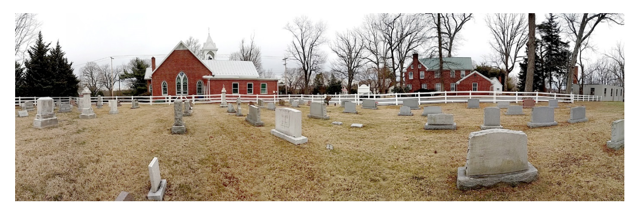
5. Panoramic from west to north to east