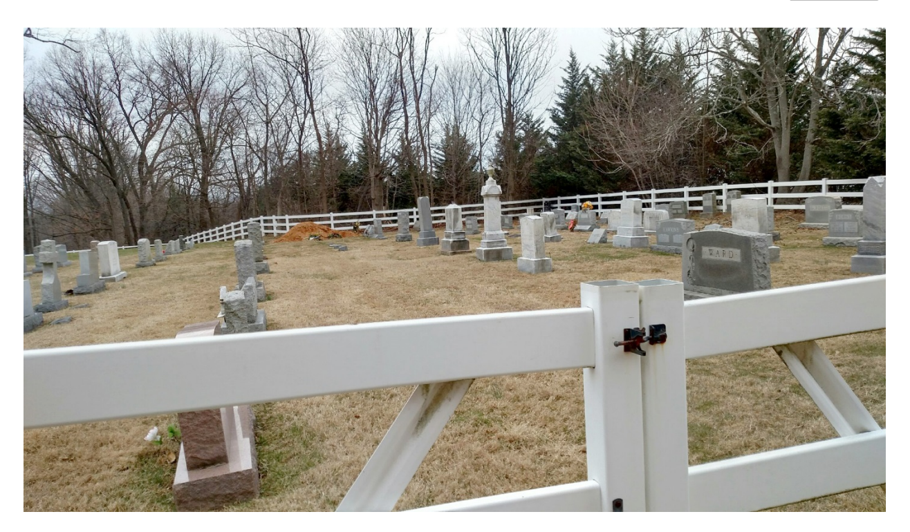
4. Cemetery entrance, facing north