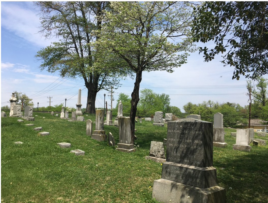
5. Photo from center of cemetery, facing northeast