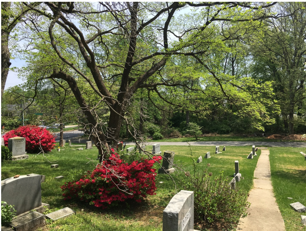
8. Photo from center of cemetery, facing south