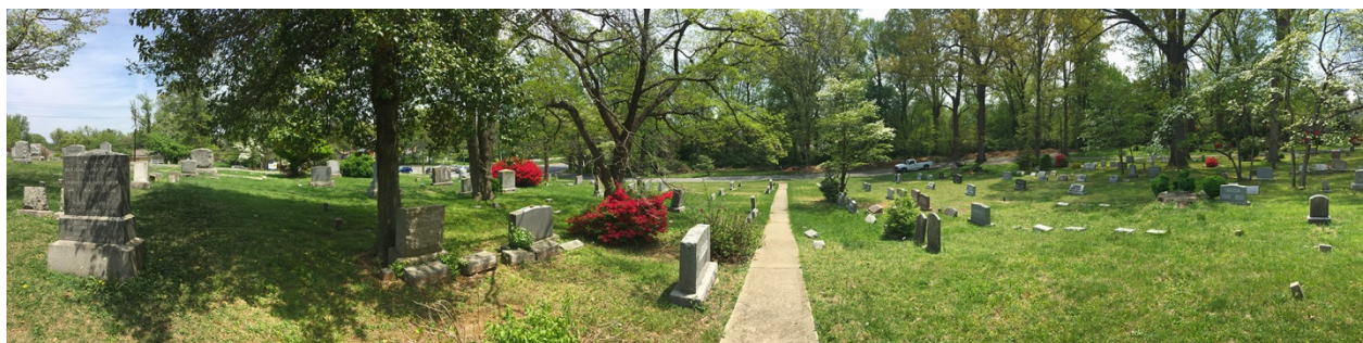
4. Panoramic from east to south to west