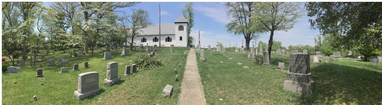
3. Panoramic from west to north to east