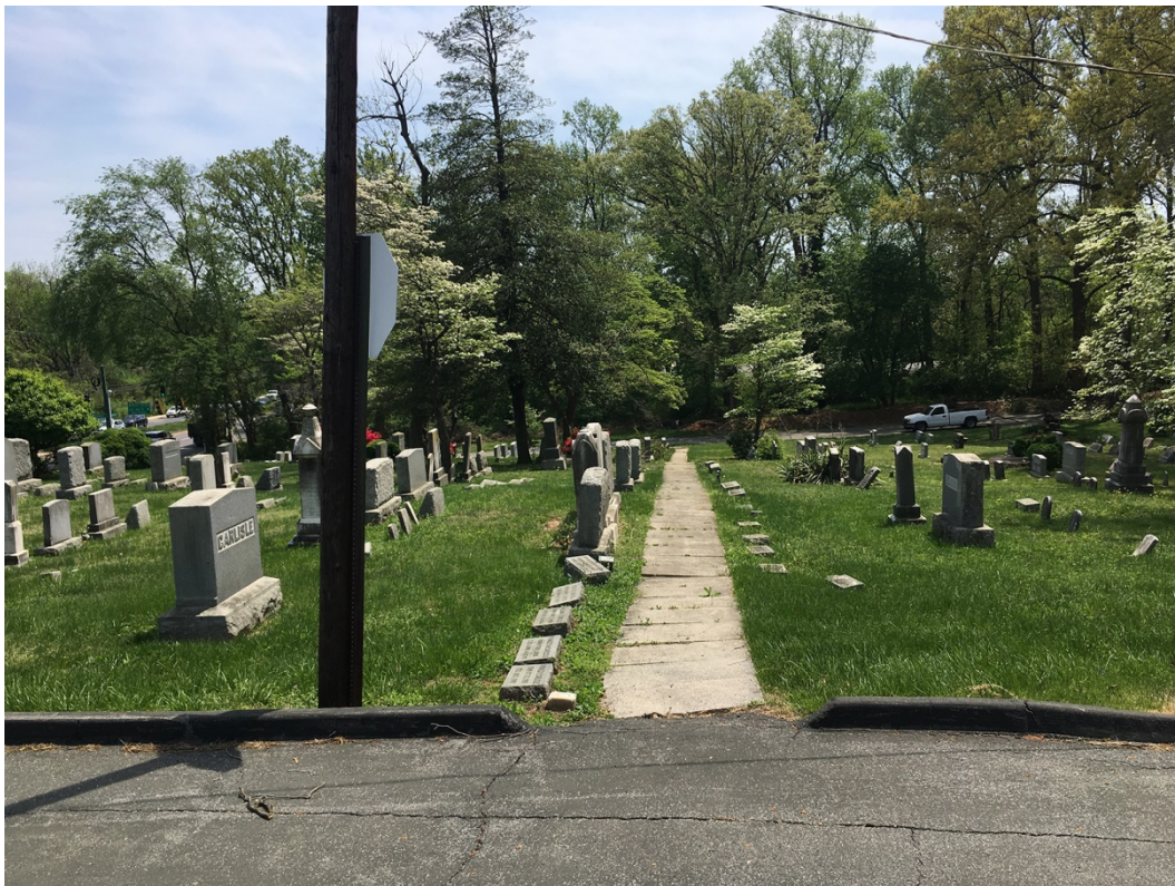
2. View down main walk through cemetery from Church, facing south