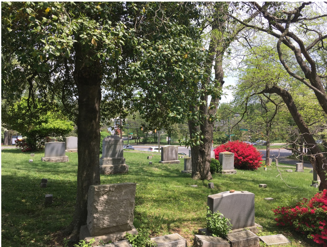
7. Photo from center of cemetery, facing southeast