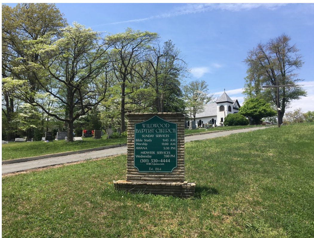
1. Driveway entrance to church and cemetery, facing northwest