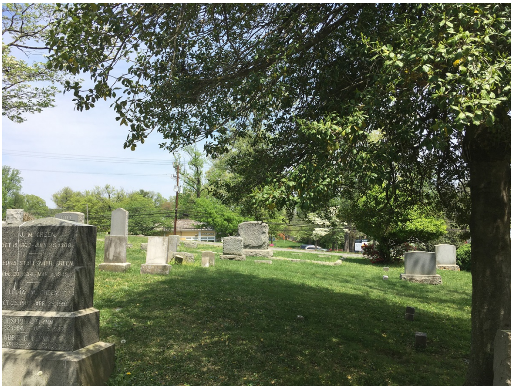
6. Photo from center of cemetery, facing east