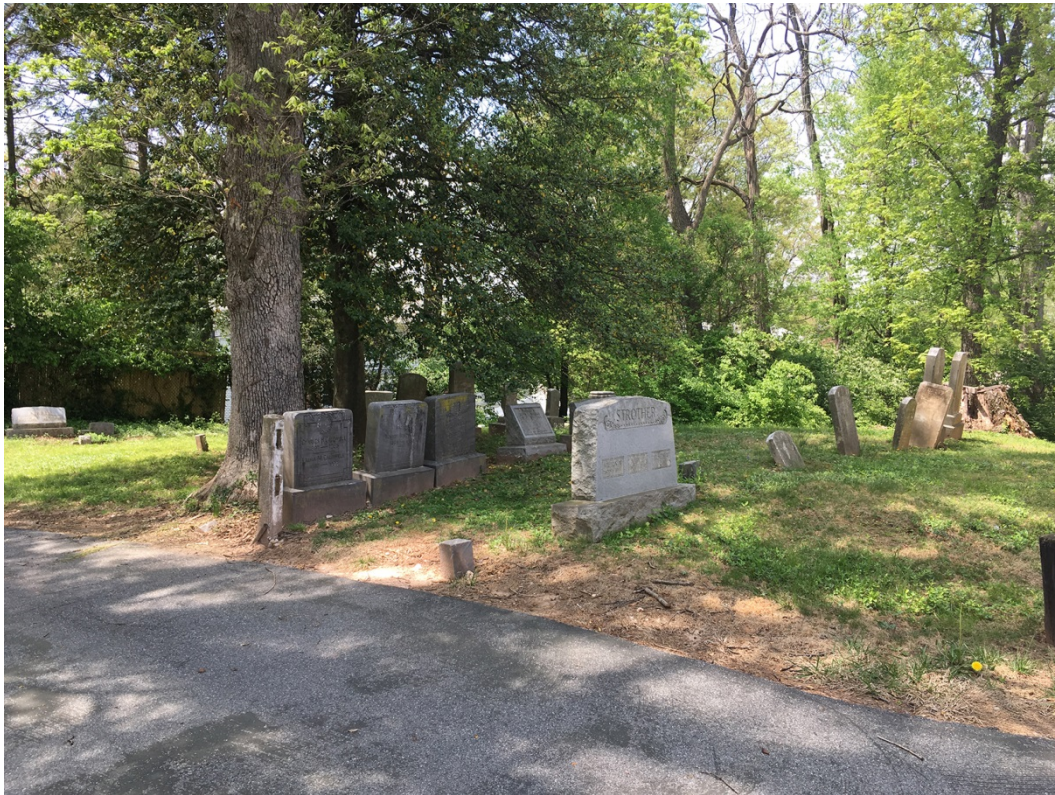
11. Photo of gravestones behind west side of sanctuary, facing west