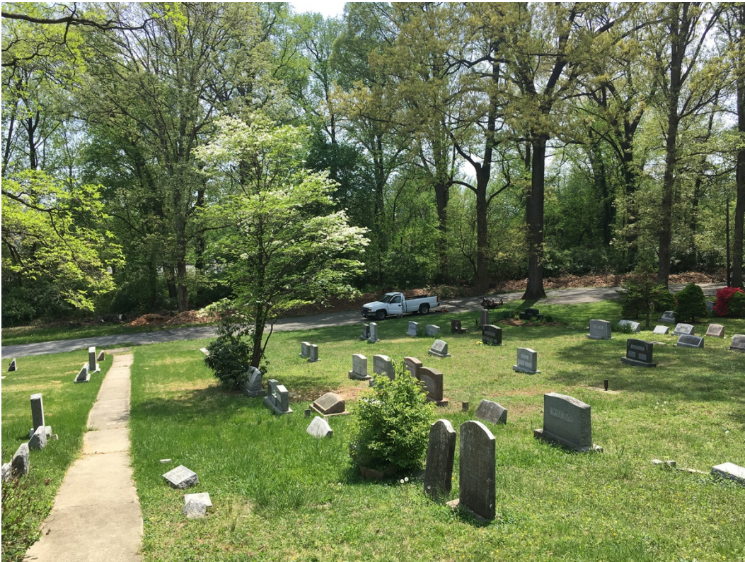
9. Photo from center of cemetery, facing southwest