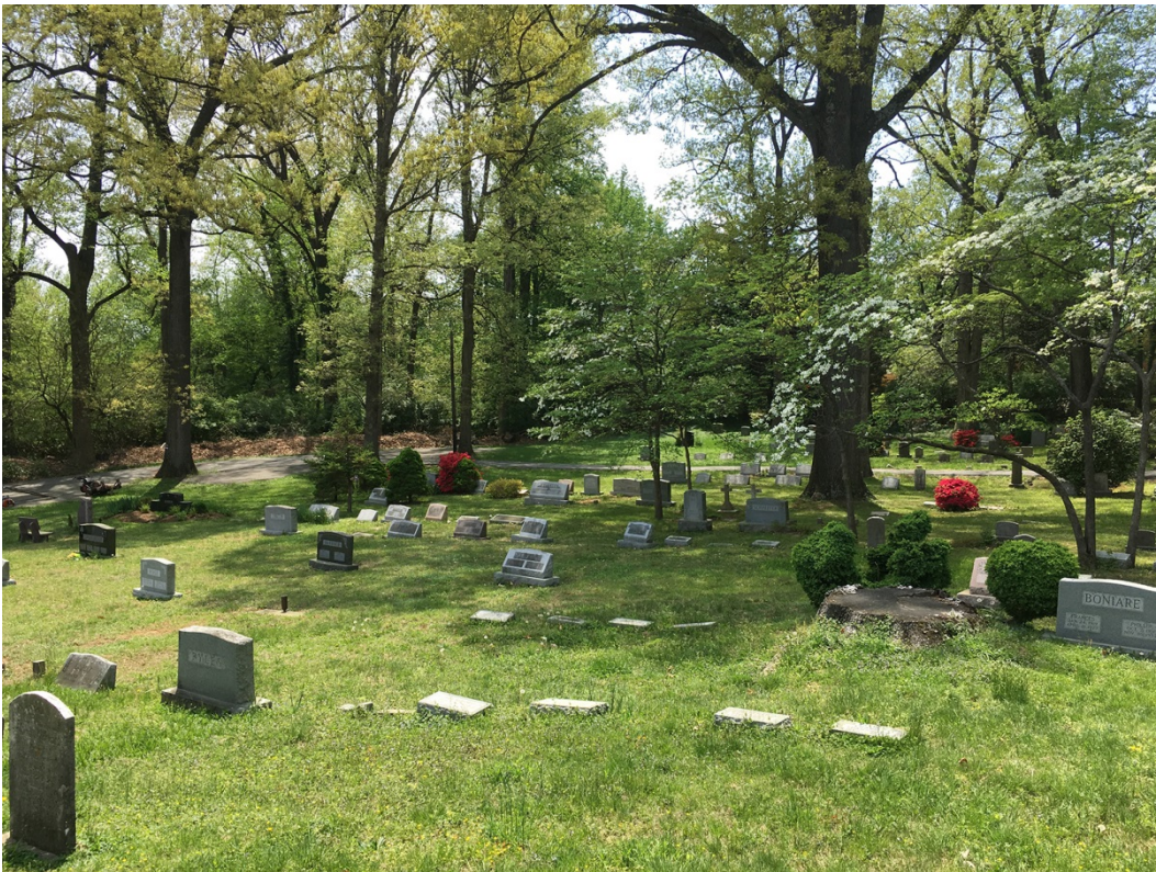
10. Photo from center of cemetery, facing west