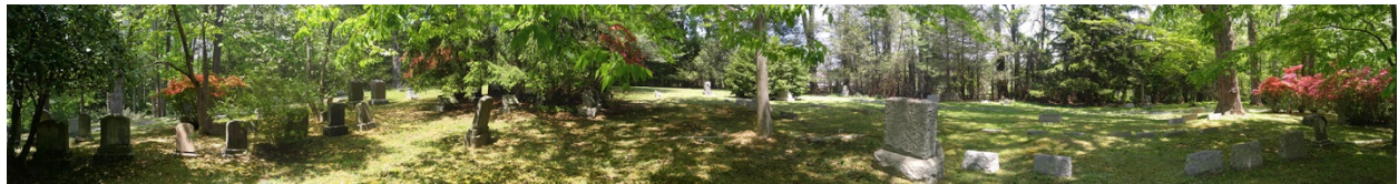
3. Panoramic from west to north to east