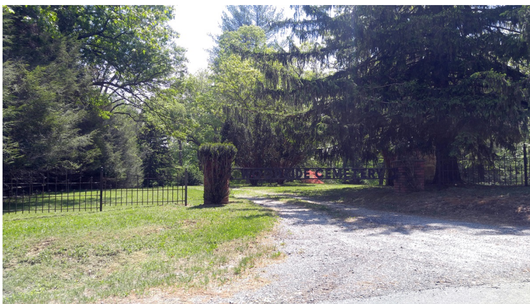
1. Entrance gate along Haviland Mill Road, facing south