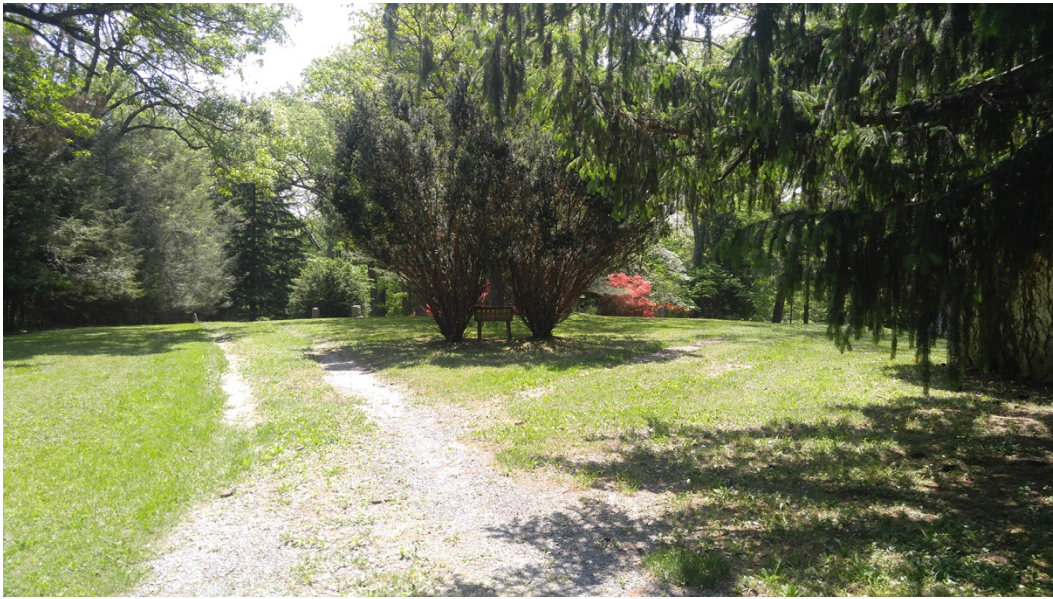
2. Circular gravel driveway through center of cemetery, facing south