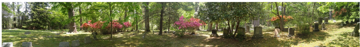
4. Panoramic from east to south to west