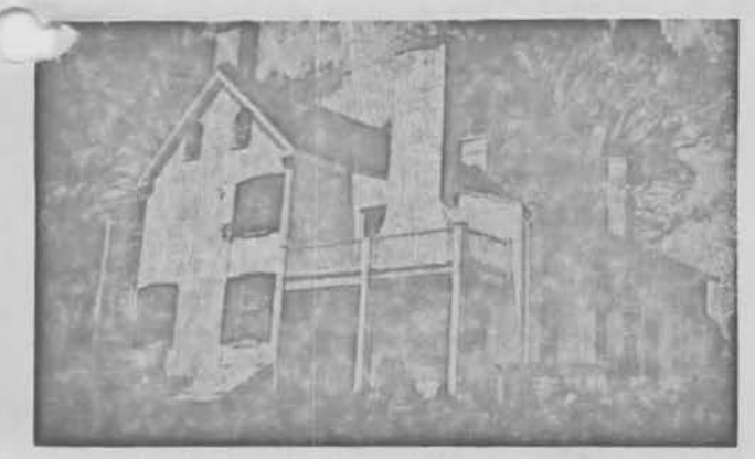
NO. 108 E-10 THOMAS LEA 1837-'38 BRICK

treading out the grain with horses driven around the barn floor. This new device had two cylinders with teeth upon their periphery. They were rotated by gearing driven by four horses hitched to arms traveling in an endless circle. This outfit was taken from farm to farm around the neighborhood.