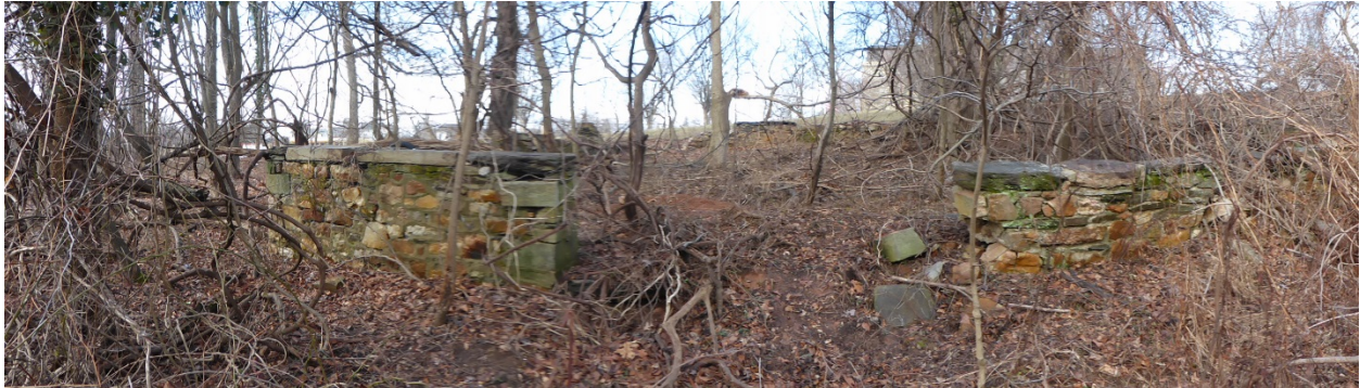
2. Panoramic from Entrance facing North