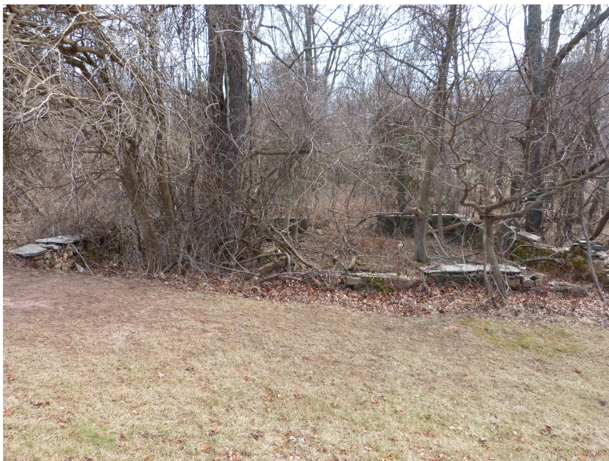
1. Cemetery from Church parking lot, facing South