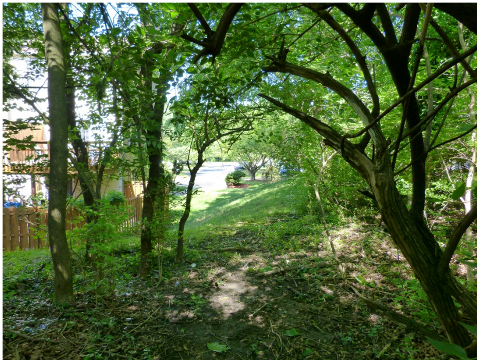
10. View down from knoll to townhomes, facing west