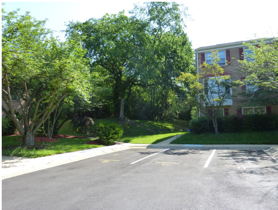
1. Approach to cemetery from Baritone Court, facing east