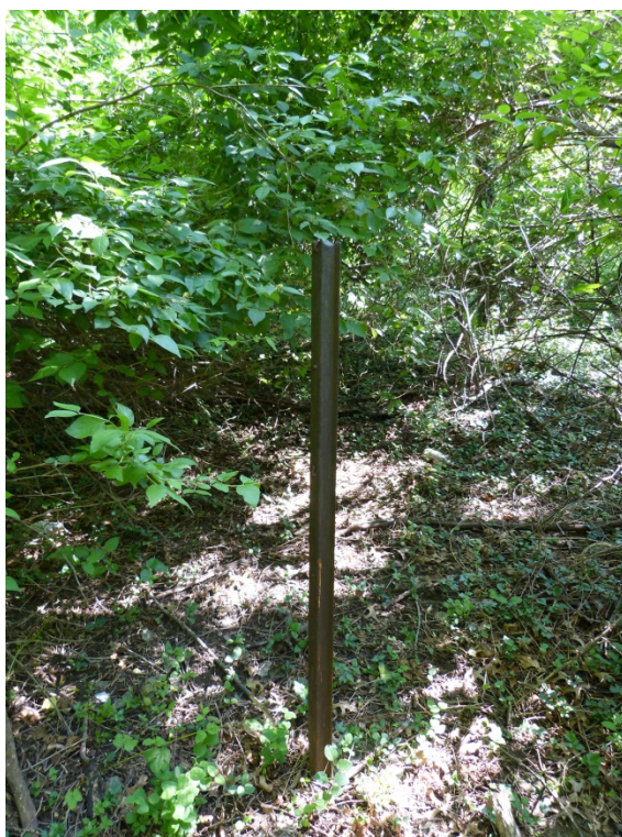
7. Obscure metal pipe in middle of cemetery