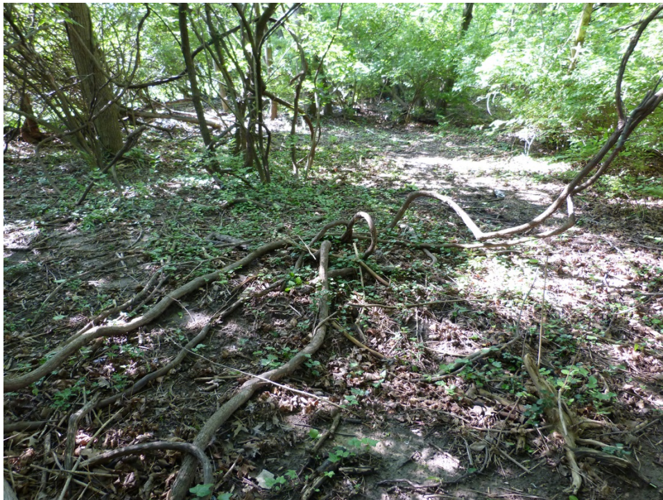
9. Trench or depression, possibly storm water run-off