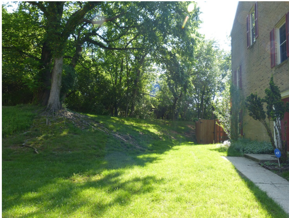
2. Access to knoll along townhome lawn, facing east