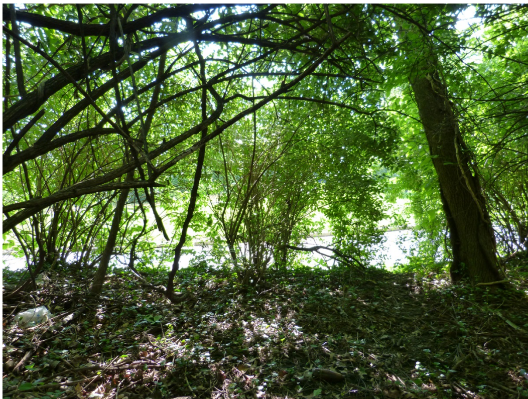
8. View to exit ramp from New Hampshire Ave., looking east