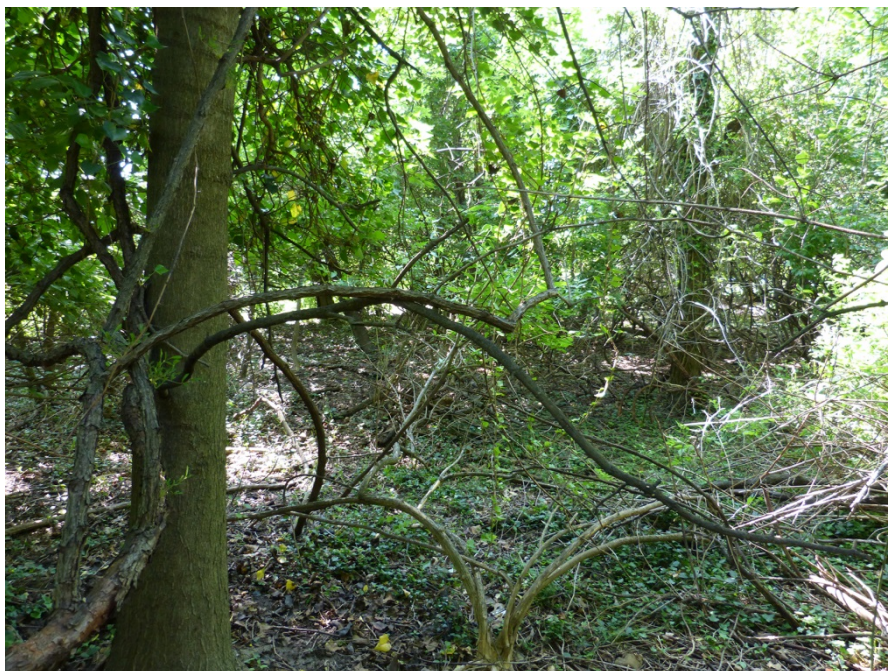
6. Trees and vines everywhere, vinca on ground, facing north