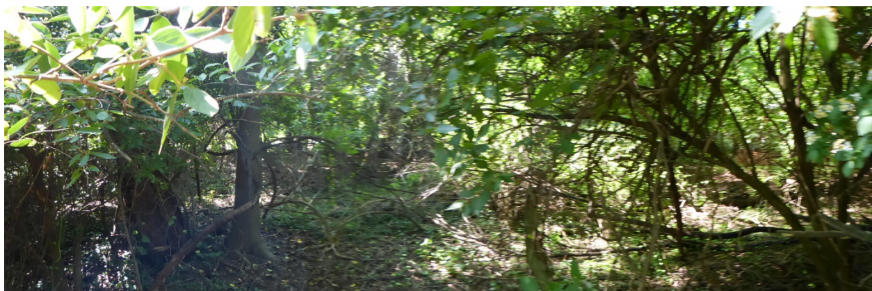
4. Panoramic from east to south to west