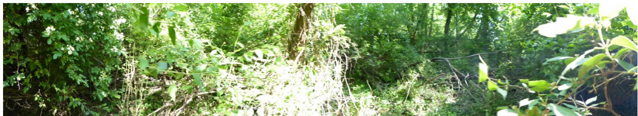
3. Panoramic from west to north to east