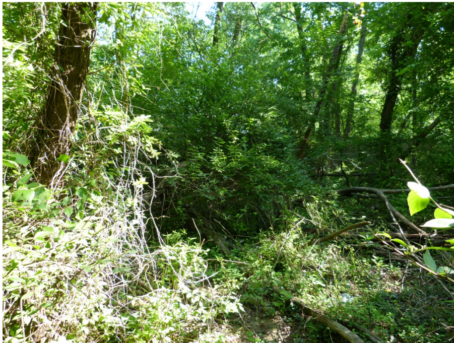
5. Overgrowth of vegetation, facing east