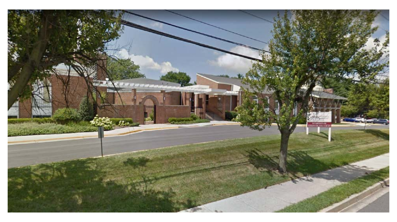
1. View of memorial garden from South Frederick Avenue, facing south