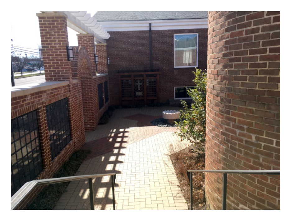
3. Secondary access to memorial garden, facing east