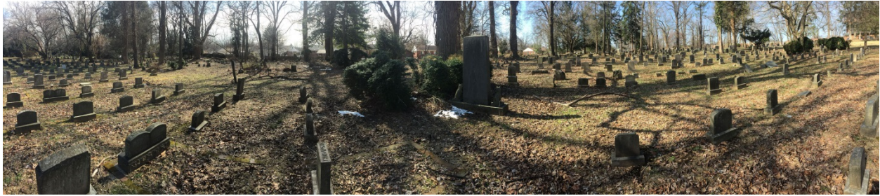
4. Panoramic from east to south to west.