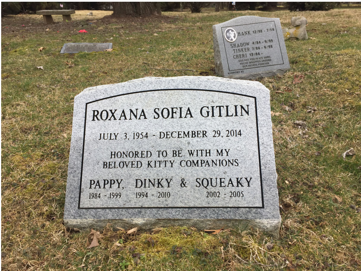
5. Possibly the most recent human burial, facing west.