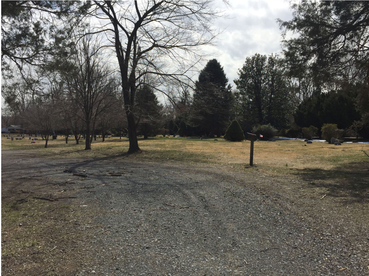
2. Inside entrance sign, facing south.