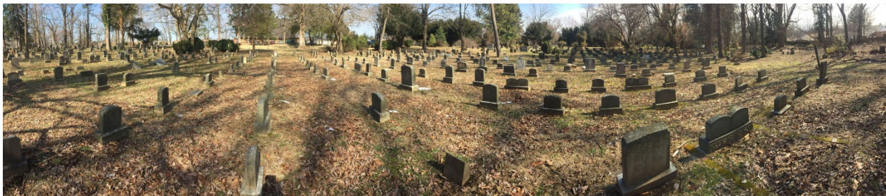
3. Panoramic from west to north to east.