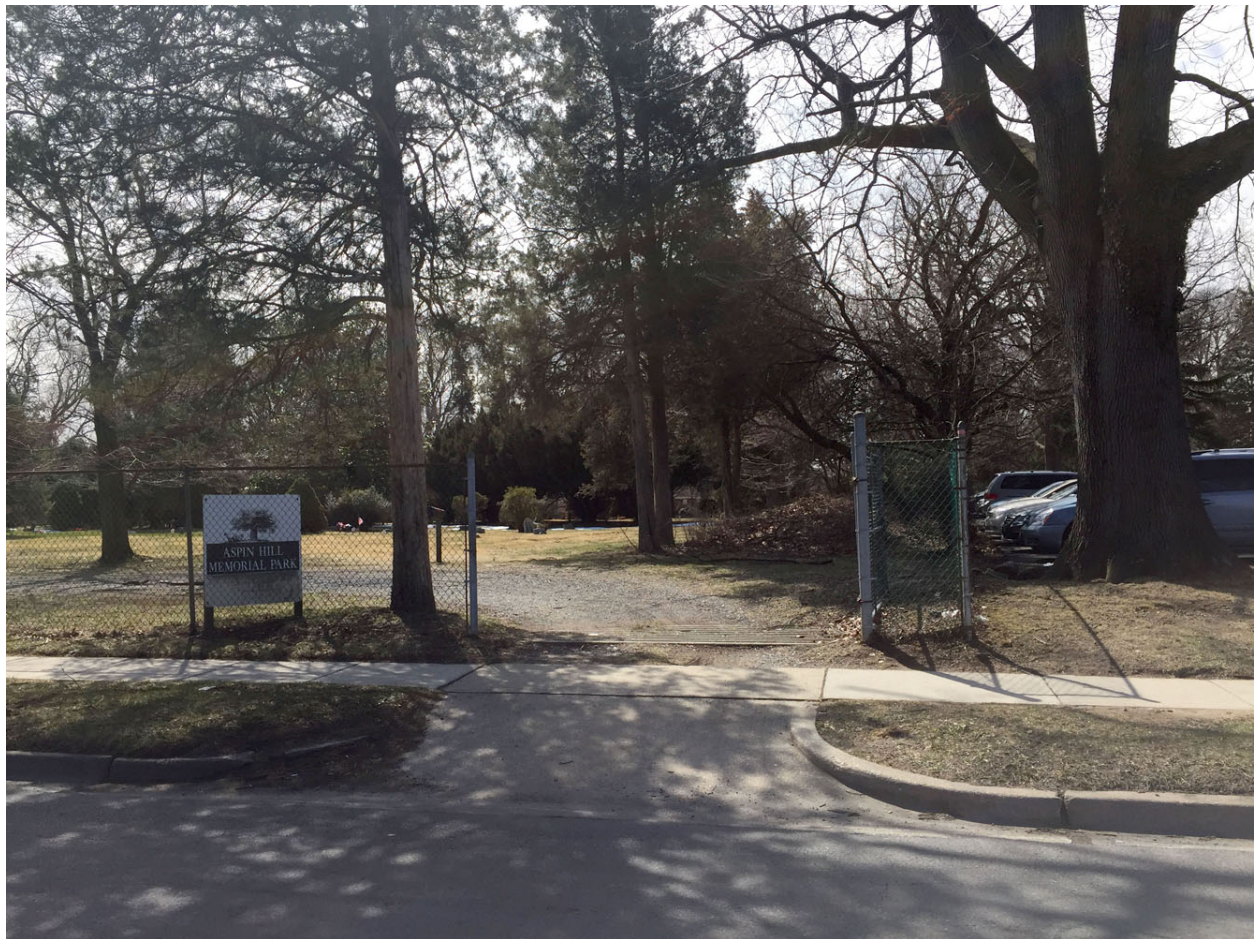
1. Entrance from across street, facing south.