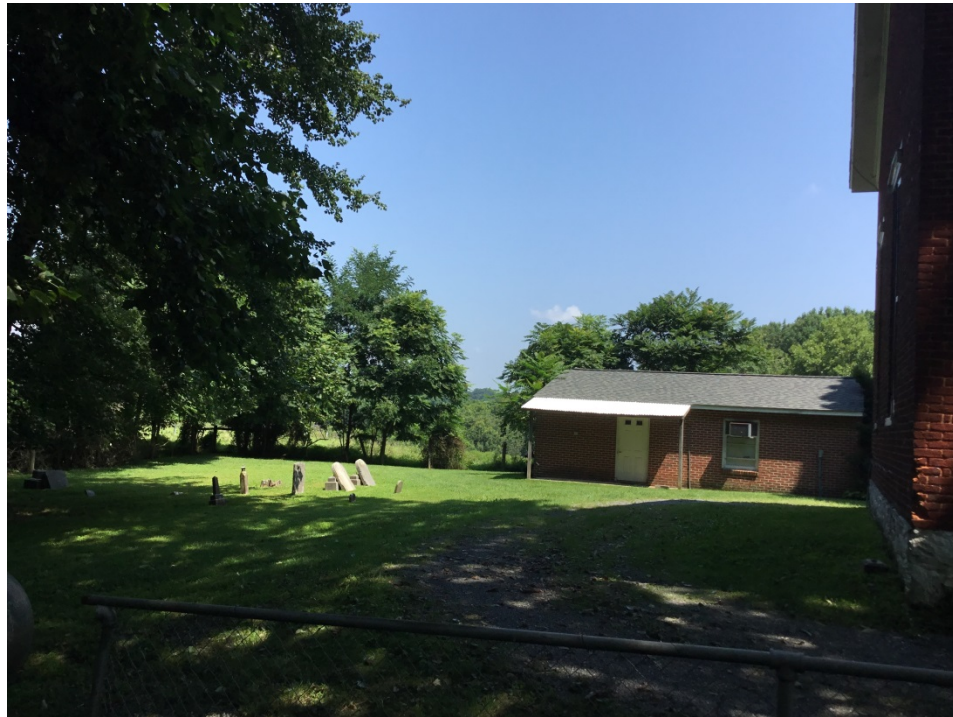
4. Cemetery extension behind church, facing north