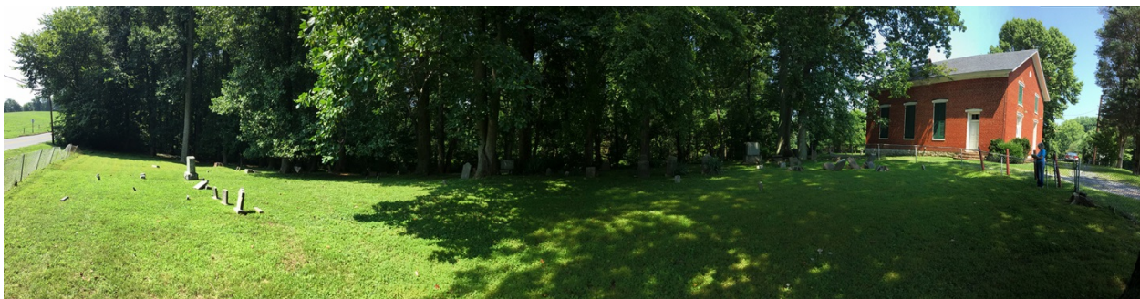
3. Panoramic from south to west to north