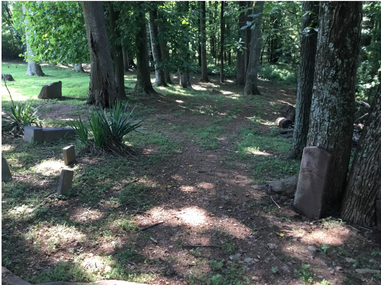
6. Reclaimed burial area from overgrowth encroachment