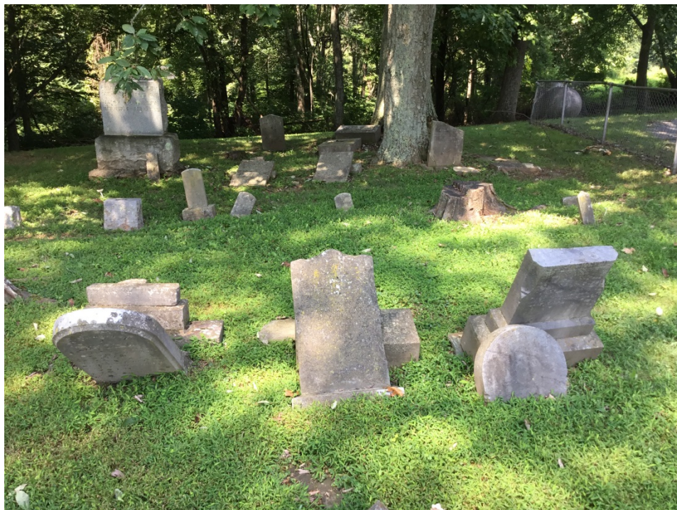
5. Typical condition of grave markers throughout the cemetery