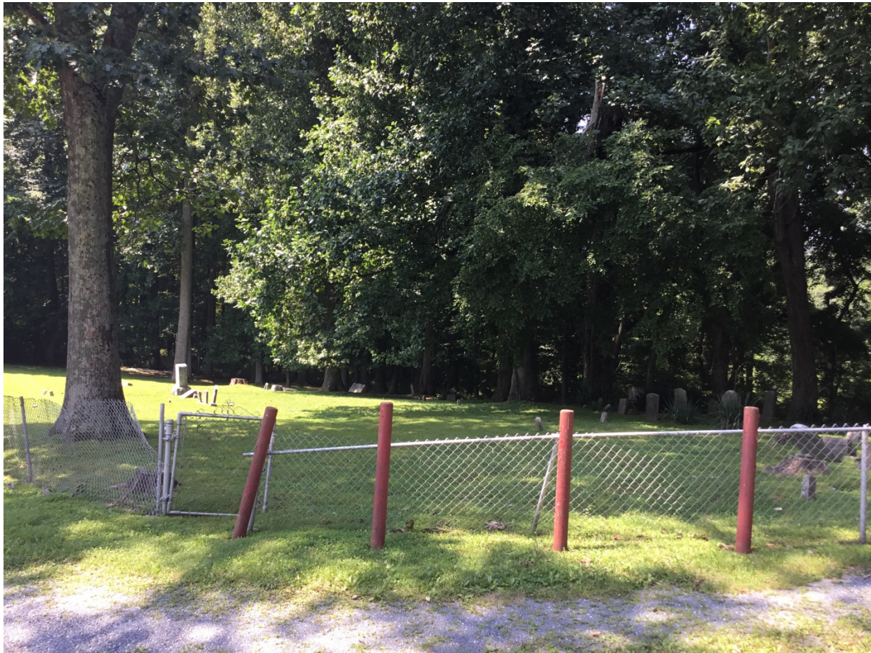
2. Approach to cemetery through gated fence, facing southeast