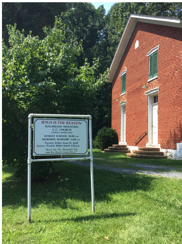
1. Church sign on Old Hundred Road, facing southeast