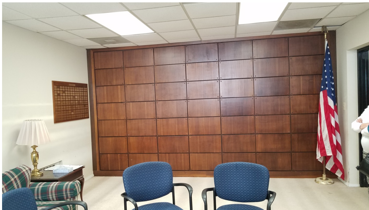
4. Columbarium wall with wooden panels