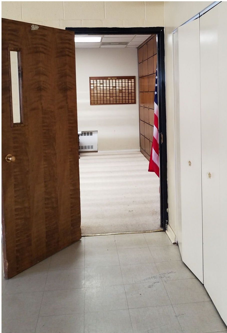
2. Entrance to St. Francis Room with columbarium