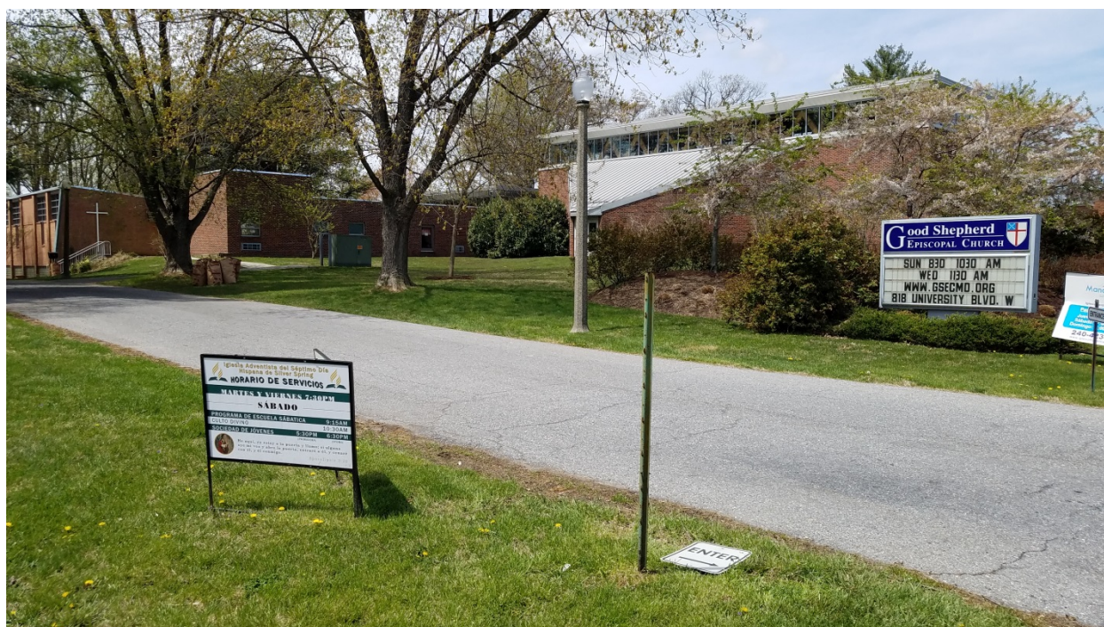
1. Entrance to Good Shepherd from University Blvd, facing west