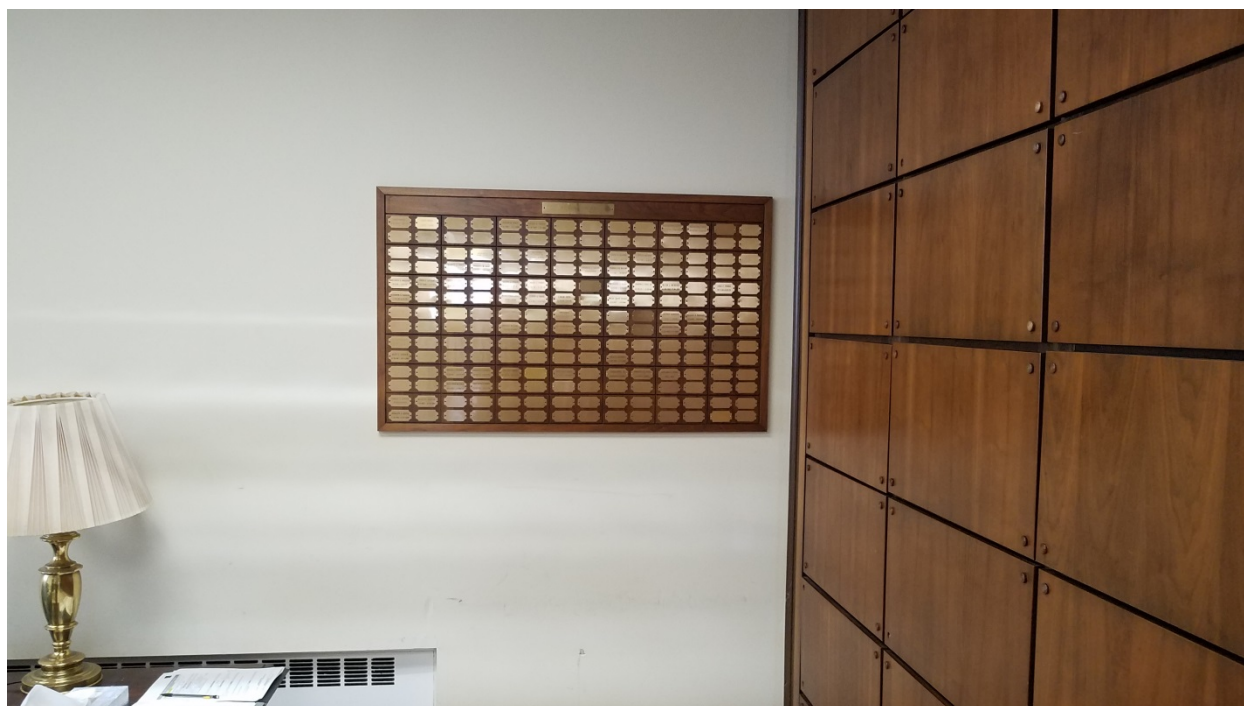
3. Wall plaque with names associated with niches at right