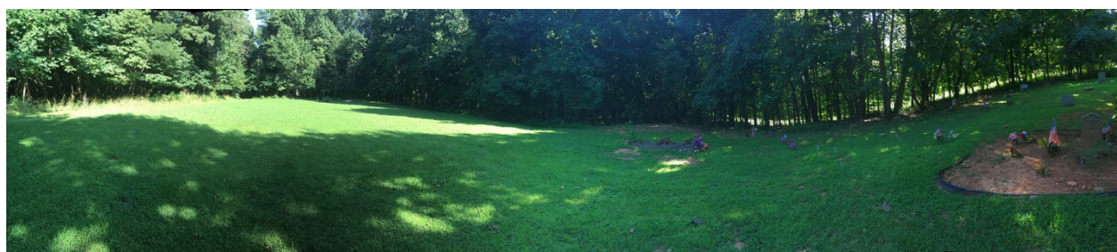
4. Panoramic from east to south to west