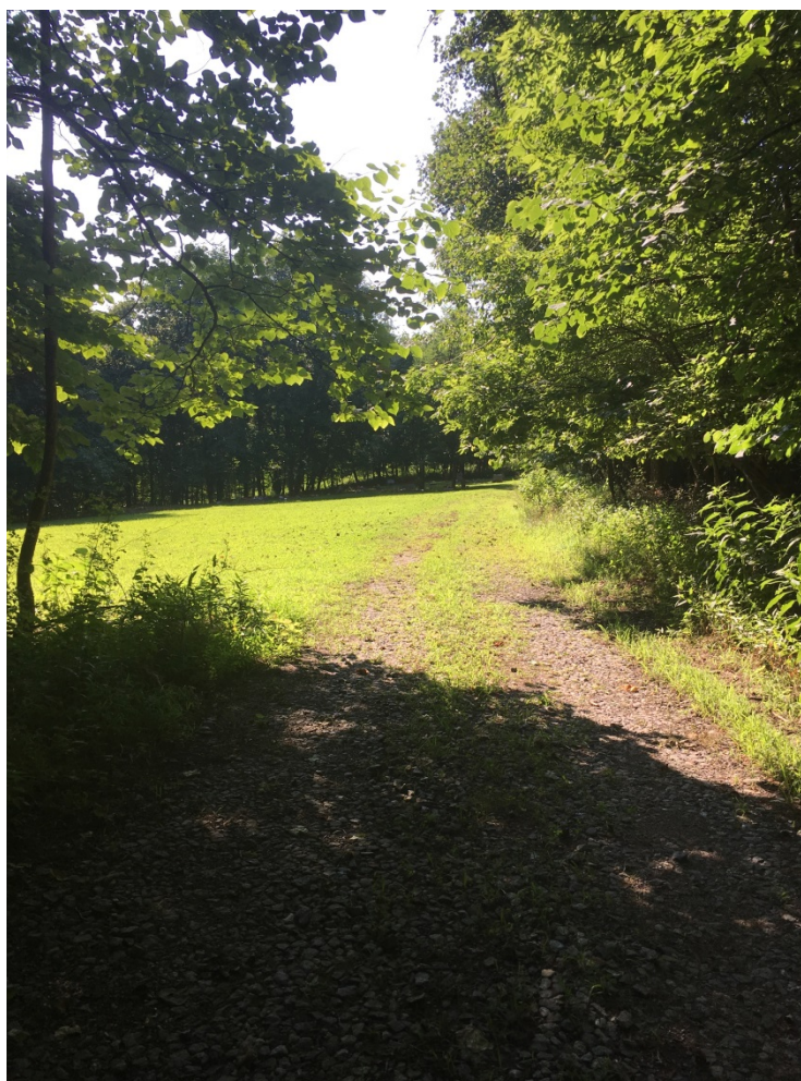
1. Approach to cemetery up dirt pathway