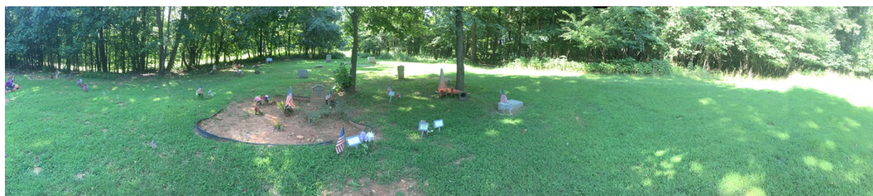
3. Panoramic from west to north to east