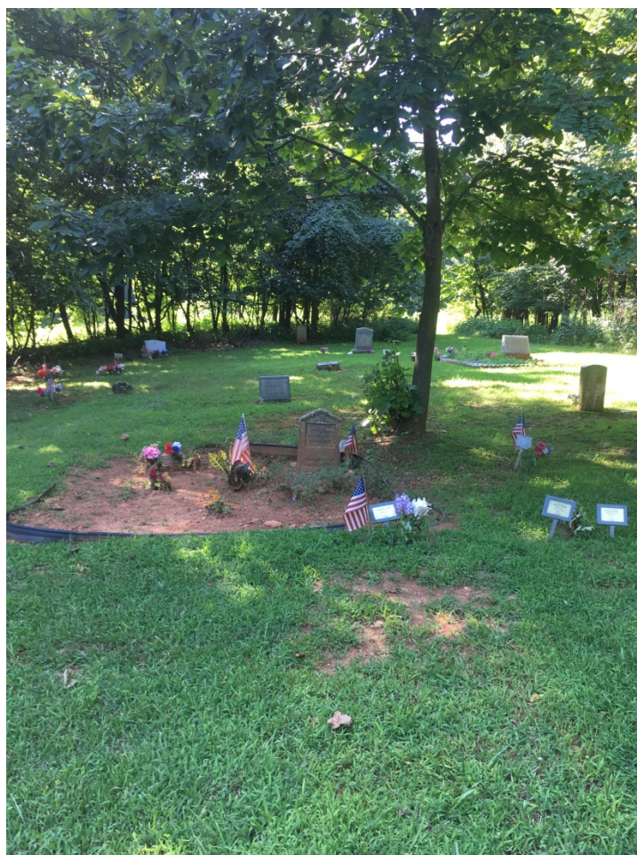
2. Center of cemetery