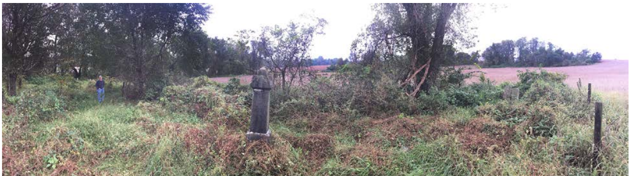
5. Panoramic from east to south to west