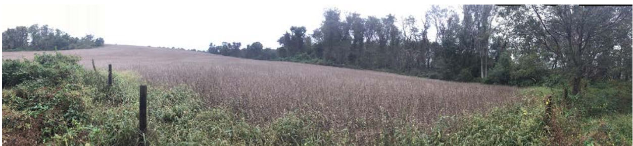
6. Panoramic from west to north to east