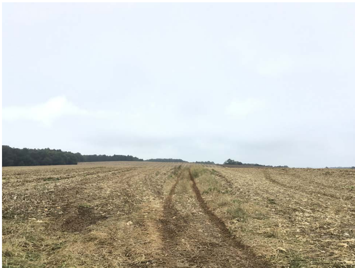
1. Beginning point of \frac{3}{4} -mile walk through corn field, facing northeast