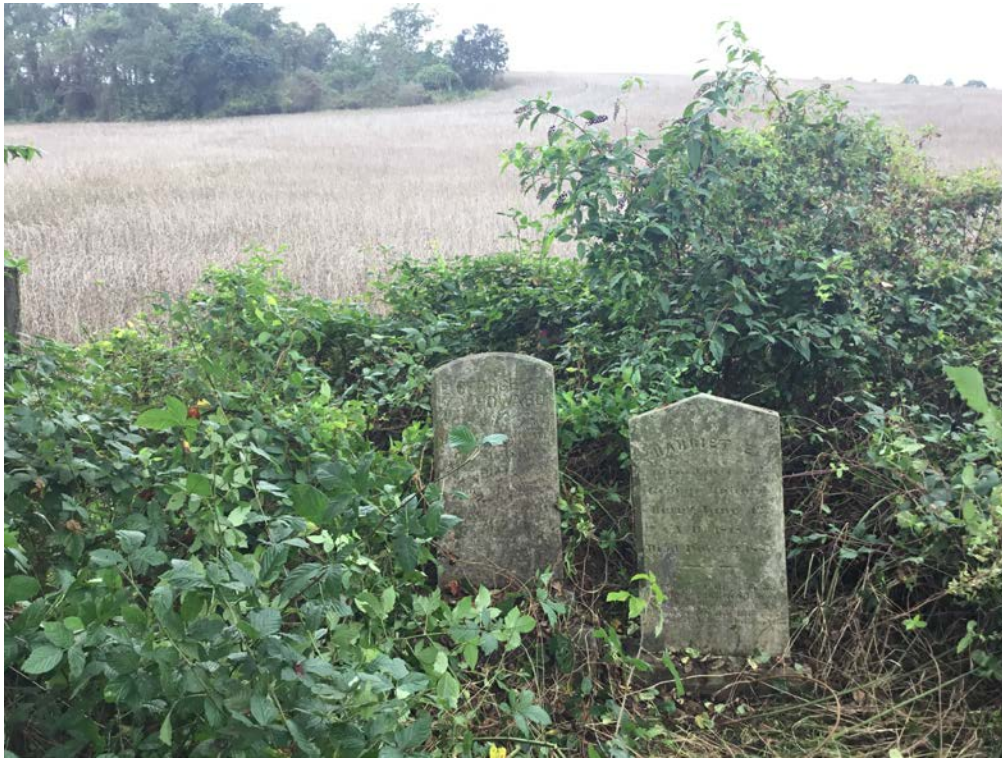
7. 2 grave markers hidden in overgrowth, facing west