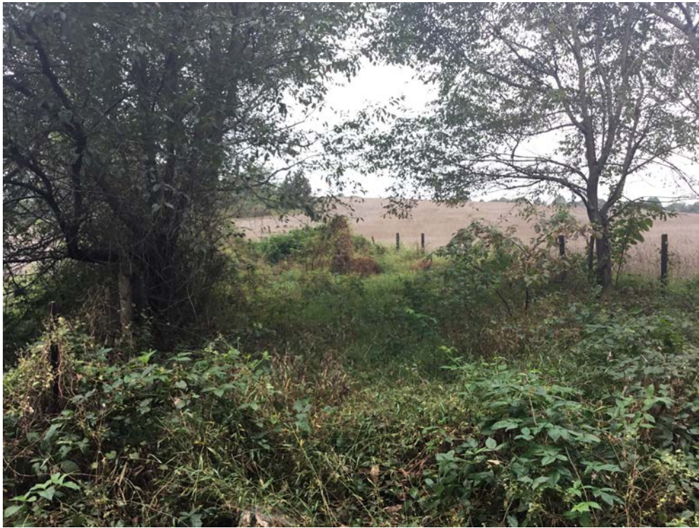
4. Entrance to cemetery, facing west