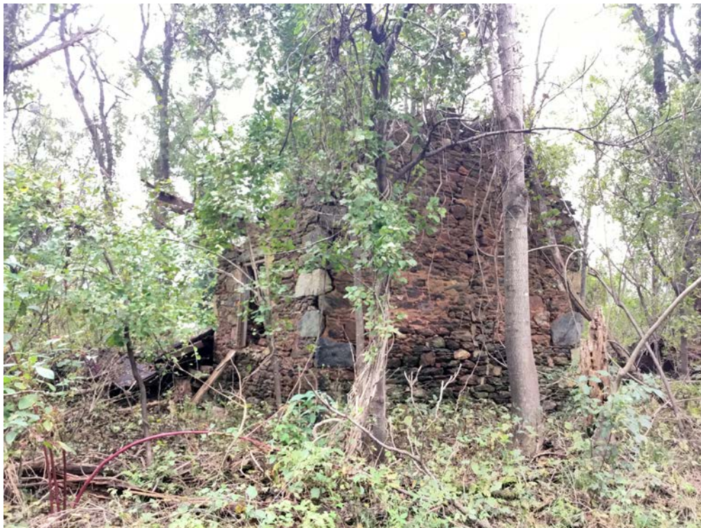
8. Panoramic from east to south to west