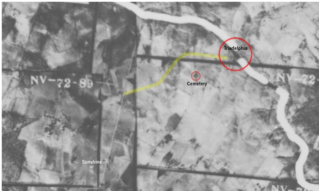
Location of Triadelphia in 1938, now under the reservoir.