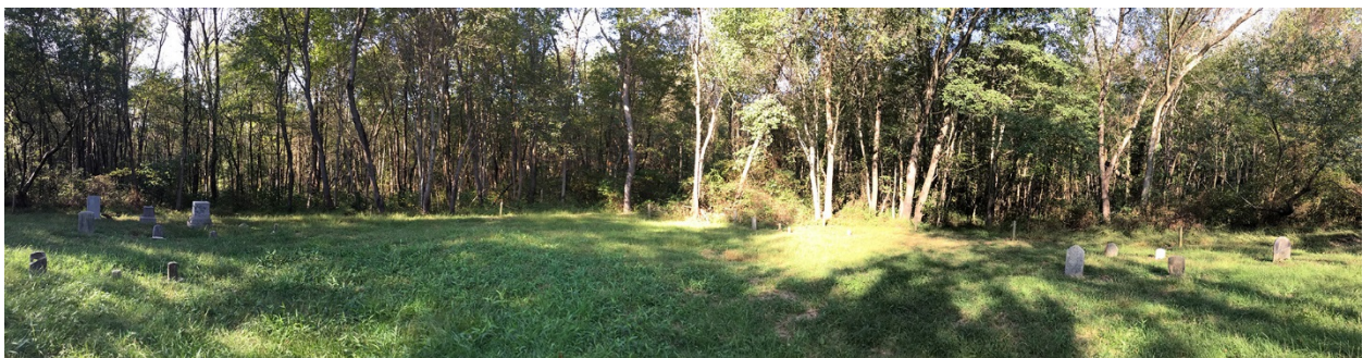
5. Panoramic from west to north to east