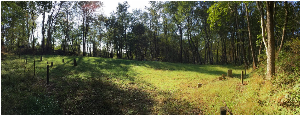
4. Panoramic from south to west to north at cemetery entrance