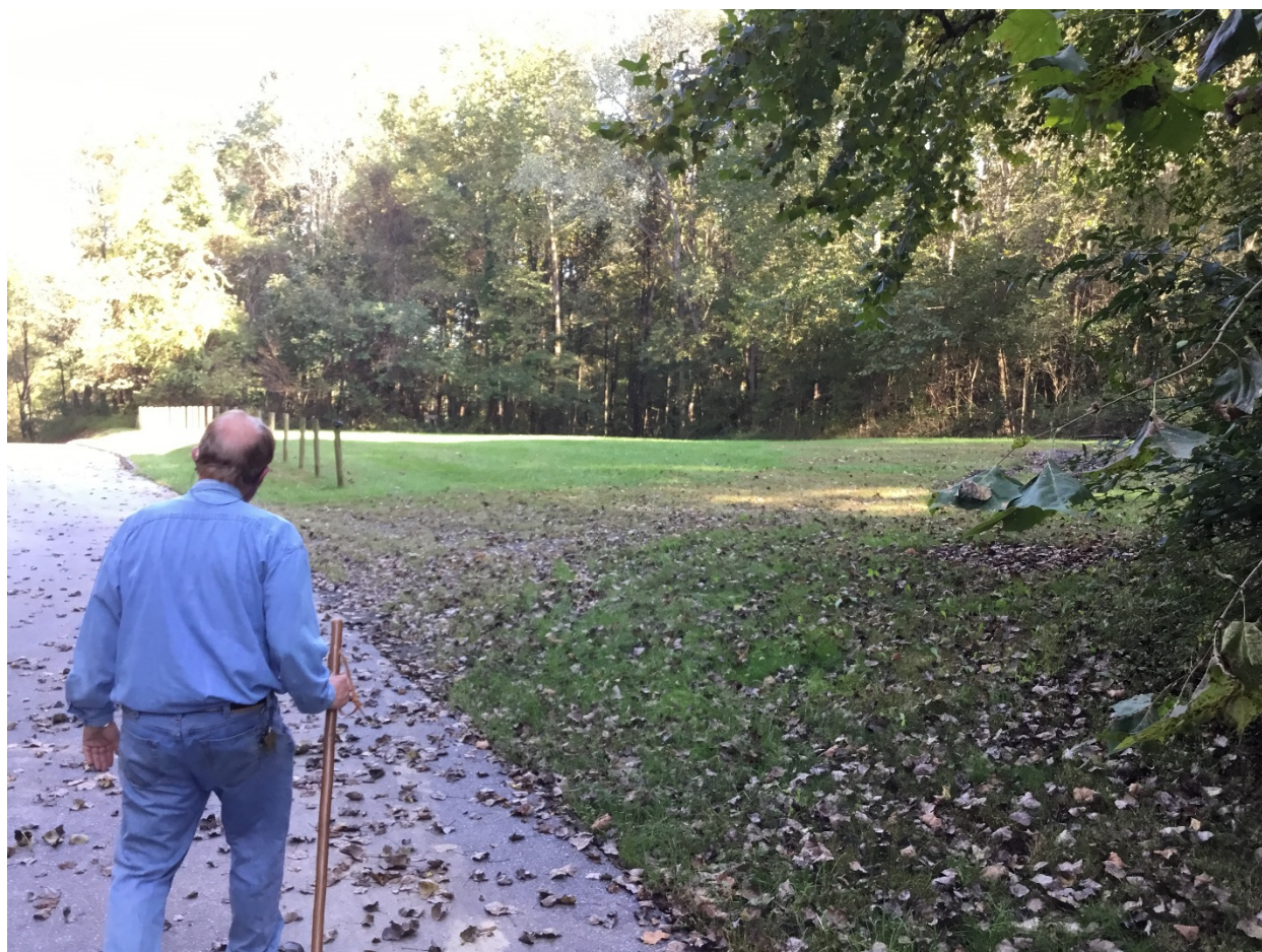
1. Entrance to Parking Lot 2 from Triadelphia Lake Road, facing east