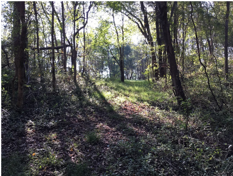
3. Initial view to cemetery from path, facing southwest