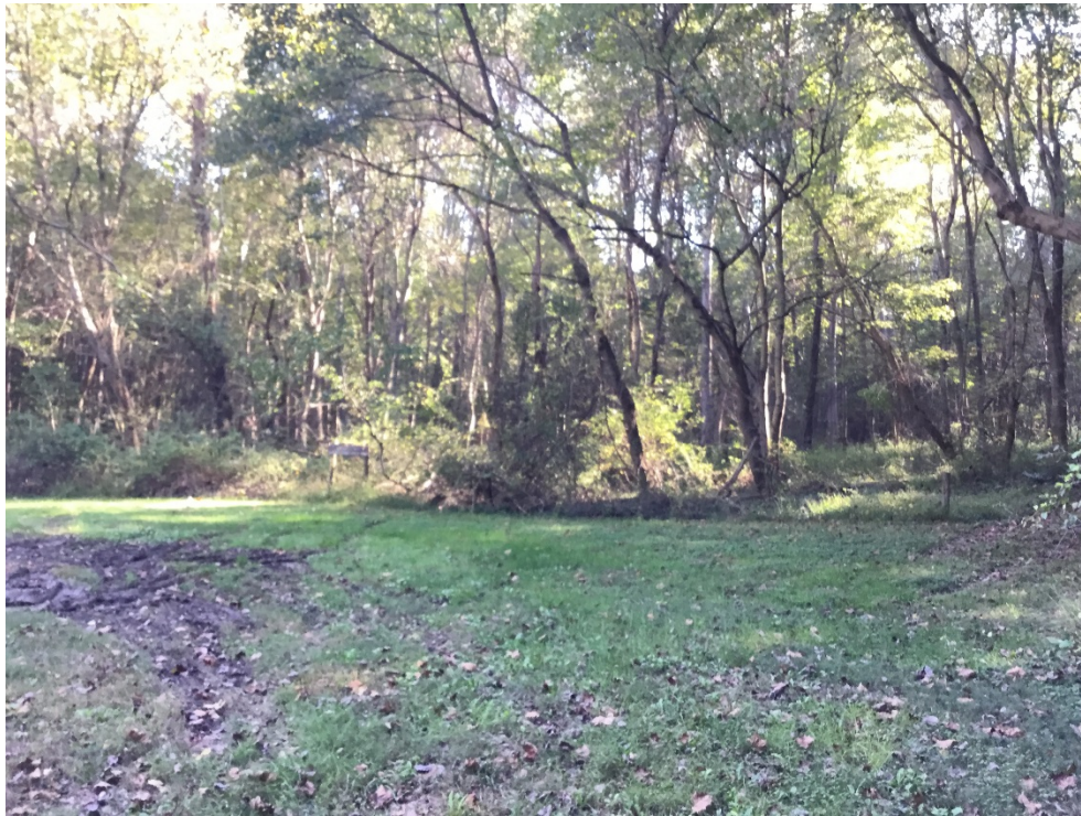
2. Entrance to path from Parking Lot 2 to the immediate right, facing south