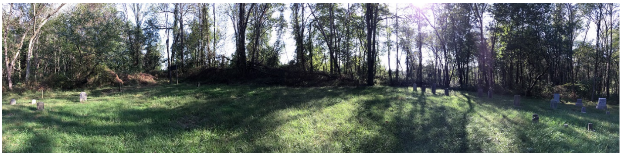
6. Panoramic from east to north to west