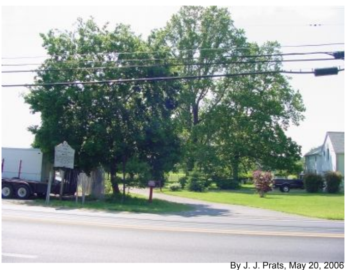
2. Elton Marker

measured as the crow flies. The Rachel Carson Greenway (approx. 1.4 miles away); Mills in the Upcounty (approx. 1.4