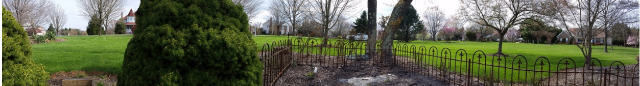
7. Panoramic from east to south to west