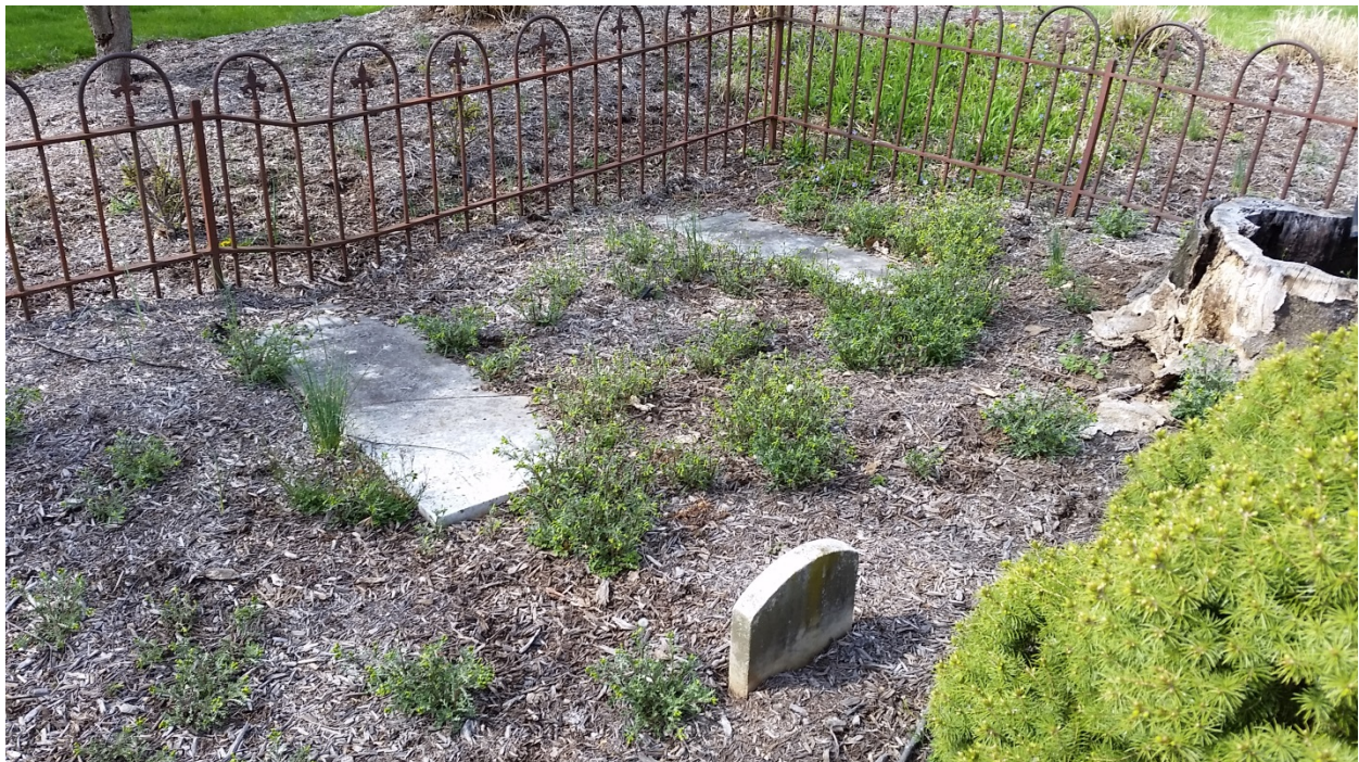
4. Two grave sites to the east entrance