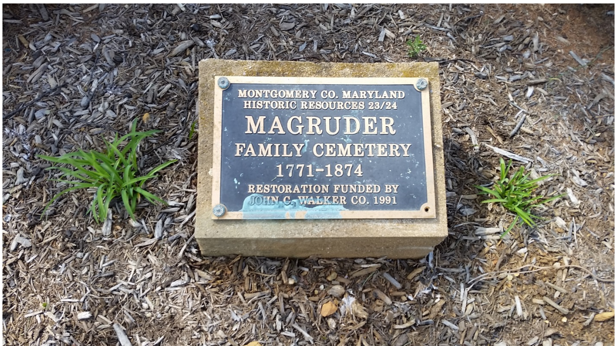
3. Cemetery sign in front of entrance