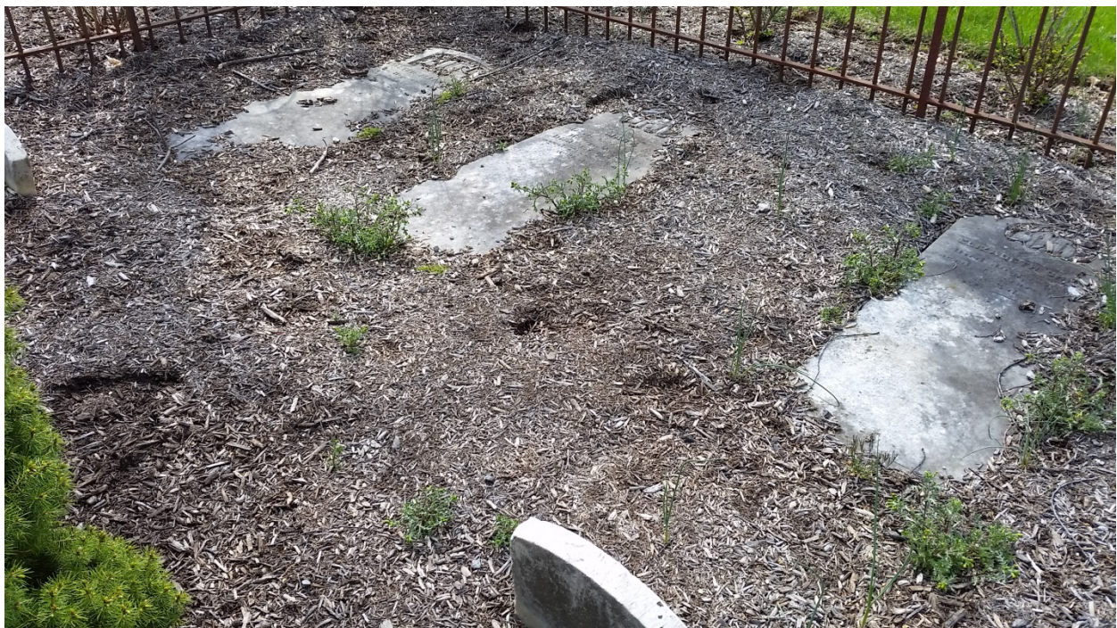
5. Two grave sites to the west of entrance