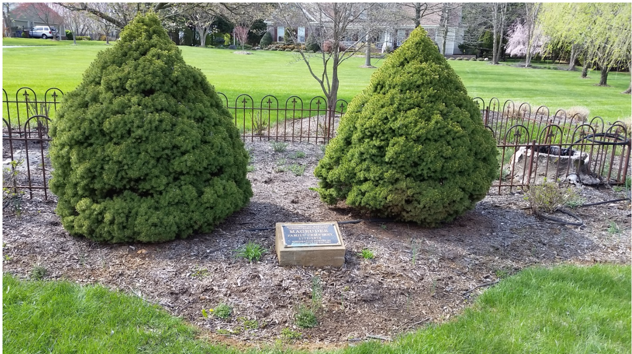
2. Entrance into family cemetery, facing northwest