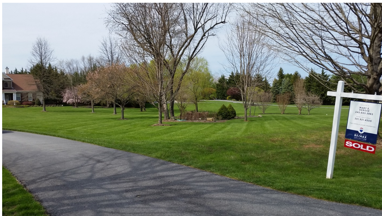
1. Approach to cemetery along driveway of residence, facing northeast