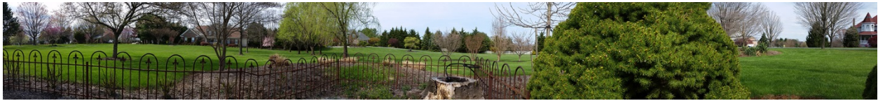
6. Panoramic from west to north to east