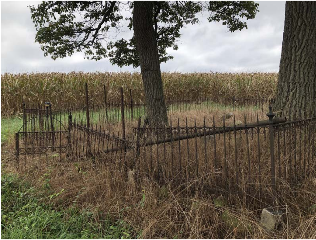
3. Broken iron fencing surrounding cemetery