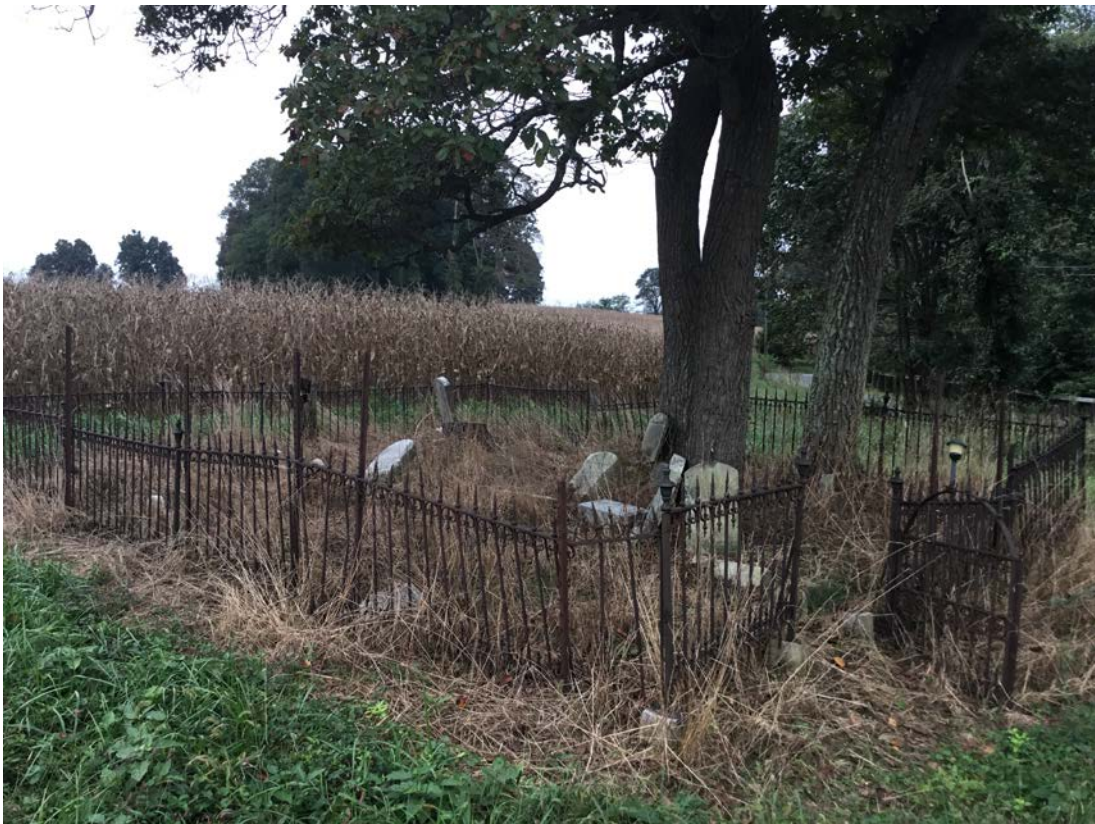
4. Cemetery viewed from cornfield, facing northwest