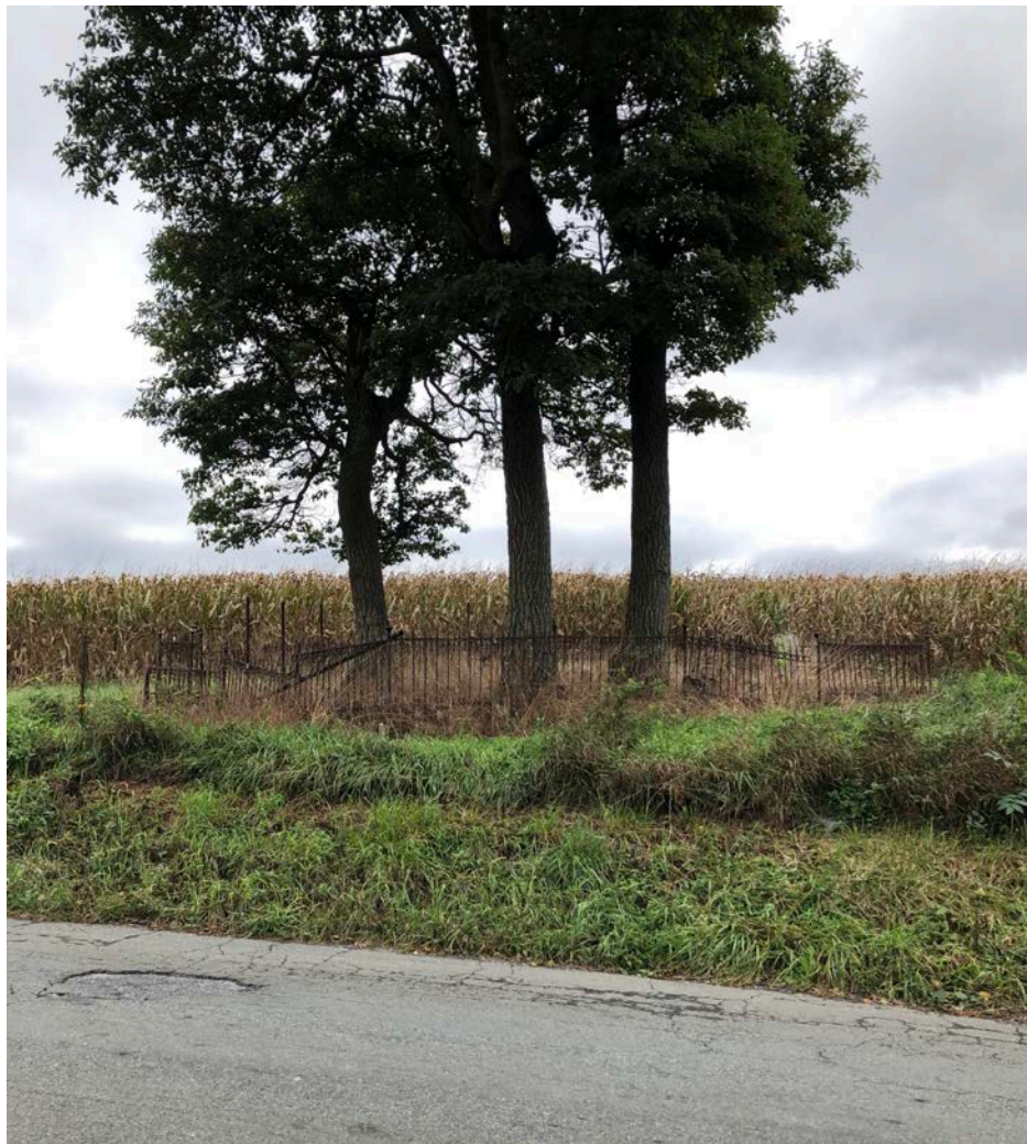
1. View toward cemetery from Gregg Road, facing south