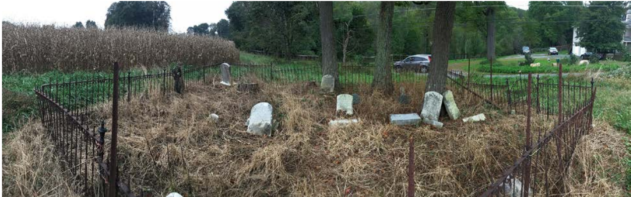
5. Panoramic from west to north to east