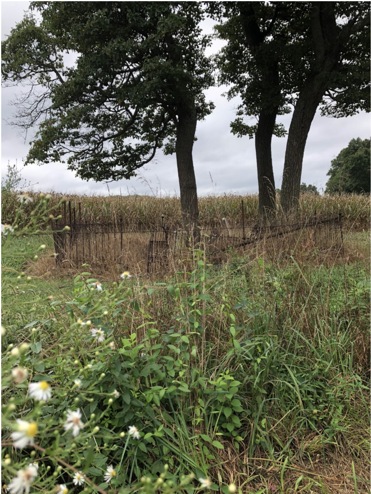
2. Approach to cemetery, facing west