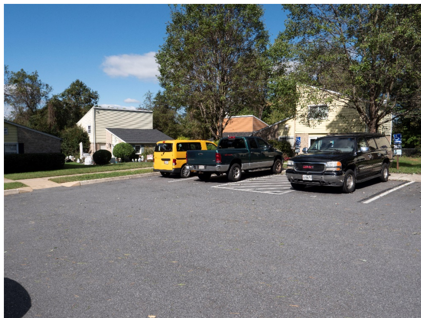
1. From parking lot towards path to cemetery facing northwest