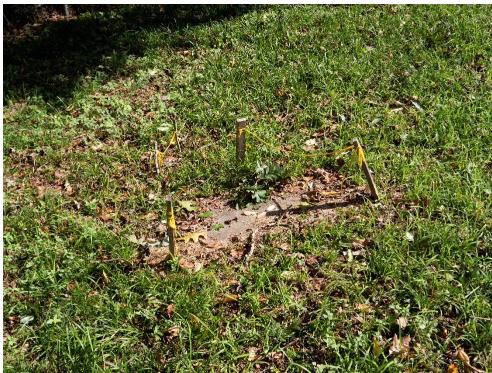
14. Marker detail facing north