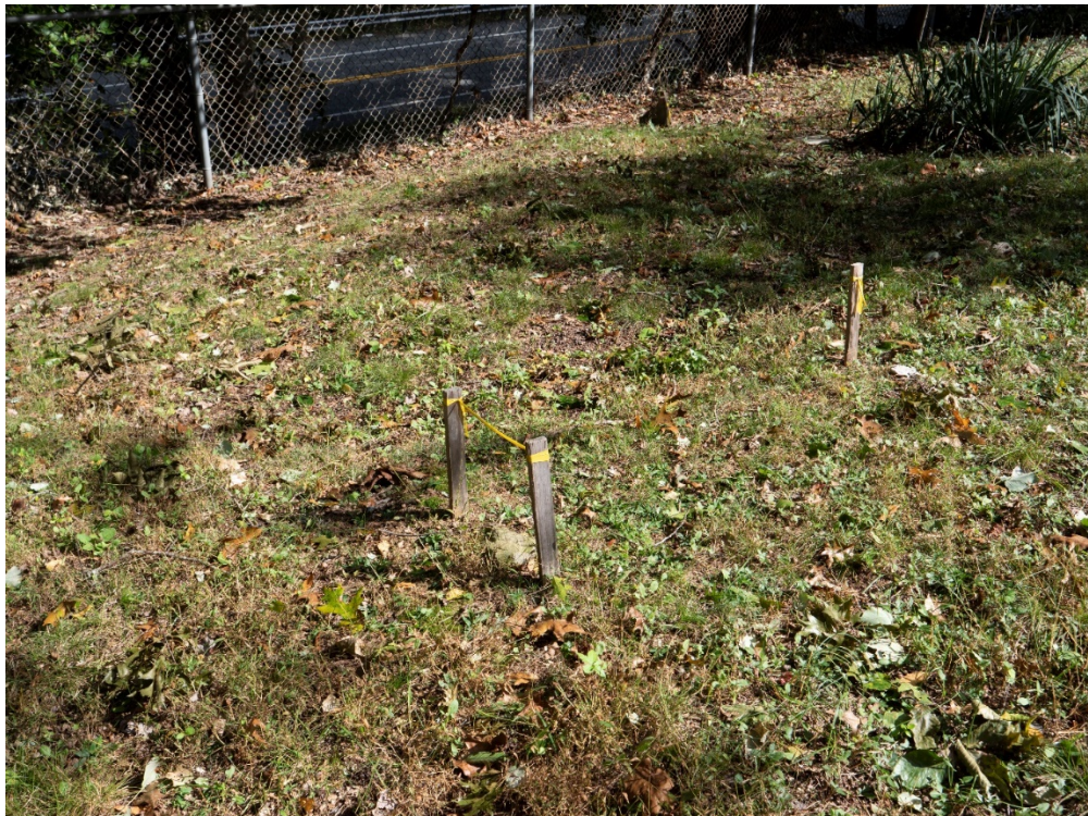
8. Marker detail facing north