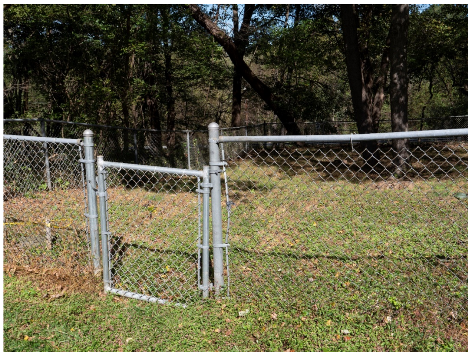
3. Entrance gate facing north into cemetery