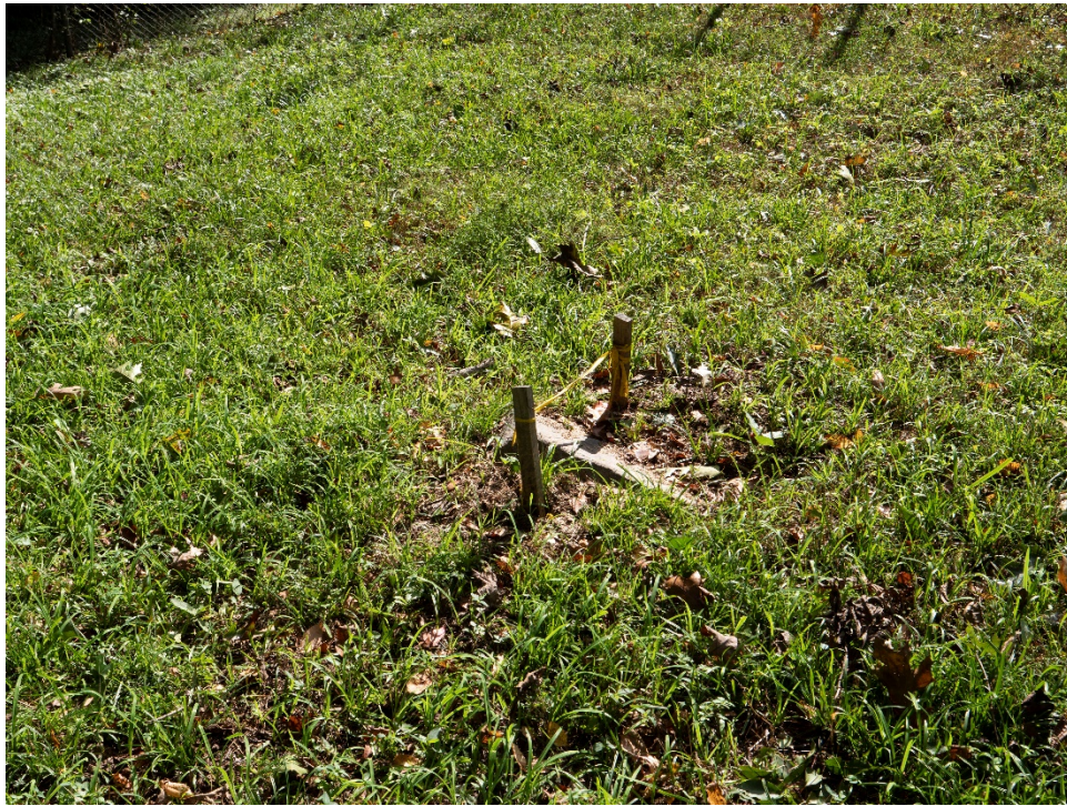
15. Marker detail facing north