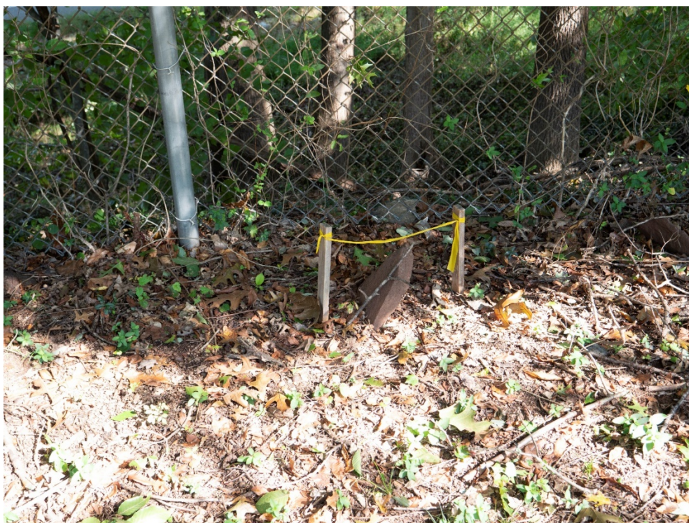
11. Marker detail facing north