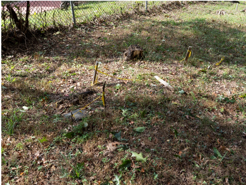
17. Marker detail facing west