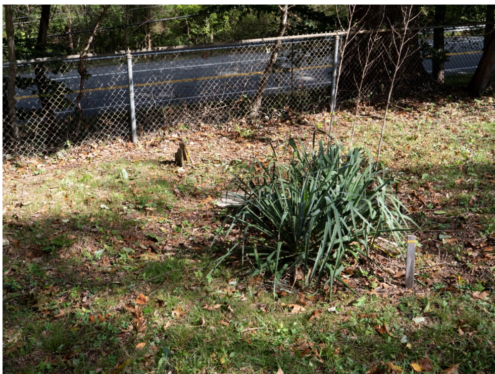
9. Yucca facing north