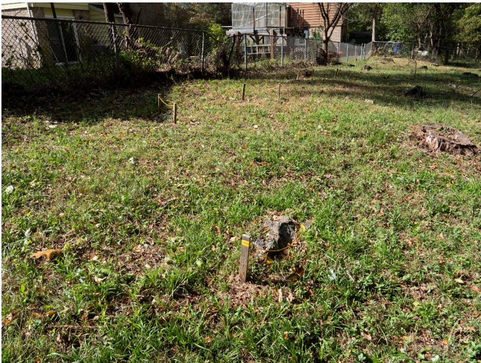
16. Marker detail facing west