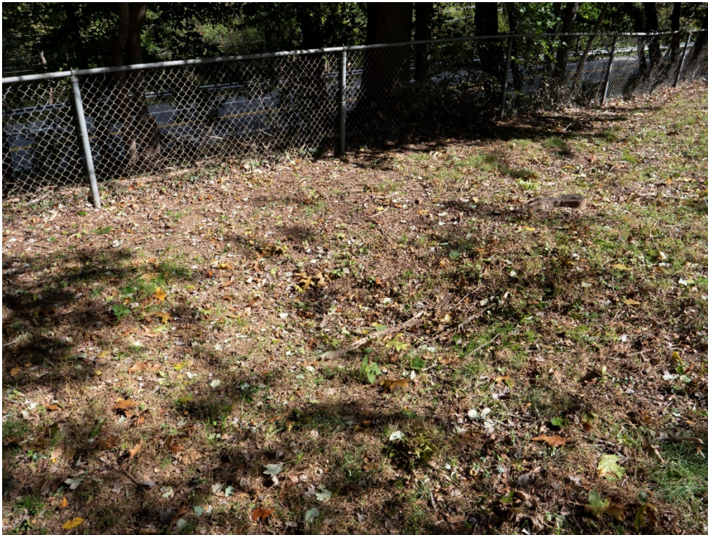
7. Depressions facing north