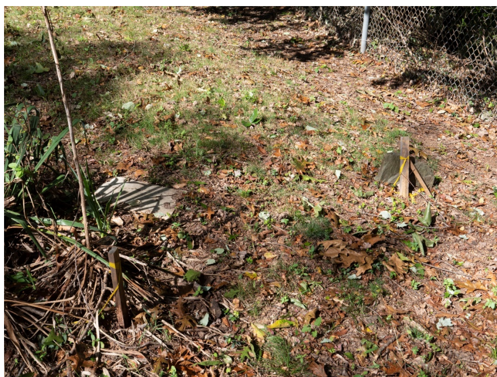
10. Marker detail facing northwest