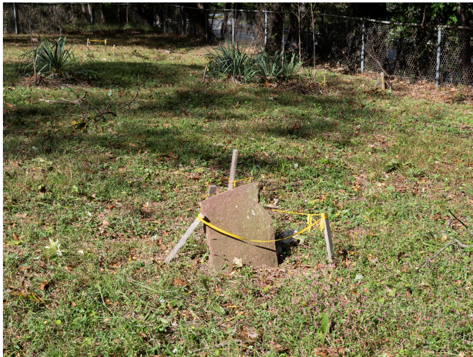
13. Marker detail facing northwest