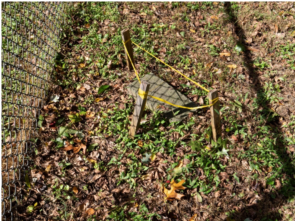
6. Marker detail facing west (detail images taken from vicinity of gate, progressing clockwise through the cemetery)