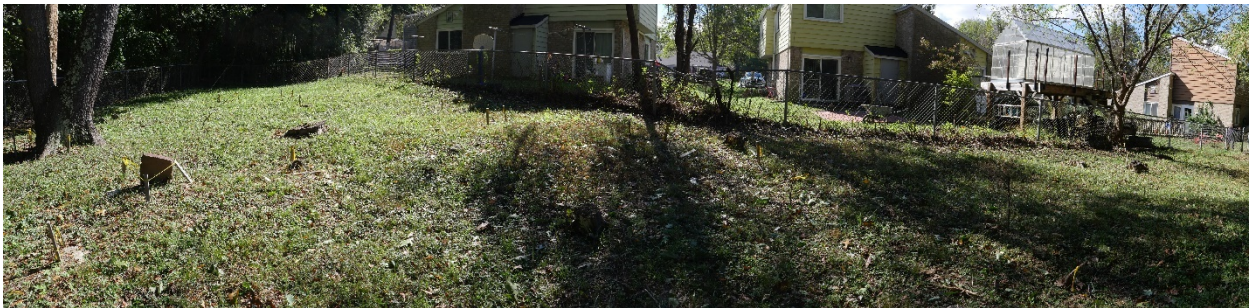
5. Panoramic from east to south to west