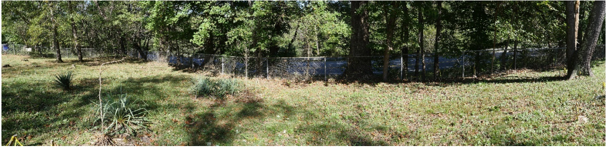
4. Panoramic from west to north to east