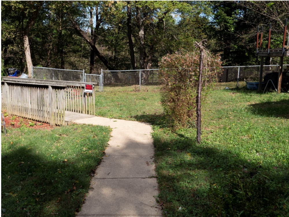
2. Path towards cemetery gate facing north