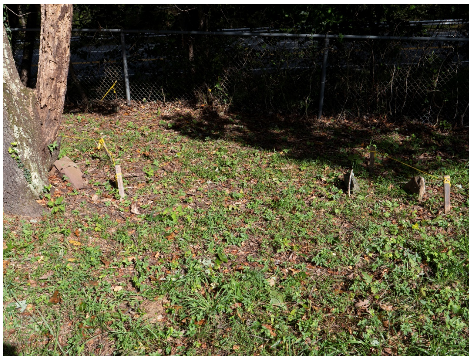
12. Marker detail facing north