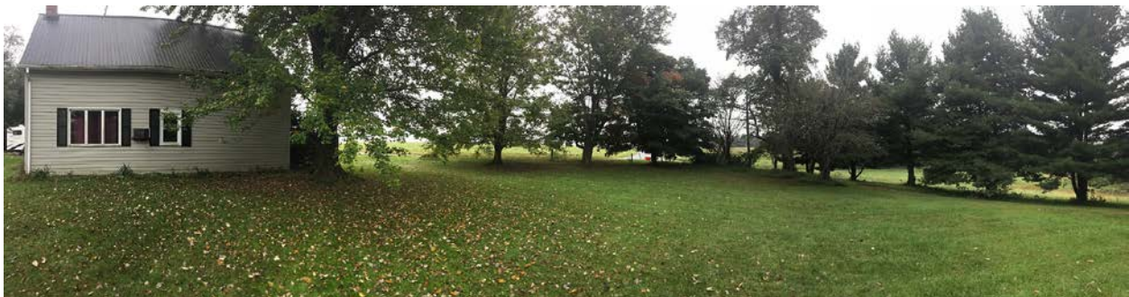
4. Panoramic from east to south to west