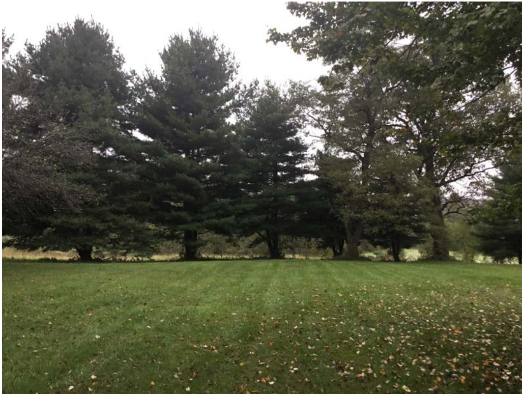
2. Former cemetery surrounded by pine trees, facing north