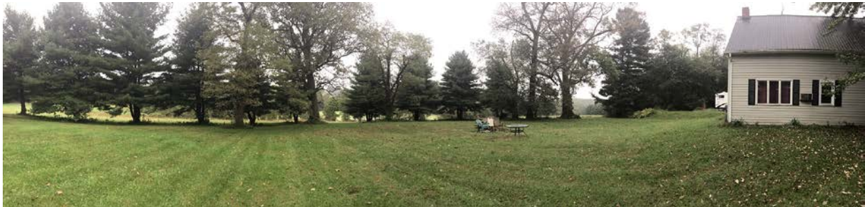
3. Panoramic from west to north to east