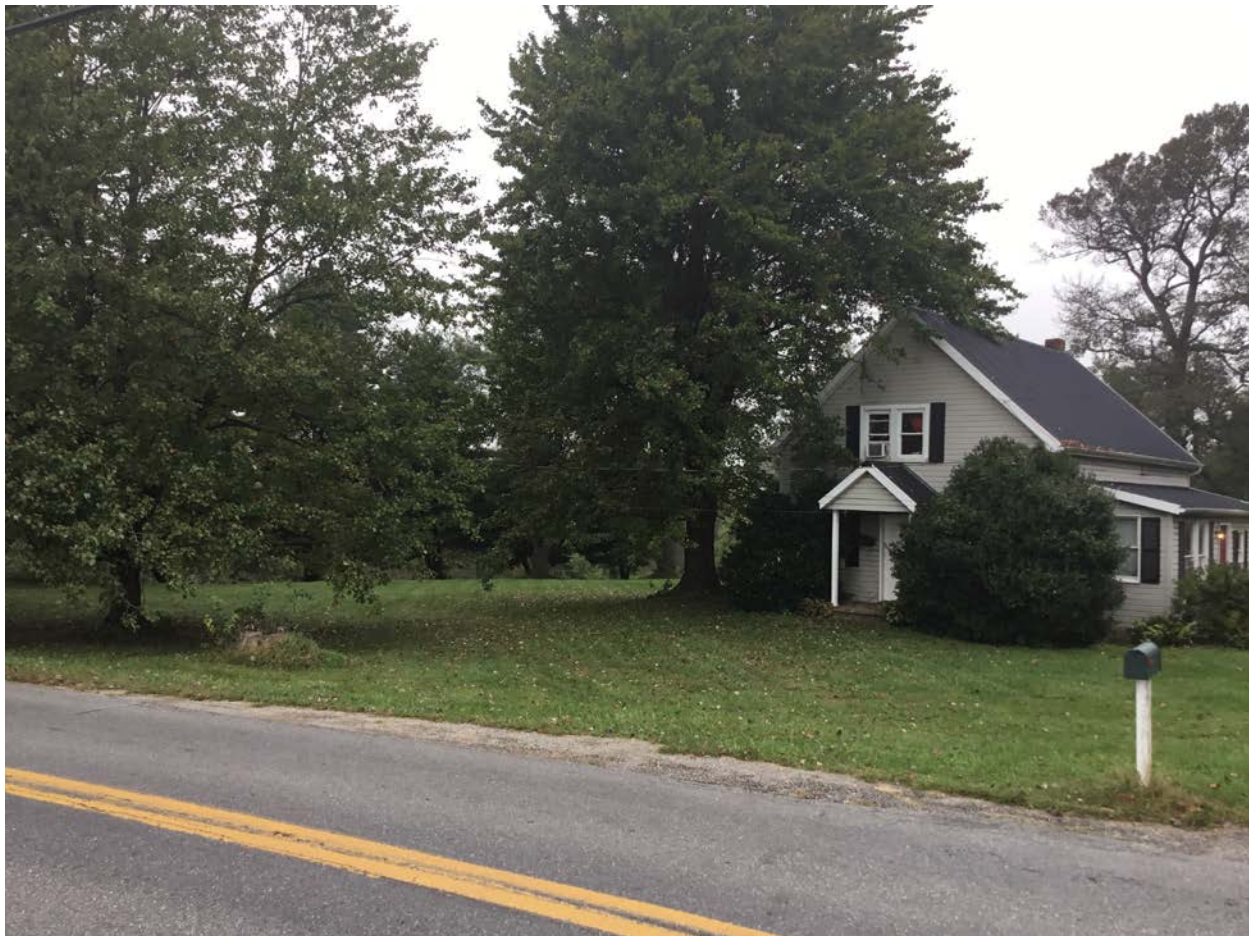
1. Approach to cemetery through front yard, facing west