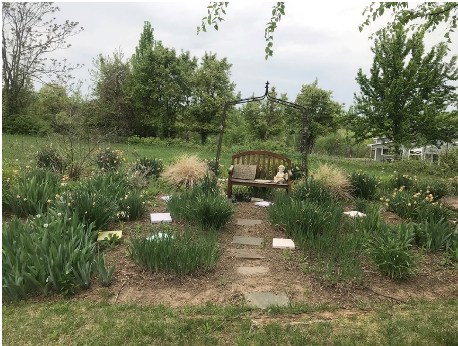
2. Memorial garden, facing north