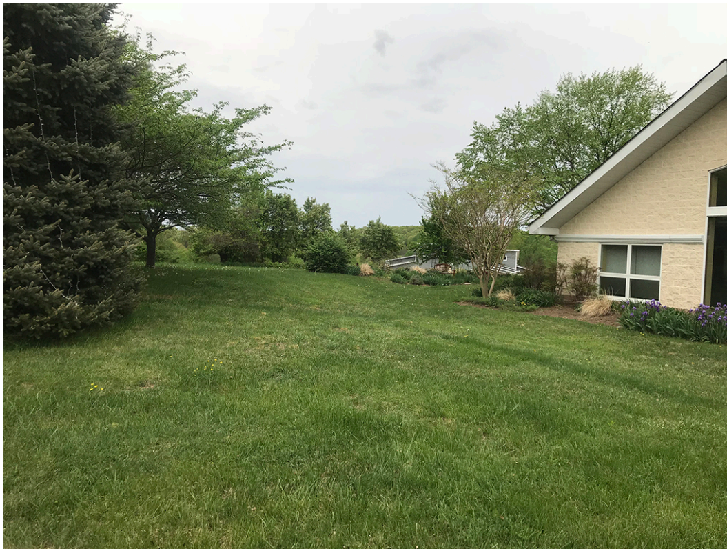
1. Approach from the parking lot, facing north-east