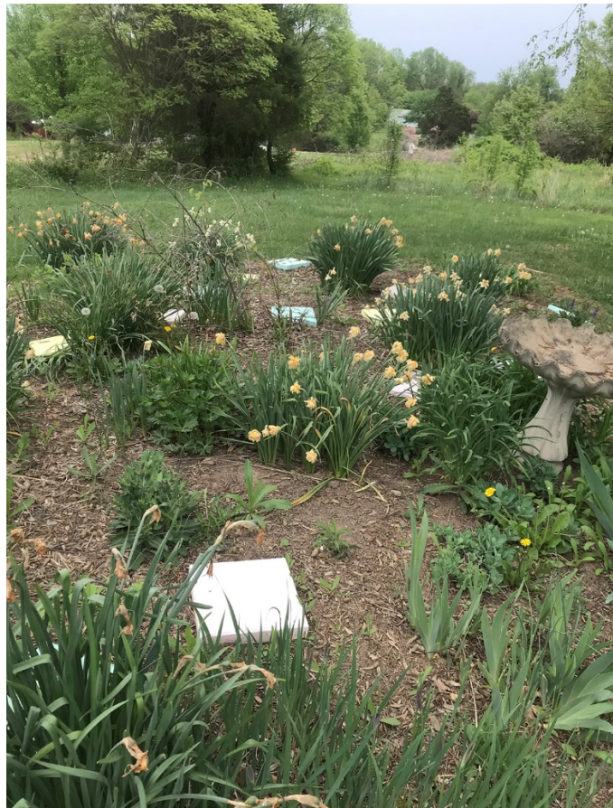
3. Memorial garden, facing west