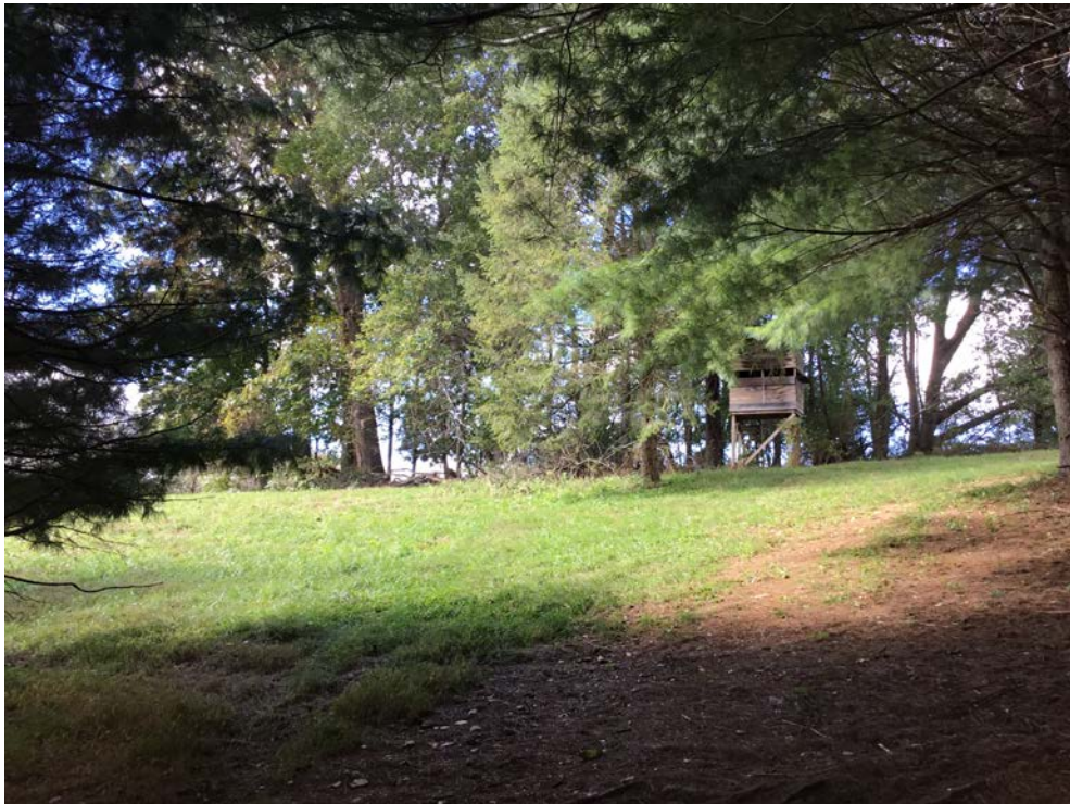
3. Initial view of cemetery in oak grove, facing west