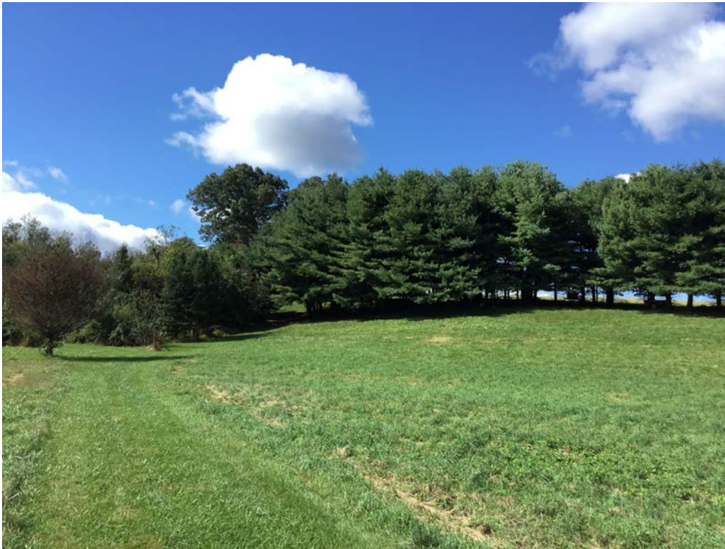
2. Continued approach toward oak trees behind the pines, facing west