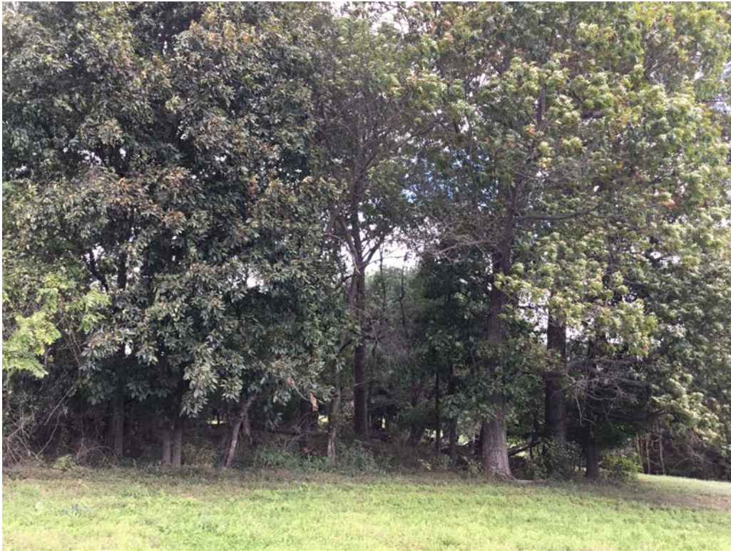
4. Alternate view of oak grove from the south, facing north