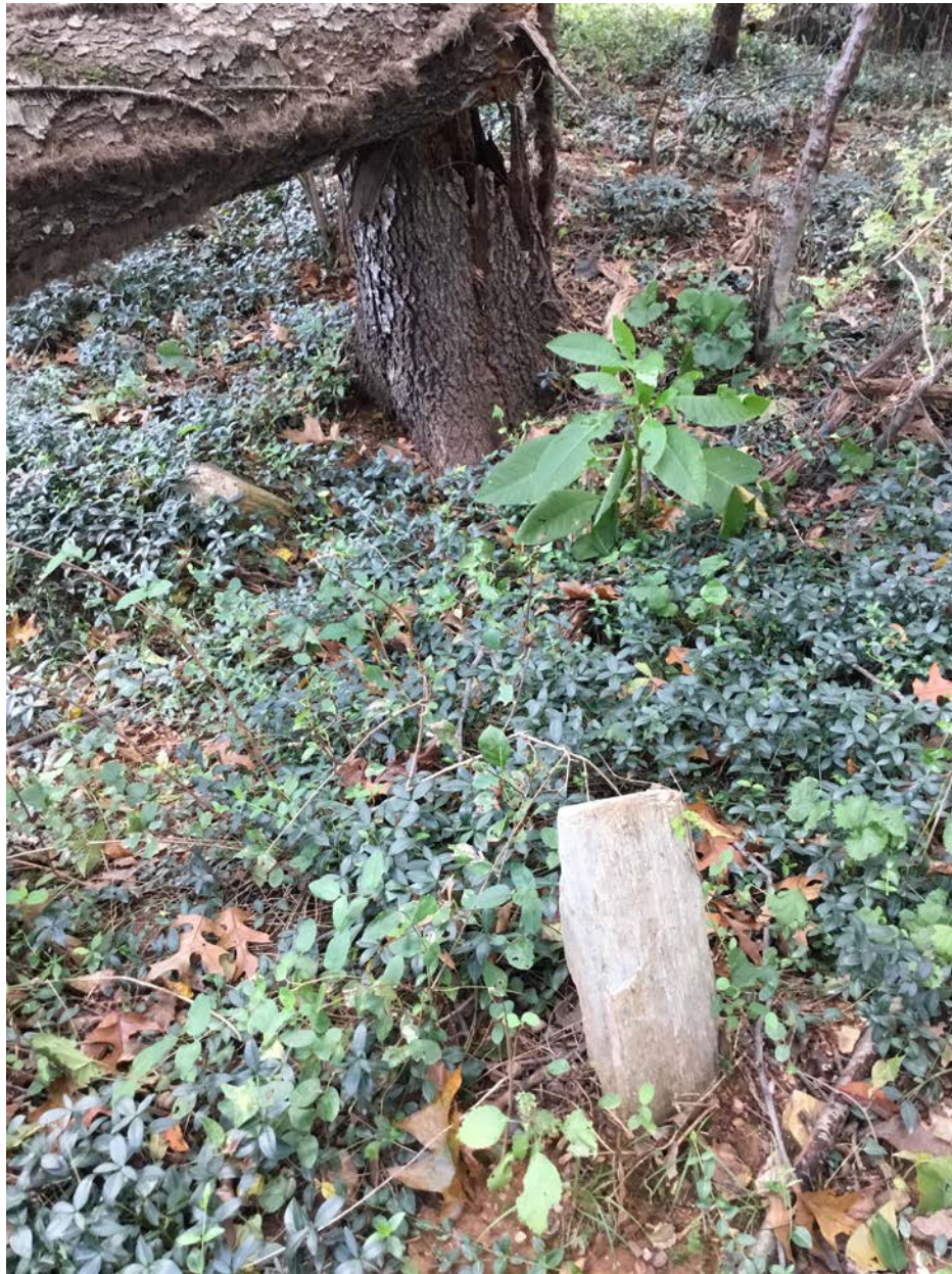
7. Fieldstone grave markers in a straight row, oriented east-west