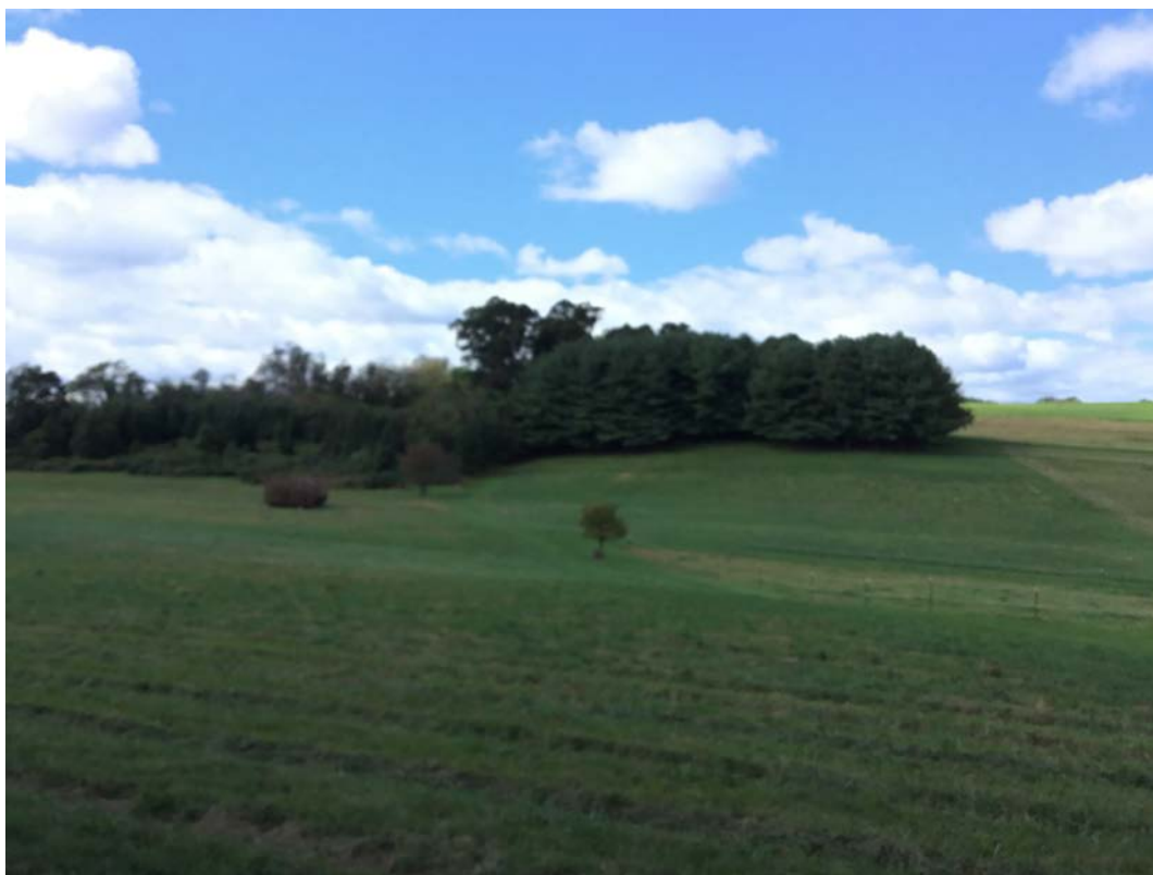
1. Approach from house at 26010 Long Corner Rd., facing west