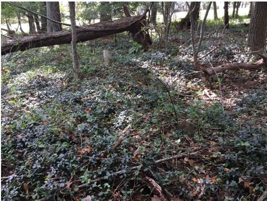
9. Ivy and periwinkle covering entire burial area