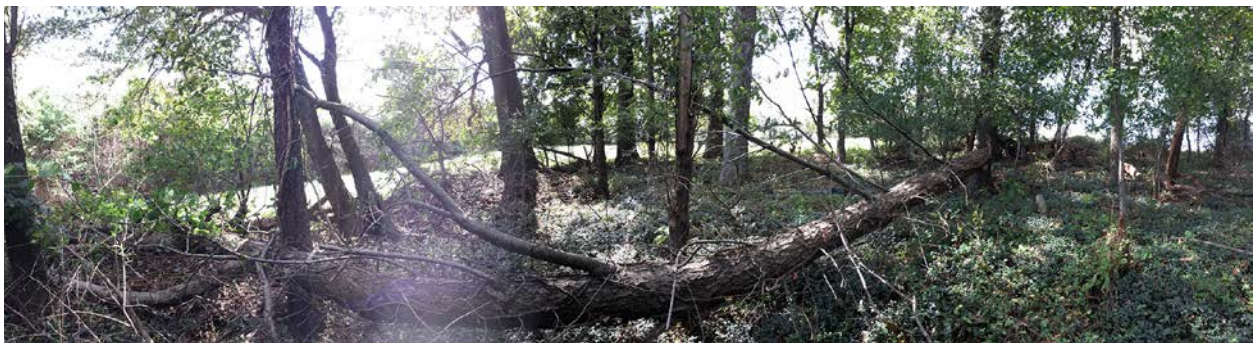
6. Panoramic from east to south to west