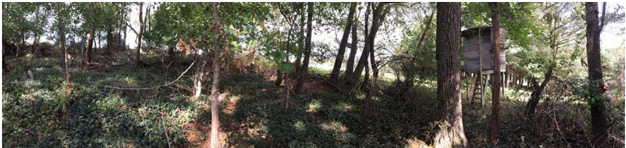
5. Panoramic from west to north to east