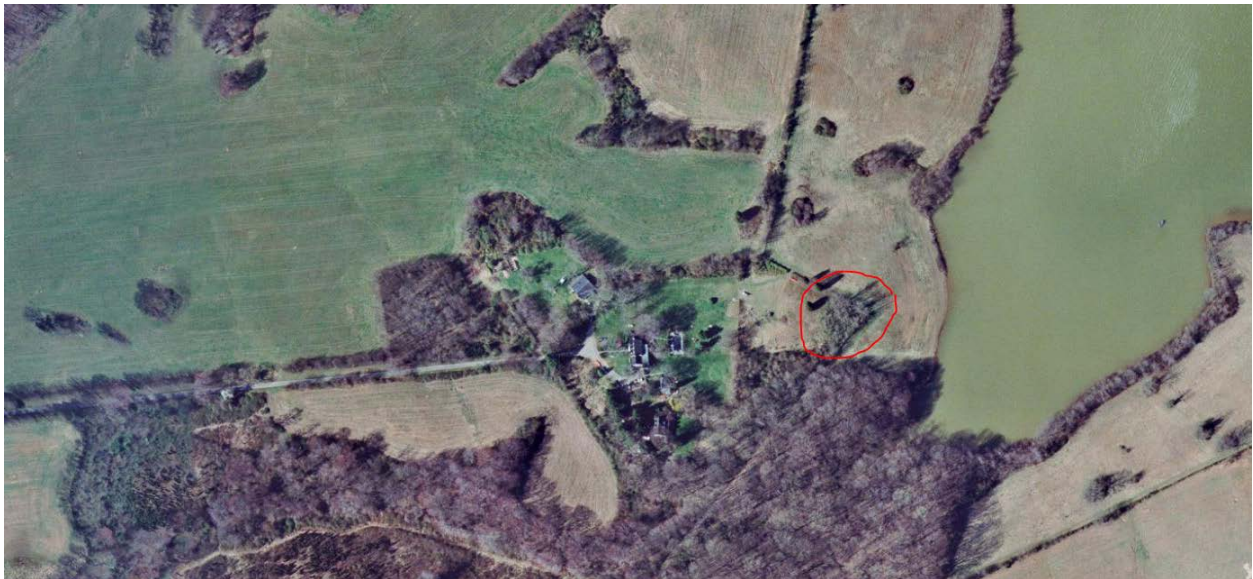
1998 aerial. Feature is starting to fill in with trees and brush.