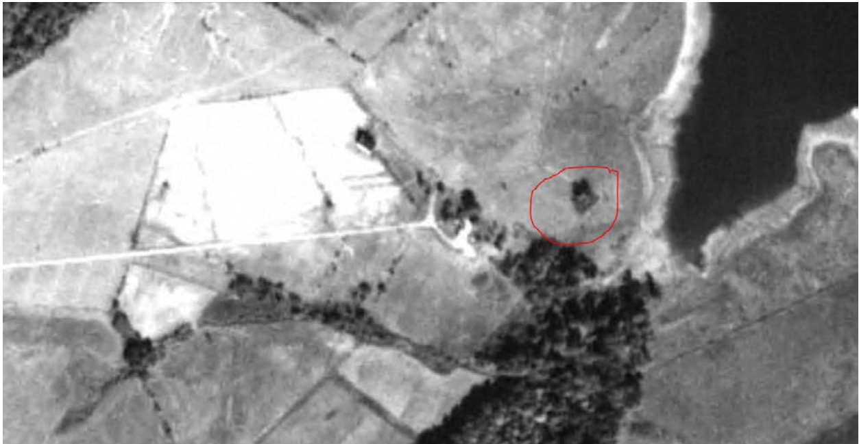
1950 aerial. Note the isolated land feature lined up with the driveway and house.