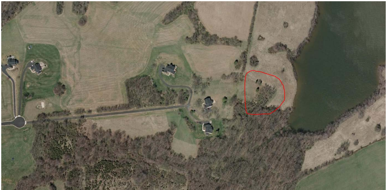
2004 aerial. New homes are now built. Land feature remains untouched.