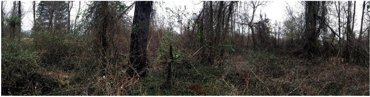
4. Panoramic at the "V" from outside property. West to north to east.