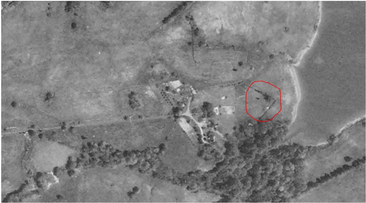
1979 aerial. Same feature.