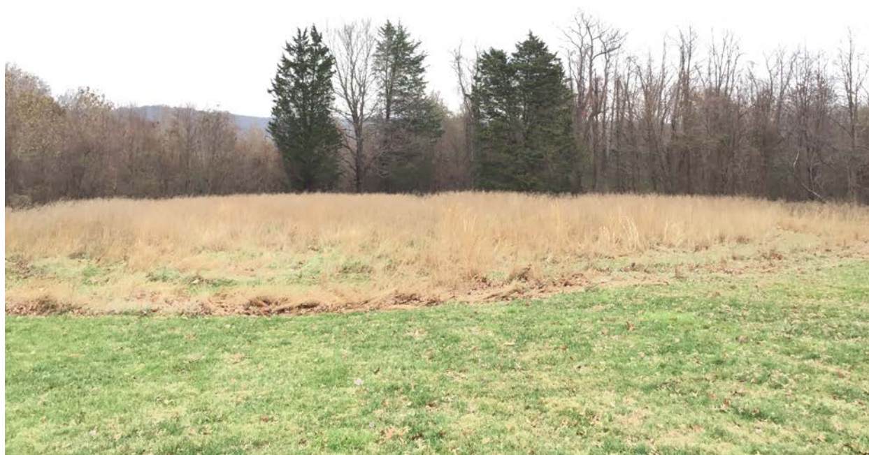
1. Approach to cemetery behind cedar trees, facing east