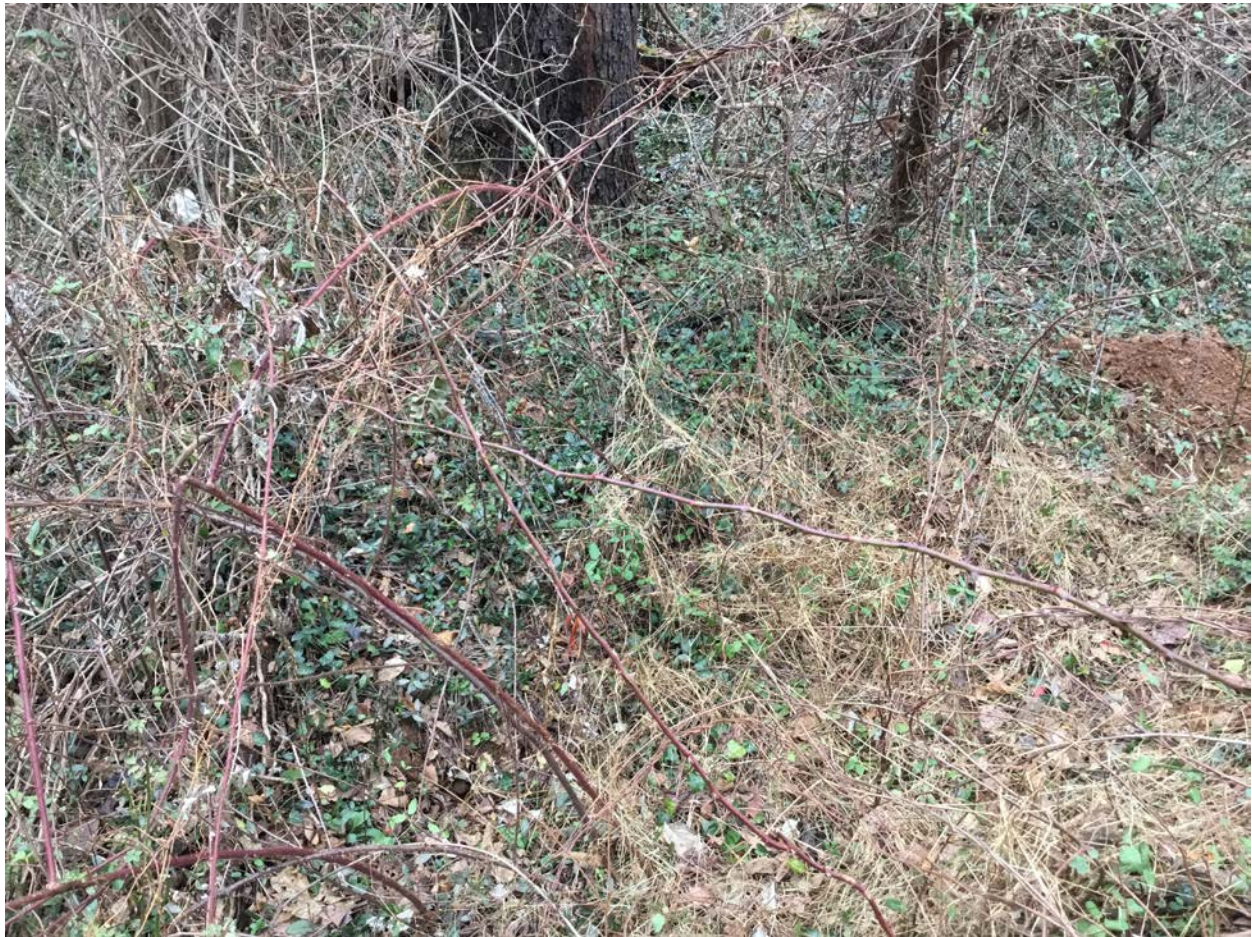
2. Evidence of periwinkle and groundhog holes