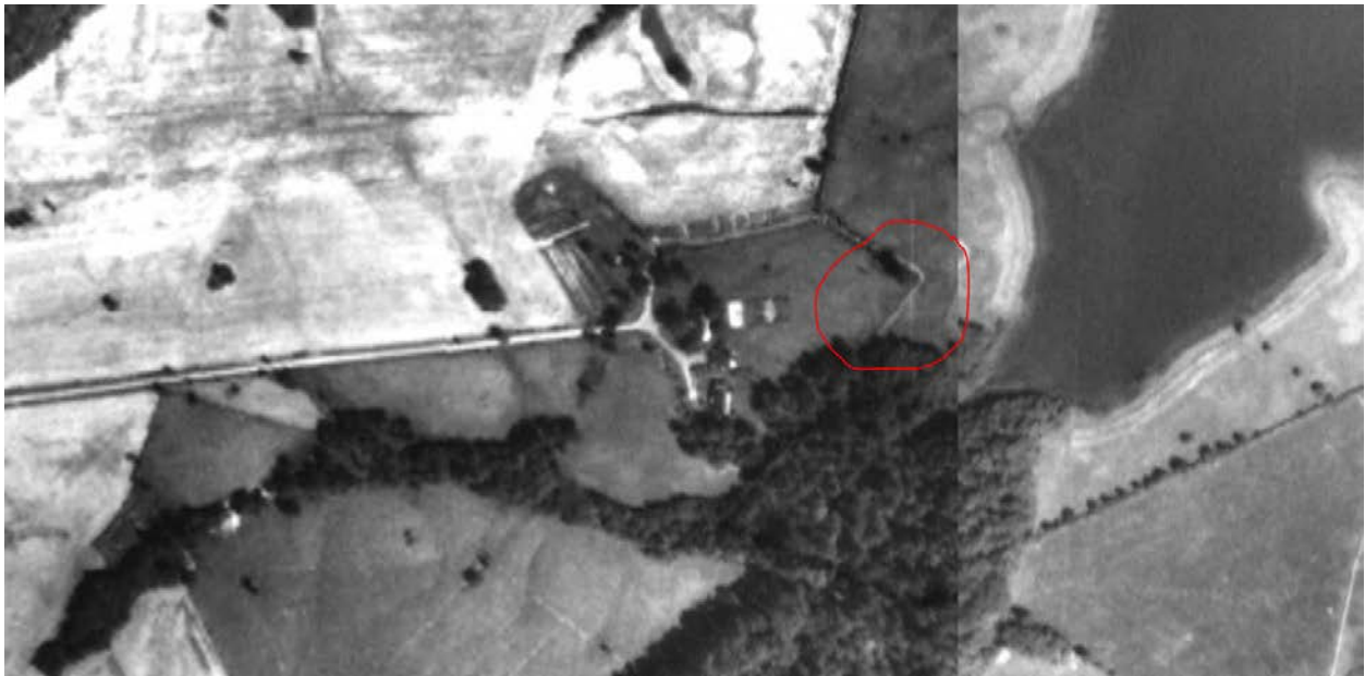
1970 aerial. The same feature is still visible.