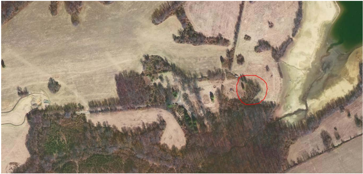
2002 aerial. House is now gone but the land feature is still present.