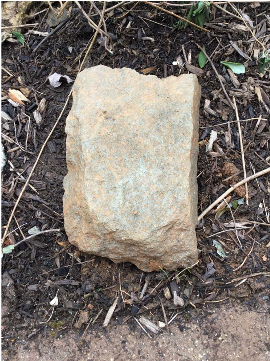
5. Broken carved stone. Possibly bottom of gravemarker.