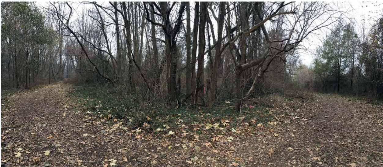
3. Panoramic from west to north to east