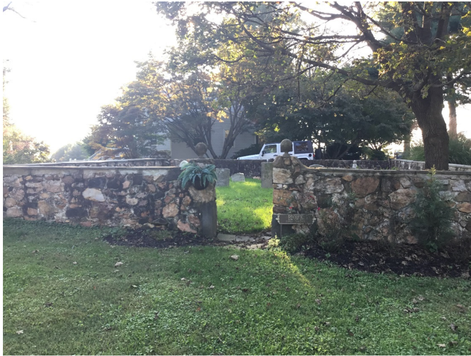
2. Main gate at entrance to cemetery, facing west