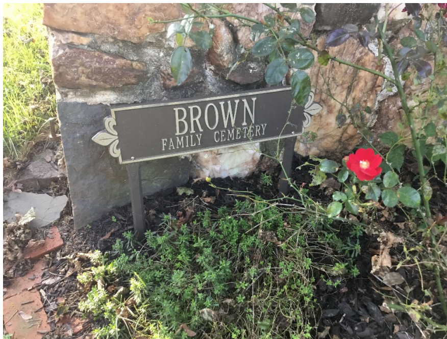
3. Bronze cemetery sign provided by owner