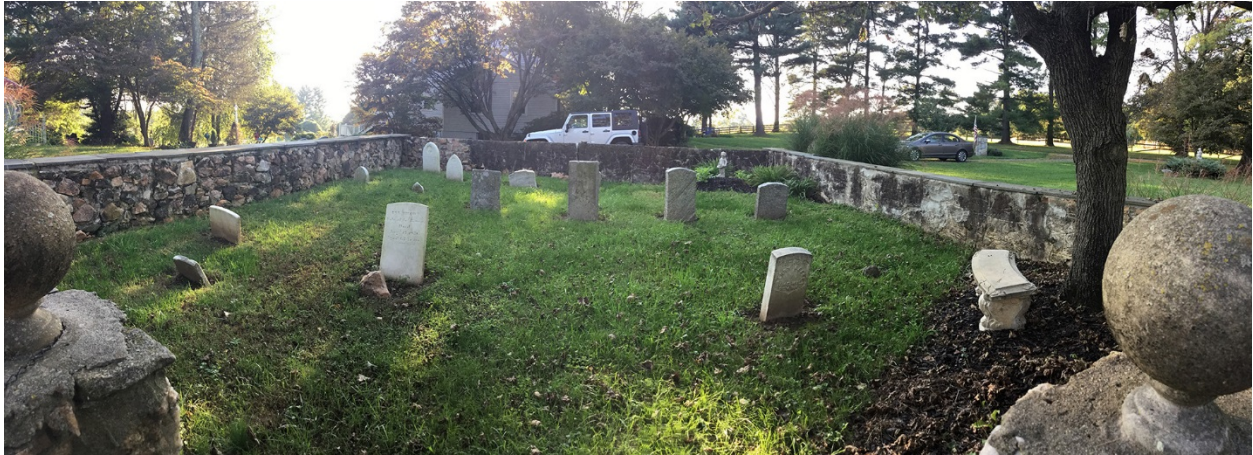
4. Panoramic from south to west to north