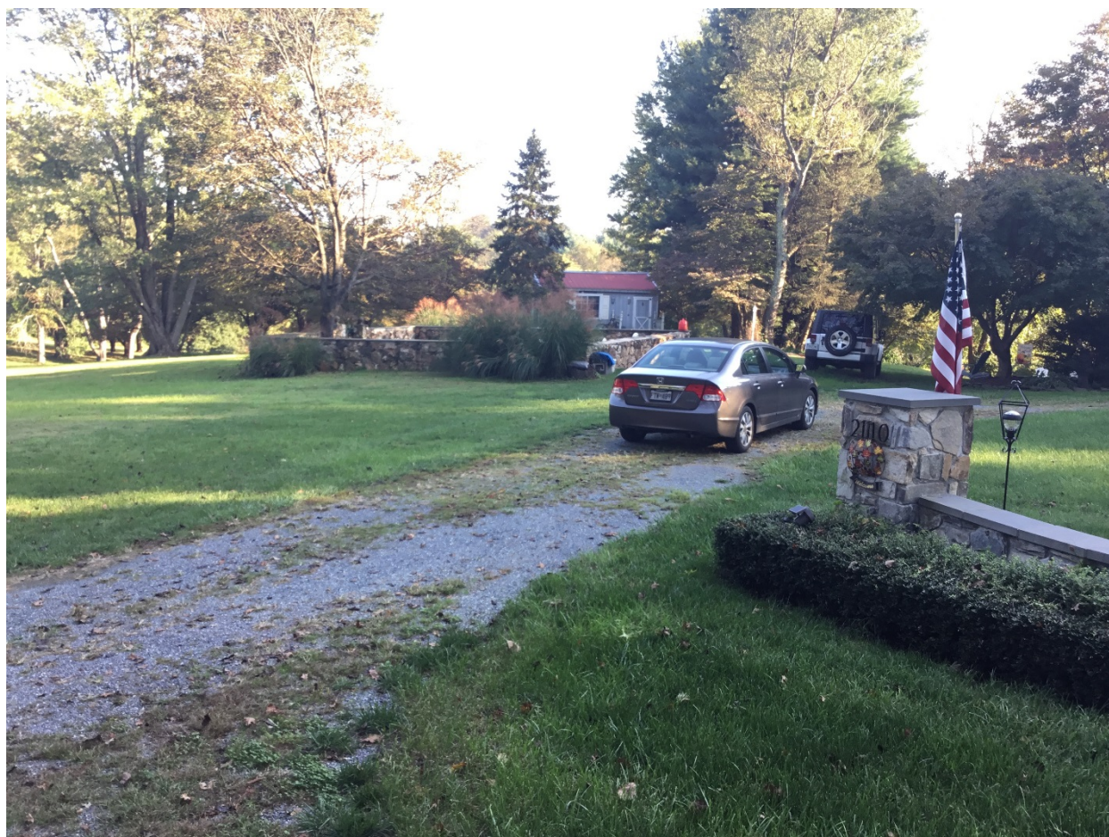
1. Approach to cemetery at 21110 New Hampshire Ave., facing south